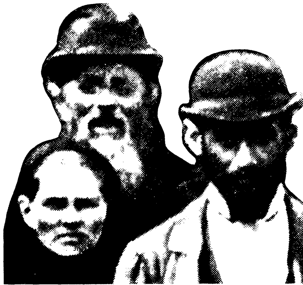
Jews in flight from Russia find shelter in Austrian Lemberg, June 1882.

"The excesses [pogroms—P.N.] that had occurred were aroused not because of the national or religious affiliation of the Jews, but were a response to the exploitation to which the broad masses