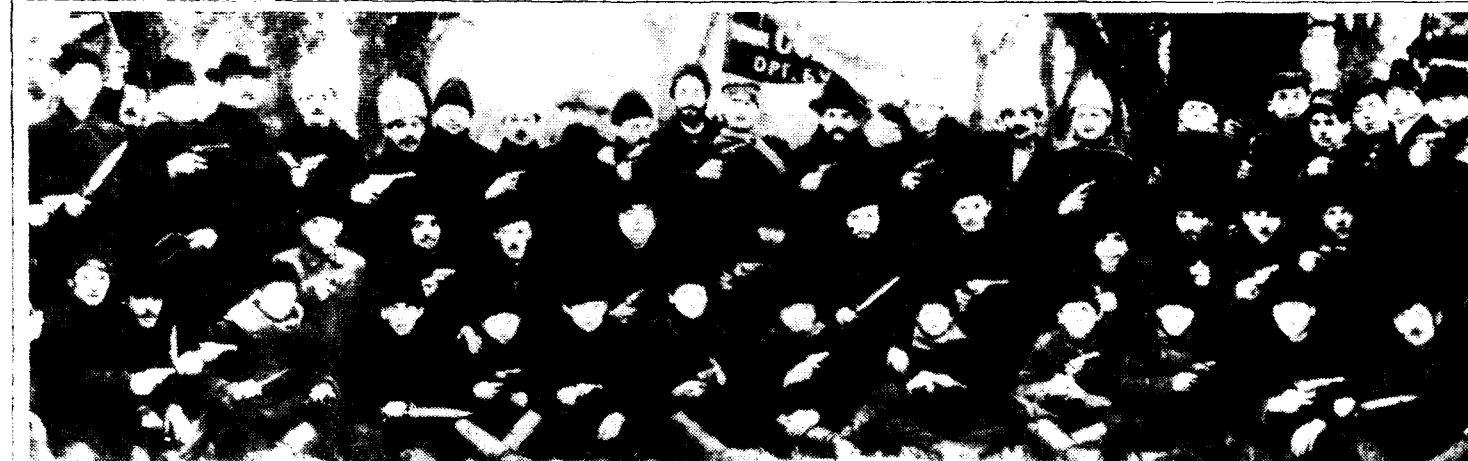
Jewish defense groups organized in 1905 in Pinsk, then a part of Russia, against pogroms.