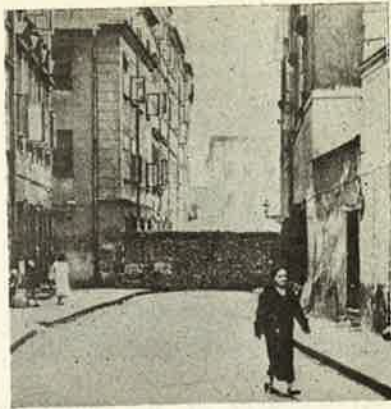
A section of the Ghetto wall in Warsaw

Mosley's Fascists in England pasted swastikas on Jewish homes and painted a sign "kill the Jews" on the wall of a synagogue. But the Prime Minister Neville Chamberlain, the Primate of the Church of England, a number of outstanding Englishmen, including J. L. Garvin, the editor of the Nazi appeasing organ, The London Observer , formally repudiated anti-Semitism or any other form of racial discrimination "in the name of the vast majority of Christian English people" and promised to combat anti-Jewish manifestation "by all power at their command." Hitler-fed Rexists, utilizing the Flemish problem, caused a Nazi flare-up in Belgium. But at the very zenith of Hitler's power, shortly before the outbreak of the