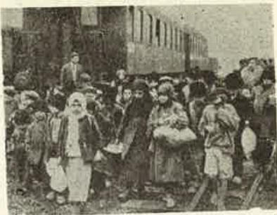
Roumania, 1936, Jewish children driven from their homes

from the same stand. The second time it was the mad fulminations of a Catholic priest, the head of a church of prominence, an editor of a popular Catholic journal, and a radio speaker of a large following. It was the activity of this priest, Rev. Charles Coughlin, and the ramifications of his movement, that constituted the acuteness of the Jewish problem in this country at the outbreak of the war.