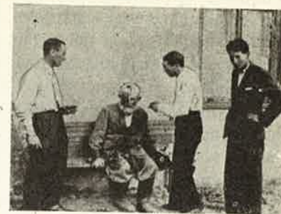
After the pogrom in Czestochowa, Poland, 1937

In the United States anti-Semitism has gone through, in quick succession, a whole chain of historical stages. It began as a medieval religious prejudice because of the refusal of the Jews to accept Jesus as their Messiah. As this motive began to lose its potency, anti-Semitism assumed the form of social snobism. One could have nothing against the Jewish religion,