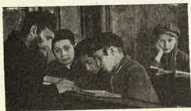
A cheder in Vilna, before the war

Only twice in recent history has violent anti-Semitic agitation in this country come from what one might call a respectable source, and both from the city of Detroit. Once it was the propaganda carried on in his newspaper by an ignorant, egotistical, and queer industrialist, who had it in for bankers and Bolsheviks, when some one sold him the idea that the Jews were both at the same time. Pressed before the court of law and public opinion, he repented and, on other occasions, came out openly against anti-Semitism and other forms of racial prejudice. But some of his lieutenants carry on the same work