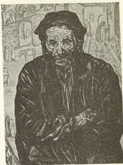
A Yemenite Jew in Palestine (painting)

laration. This wavering policy, always tipped to the Arab side, swung clear over in 1939, practically repudiating the Balfour Declaration, in the MacDonal White Paper issued on May 17 of that year. This Paper limited the Jewish immigration into Palestine to 10,000 a year for the ensuing five years, plus a bonus of 25,000 Jewish admissions in consideration of the Jewish tragedy in Europe. After March 1944 Jewish immigration into Palestine would be disallowed absolutely "unless the Arabs of Palestine are prepared to acquiesce in it." The Paper further granted the High Commissioner "general powers to prohibit and regulate transfers of land," which closed the door to further Jewish coloniza-