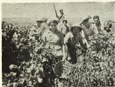
Palestinian grape growers

The following years, up to the outbreak of the war the situation of the Jews in Poland grew steadily worse, although this seems hardly conceivable. All the annual reviews of the events in Poland affecting the Jews for that period begin with that tragic cliché to the effect that the "opening of the year under review the situation of the Jews in Poland took an extremely grave turn for the worse." There were major pogroms, like that of Przytyc, which shocked the civilized