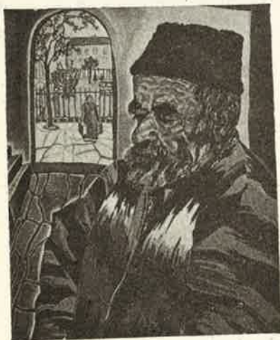
A Jew of Jerusalem, born in Bukhara

In other words, the new policy forcibly freezed the Jewish population of Palestine in its present status of a minority of about 33% and then turns the country over to the majority. That it puts an end to the Jewish aspirations in Palestine is evident. That it is a clear violation of the Balfour Declaration was admitted by Winston Churchill in a speech in the British Parliament, on June 19, 1939, in which he said: "There is much in the White Paper which is alien to the