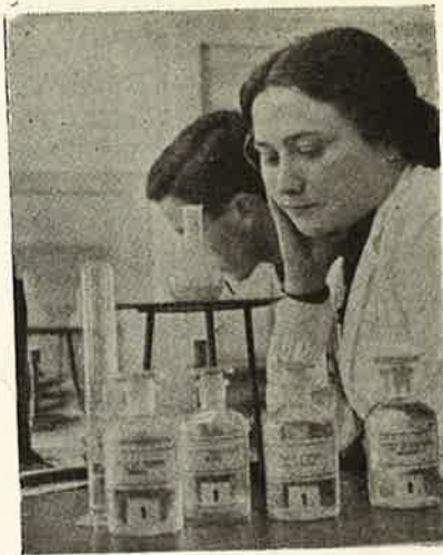
Laboratory in Palestine

The soil in which the Jewish problem of Europe was rooted has likewise been fundamentally affected by the course of the war. The critical, impossible social economic conditions of the countries suffering, in consequence, from an acute Jewish problem have not been