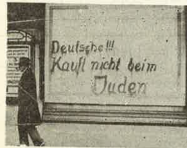
Boycott of Jews in Berlin

There were no objective social or economic irritants in the relationship between the Jews and non-Jews in the country to warrant this agitation. The charges brought against the American Jews by their detractors were copied out of old, foreign sources—from the Protocols of Zion to the Volkischer Beobachter —bearing no relation to the American scene. An exhaustive study of the position of the Jews in America made