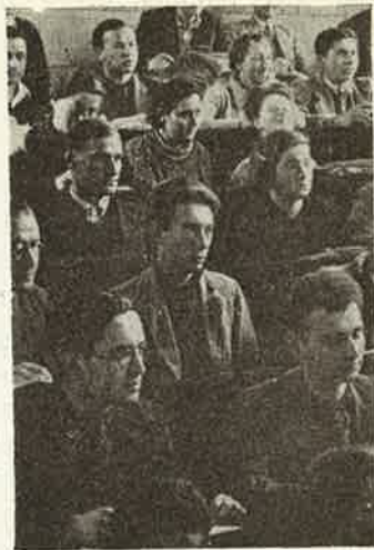
Lecture Room in Palestine

In Palestine the war served to accelerate the economic development of the country, both in the domain of agriculture and in the field of industry—Jewish industrial production increased from $32,000,000 in 1937 to $80,000,000 in 1942. Nearly 200 of the new industrial establishments were engaged directly in war work. About 50,000 Jewish refugees, including 4000 children, entered the country since the outbreak of the war. The political situation, however, remained as bad, if not worse. The White Paper went into effect, as scheduled, despite almost universal