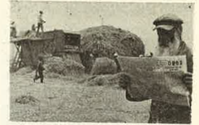
A Jewish Farmer in the Ukraine

The 3,000,000 Jews living in Poland found themselves at the opposite extreme. Their Jewish problem was most acute, fundamentally even worse than that of the Jews in Nazi-Germany. The plight of the German Jews was an artificial condition temporarily produced by a diabolical maniac and a murderous fascist clique, whereas the desperate situation of the Jews in Poland was rooted in the very foundation of the Polish state. The history of the Jews under the Polish republic