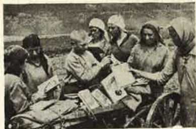
Jewish peasant women in the Moldavian Soviet Republic selecting some new Yiddish text-books