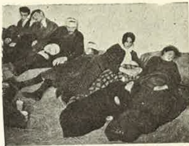
"Victims of a Pogrom"—painting Minkowsky, famous Jewish-Polish artist.

A summary of the Jewish problem in Europe as it existed before World War II shows, then, that one half of the Jews of Europe either had no Jewish problem or had one that was so minor as to permit them a free, fairly secure and decent life. The other half found itself in varying degrees of Jewish problems. In each case, the