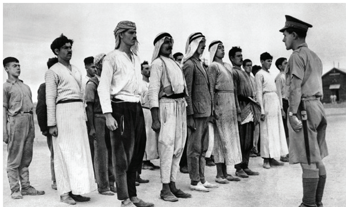
Arab recruits line up in a barracks square in the British Mandate of Palestine (1940)