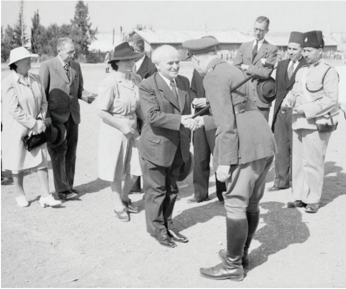
Mr. and Mrs. David Ben Gurion of the Jewish Agency and Viscount Gort, the new Commissioner of Palestine (1917)