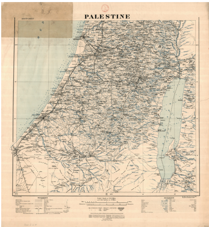
Map of Palestine (1924)