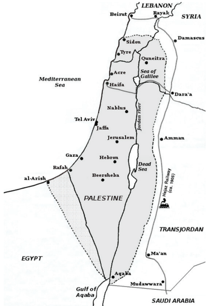
Palestine claimed by the World Zionist Organization (1919)

antithetical to their moral of national determination, to their anti-imperialism which was truncated by the preservation of Arab-Jewish rivalry, and to the human decency which is appalled by the terror that is contained in softly spoken words like “transfer.” Partition was just “British imperialism” by another name and method, and thus was not to be tolerated by the British Communists.