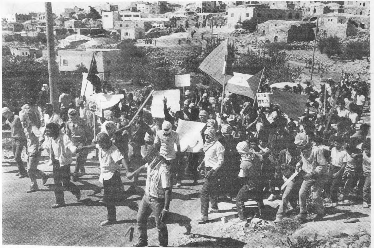
Demonstration at funeral for two youth killed by Israeli death squads in Yatta, West Bank, October 1988.

military censorship on any news articles about Soviet Jewish immigration. But it is known that direct housing subsidies to settlers who choose the West Bank or Gaza range up to $21,000, and those building their own homes are given land at 5 percent of its assessed value. Interest-free mortgages are given to settlers at 65 percent of the loan's value with reduced interest rates for an additional 25 percent of the loan.