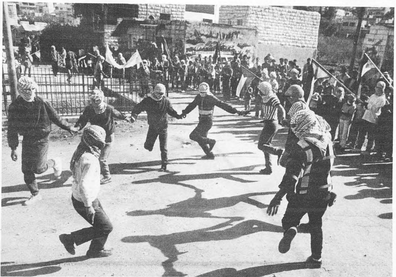
Palestinian youth dance in Sa'ir, December 1988.