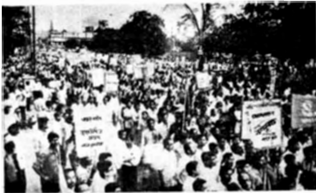
26th March demonstration at Calcutta protesting the ghastly murder of Comrade Sujauddin Akhand.

And that it is true, that by murdering Comrade Sujauddin Akhand the vested class will not be able to dampen the spirit of the poor toilers of the locality, on the contrary, they will (Contd. to Page 4)