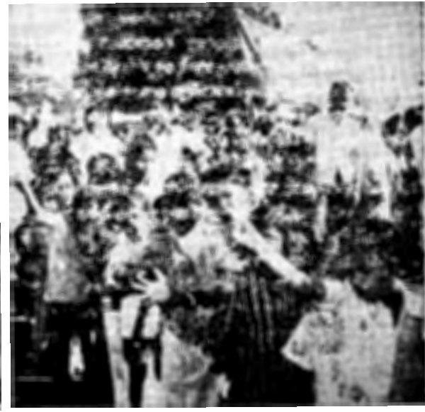
A portion of the Protest Demonstration of Students-Teachers-Guardians on 19th March