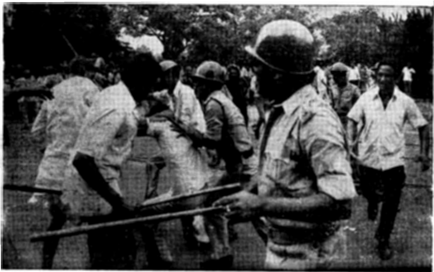
Who are these plain clothes men along with the police beating the marchers ?

stand how could a 'Left' party mount such a savage attack on a legitimate democratic mass movement. Should we still consider them as Left? "Friends, we have faith in You carry on with your task. If anybody can accomplish, it is your party. But remember, they are extremely hostile to you. They have become