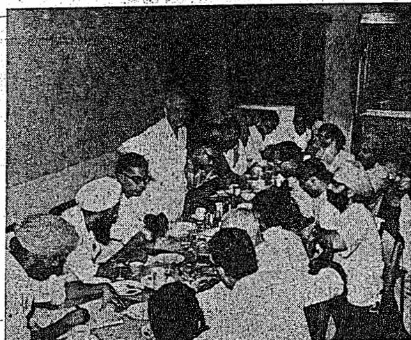
Top: A section of Amritsar Rally. Above: Dange addressing a Press Conference at Jullundur. Below: Dange congratulates a star signature collector.

And the Punjabis will be coming to Delhi for the Great March—IN HUGE JATHAS from every district. You will see them marching, in their thousands, on September 13.