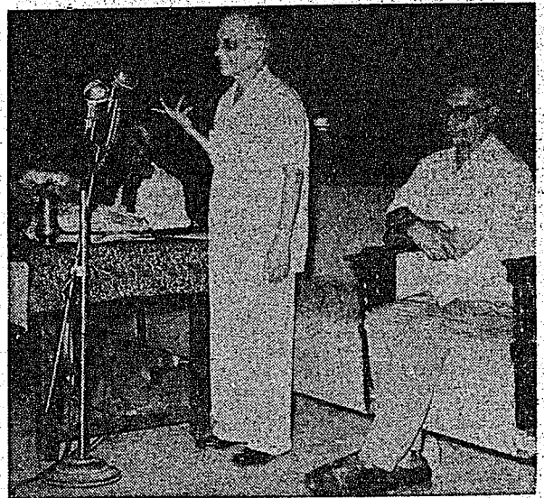
Dange addressing Luddiana Rally.

● Each State contingent of marchers should include two doctors and its own arrangements for those falling sick or needing any sort of medical attention.