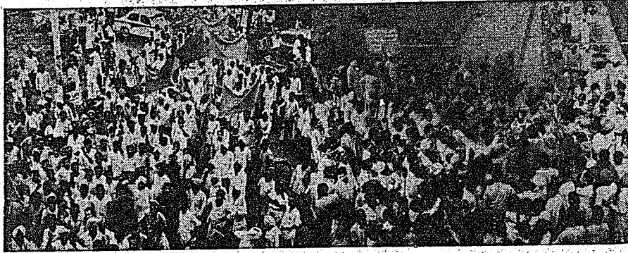
Thousands gathered everywhere to receive and greet S. A. Dange in Punjab.