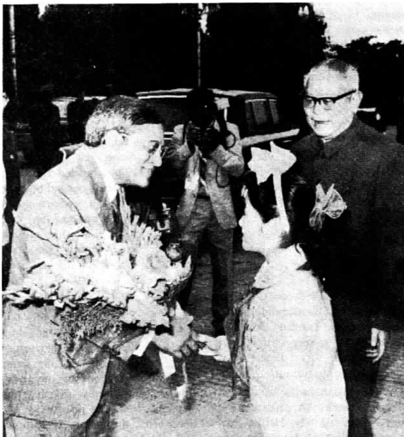
Maldivian President Maumoon Abdul Gayoom is welcomed by President Li Xiannian and a flower-bearing child.

President Maumoon Abdul Gayoom of the Republic of Maldives, during his recent visit to Beijing, told China's leaders that the third world countries are impressed with China's growth and achievements.