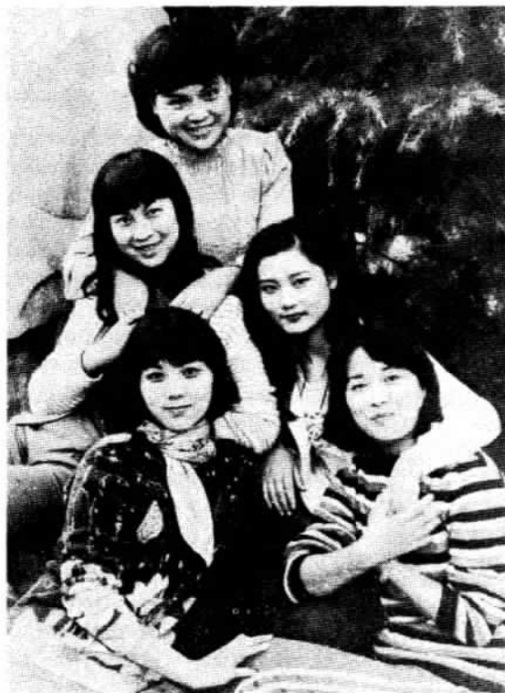
Young players of the "Budding Hundred Flowers" opera troupe.

The 23-year-old girl who portrays the old father leaves a deep impression on the audience with