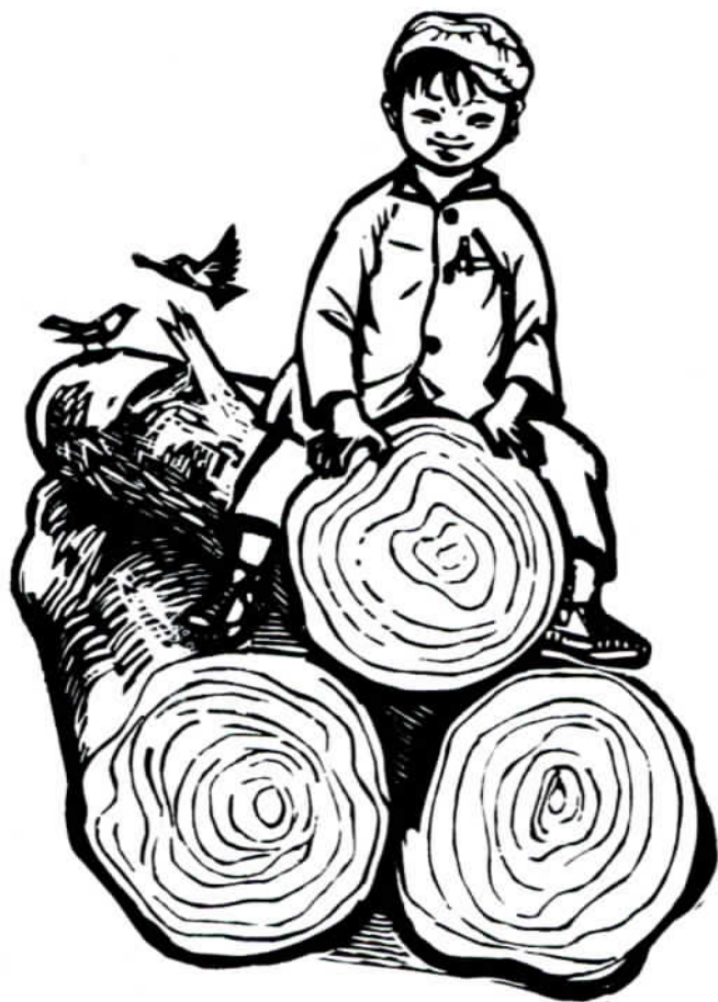
A Boy in the Lumberyard.