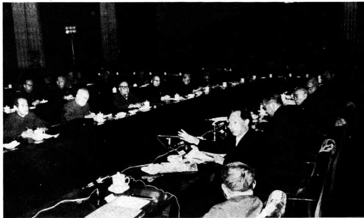
Hu Yaobang speaks at meeting with members of democratic parties and people without party affiliation on reform of the economic structure.

At a meeting with members of democratic parties and people with-