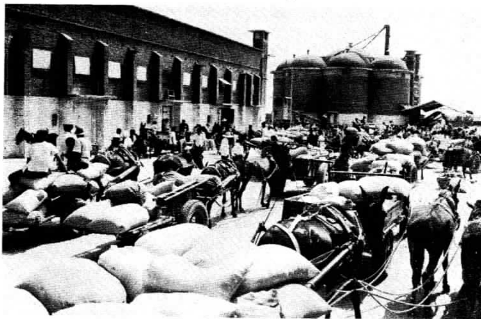
Peasants in Shahe County, Hebei Province, sell grain to the state.