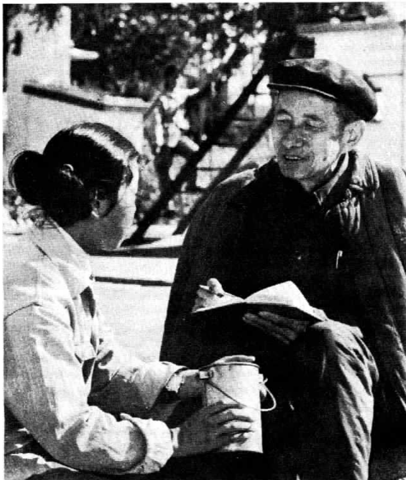
Poet Ai Wu (right) chatting with an oil extraction worker.