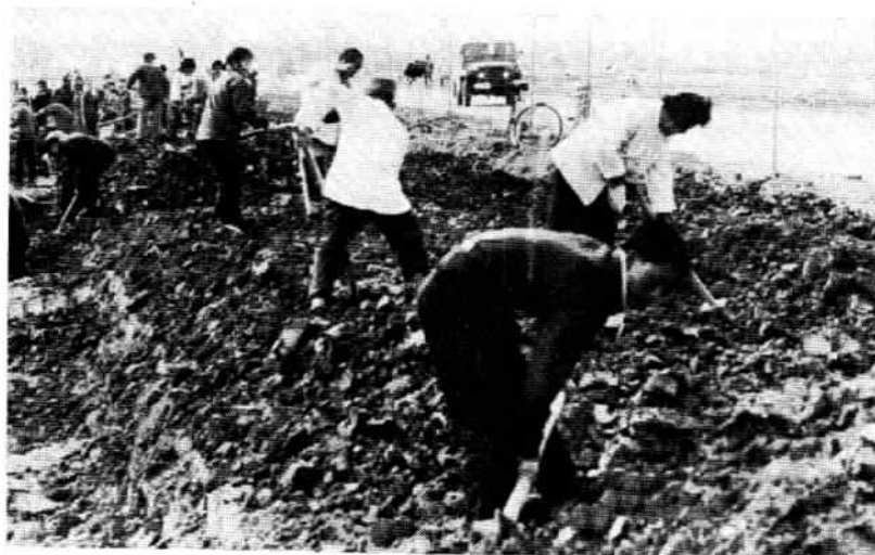
Peasants in Fengyang County widen the road.

Some people are concerned that the household contract system will handicap the growth of collective projects. But practice has proved that the responsibility system can not only increase the peasants' income and enable some peasants to get rich first, but can also spur the