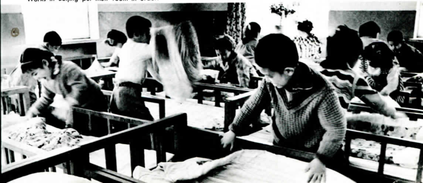
Children at the kindergarten of the Yanshan General Petrochemical Works in Beijing put their room in order.