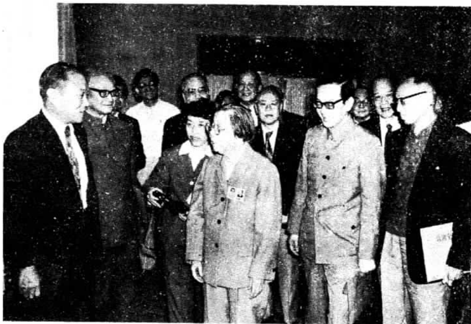
Chairman Deng Yingchao talking to members from Hongkong and Macao.