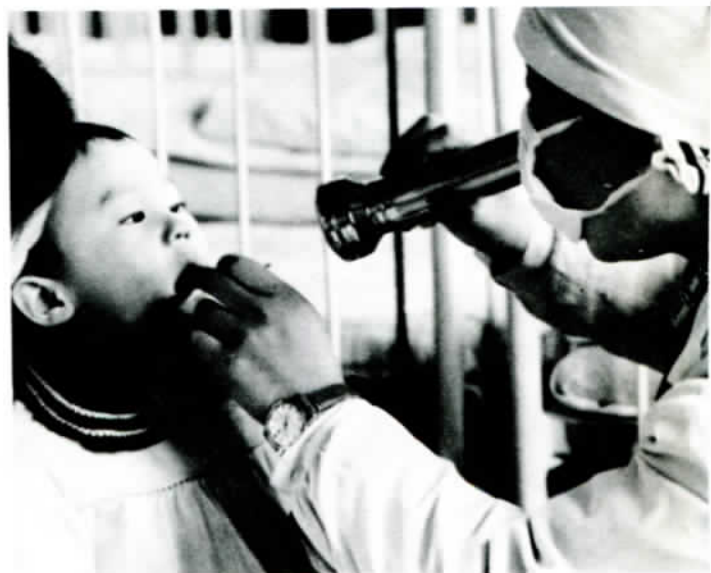
A doctor with the Beijing No.2 Cotton Mill gives children regular checkups.