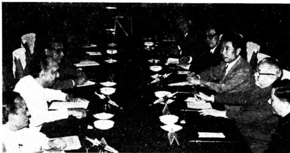
President Li Xiannian (second from right) in talks with Sri Lanka's President Junius Jayewardene (second from left).

Thriving commodity production has helped improve the people's livelihood. By the end of 1983, savings deposits in the delta totalled 5,450 million yuan, a 4.5-fold increase from the end of 1978. Interestingly enough, the first three sets of combination furniture worth 3,000 yuan each sold at the Nanfang Building in Guangzhou were all bought by delta peasants.