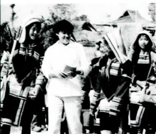
Jinuo students in Yunnan gather round their teacher.