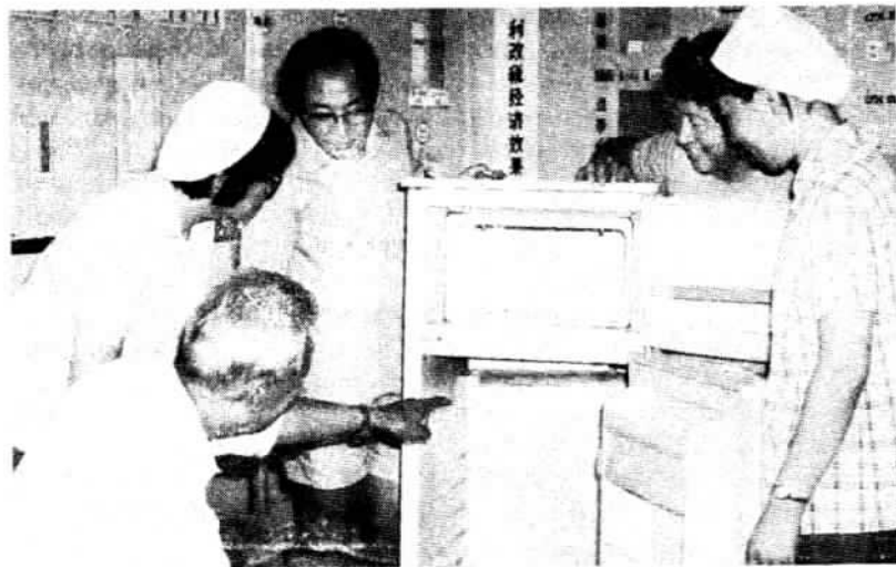
Customers inspect "Snowflake" refrigerators, produced by the Beijing Refrigerator Factory, which have become much sought after.

Between 1979 and 1985, the central authorities and local governments invested 10,300 million yuan in the capital construction of light industry, and 120 large and medium-sized projects were completed. At the same time, heavy industry provided more equipment and technology for the existing light industrial enterprises, and several hundred heavy industrial factories switched to the manufacture of light industrial