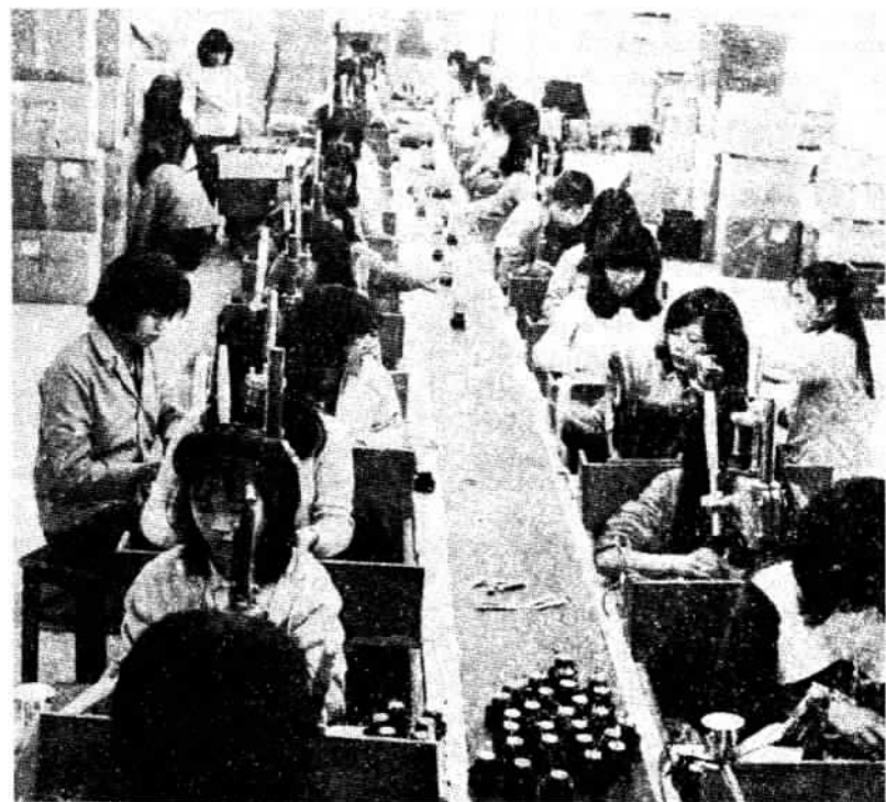
Peasants in Baoan County, Guangdong Province, produce electrical appliances in a factory operating in co-operation with a US company.

Foreign capital and imported advanced technology and equipment have also played an important role in quickening the delta's economic growth. In five years the area has signed 24,000 contracts with companies in Hongkong and Macao and foreign countries involving US$4,000 million in foreign investment, of which US$1,080 million have already