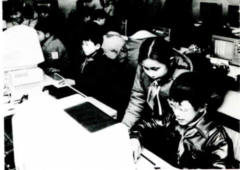
Inside the children computer centre of the China Welfare Institute, Shanghai Branch.