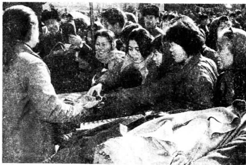
Peasants in Hebei Province on a buying spree for synthetic fabrics.

Since 1979, some 1,000 new light industrial products, with about 10,000 new varieties and specifications, have been put on the market every year. The quality of most products is improving, and nearly 1,000 famous brands have sprung up. Some of the traditionally