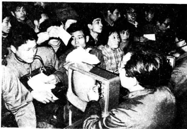
Shoppers in Chengdu buying TV sets.

The "No. 1 workshop" of this corporation has 57 technicians responsible for designs, mixing colours and production techniques. Through investigation and study, they have a good grasp of con-