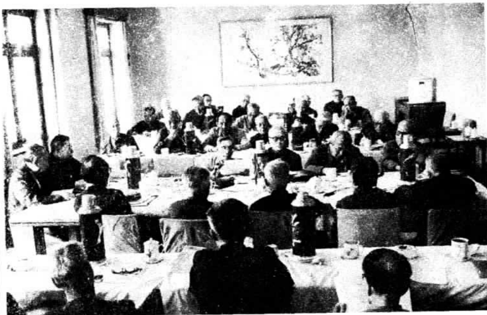
The CPPCC China Democratic League group discusses Premier Zhao Ziyang's NPC report.