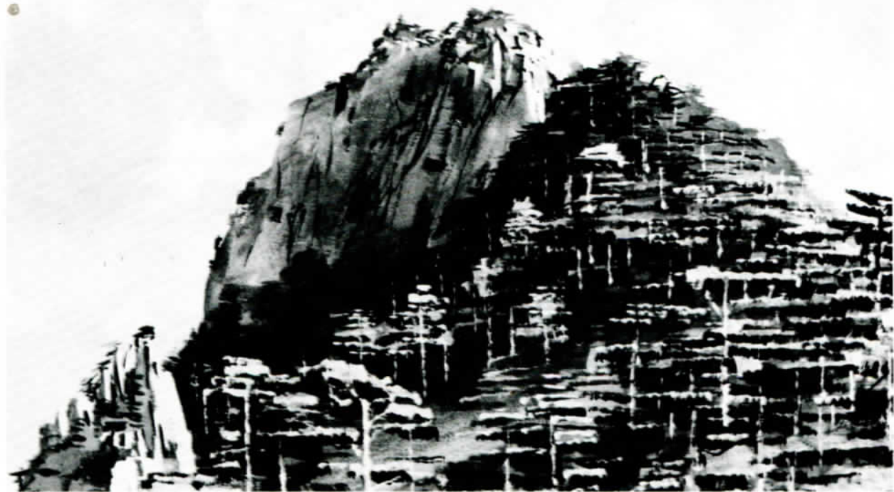
The Huangshan Mountain.