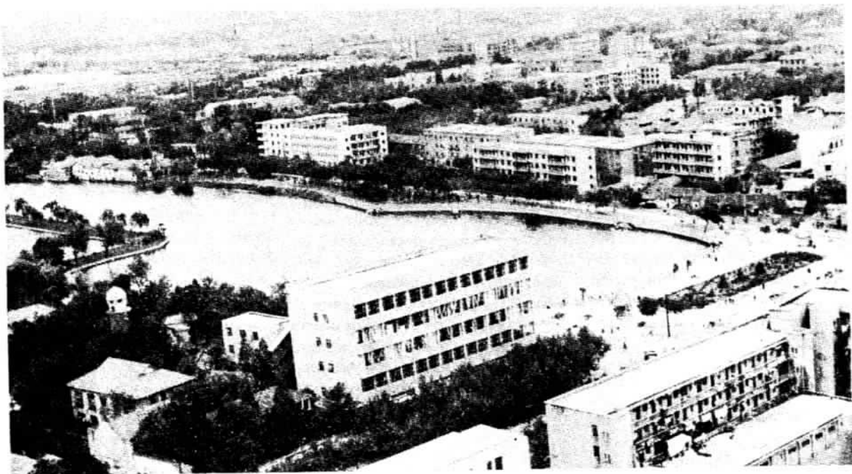
An aerial view of the textile industrial zone of Shashi.

sumer trends and constantly weed through the old to bring forth the new. For instance, they found out last year that people are demanding new colours and designs for their bed sheets. They designed a kind of mercerized bed sheet in a jacquard weave, featuring large patterns. The sheets are bright and silky, and the patterns give an almost stereoscopic effect. At the sales exhibition held in Beijing last autumn, these sheets become the items in greatest demand.