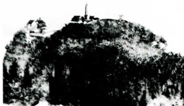
White Pagoda Mountain in Lanzhou.

Born in Hongkong in 1935, Jiang Jianguo is now in charge of the art designing department of the Beijing Museum of Natural History. His bright and colourful works reproduce picturesque landscapes with powerful strokes.