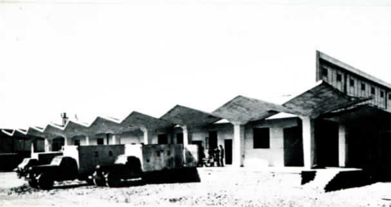
Cold storage complying with Moslem dietary laws has been built in Yinchuan. The freezers can hold 1,800 tons.