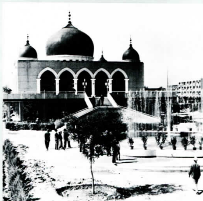
A mosque in the Nanguan district of Yinchuan.