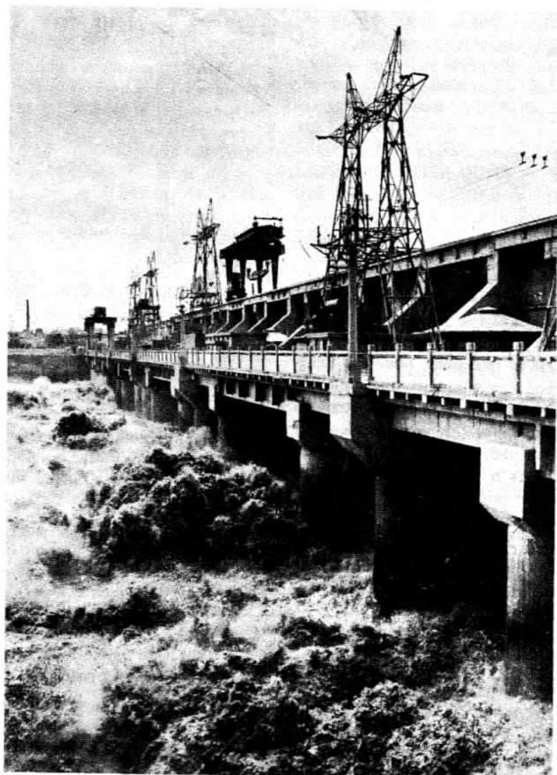
The 272,000-kilowatt Qingtong Gorge Hydropower Station.

After the tempestuous Huanghe (Yellow) River enters Ningxia, its current gradually calms. Through the Qingtong Gorge Dam, the water flows into the irrigation canals which crisscross the Yinchuan plain, nurturing vast tracts of