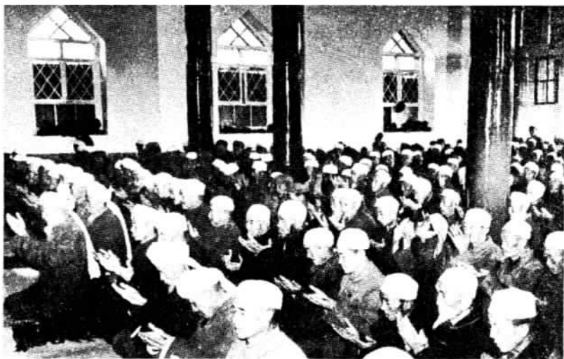
Worshippers gather at their mosque.