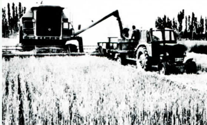
Bringing in a bumper wheat harvest for 1983 in Ningxia.