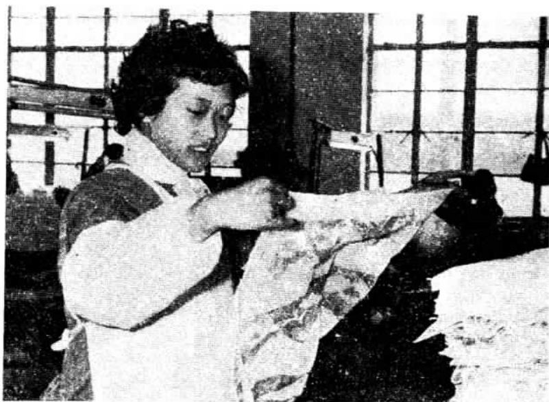
Silk produced in Shengze sells well in 50 countries and regions around the world.

After liberation, district government and commune administrative offices were successively set up in Miaogang, while Lugang and Genglou became part of townships and brigades under Miaogang. Beginning in 1956, the commercial enterprises of the two smaller towns were gradually merged into state-run shops in Miaogang, and most commercial workers were transferred to commune-run enterprises. During the later period of the "cultural revolution" the market of Genglou was completely swallowed up and the town reduced to a mere rural residential area. Lugang, owing to its superior location, remained as a town with two department