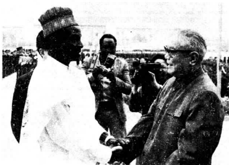
President Li Xiannian welcomes Seyni Kountche, the Niger head of state.

Zhao reiterated that China's policy of working for more fruitful economic and technical co-operation with Niger and other third world countries would not be changed.