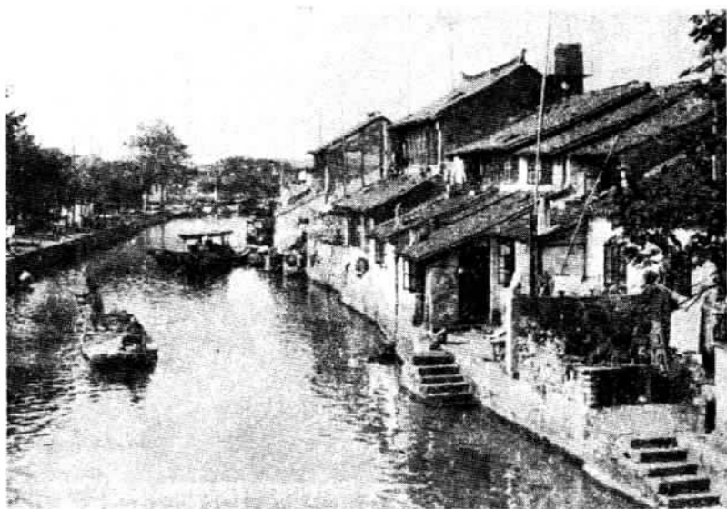
Tongli, a small town in Wujiang County.

was synonymous with laziness and living off the labour of others, or to put it plainly, exploitation. The concept of production, from the view of the small peasant economy, meant productive labour to the exclusion of commodity exchanges. With this misunderstanding, the active role of small cities and towns in commodity circulation was neglected. Their commercial activities were considered non-productive, or in other words consuming.