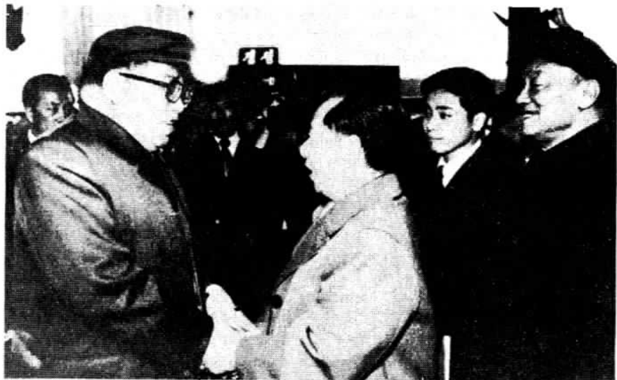
Kim Il Sung sees Hu Yaobang off at Chongjin railway station.

At the farewell banquet in Chongjin, Hu said, "We are deeply impressed by the Korean people's revolutionary spirit of forging ahead ceaselessly, their soaring revolutionary enthusiasm, their lofty morality of respecting civic virtue and observing discipline, and their strong sense of organiza-