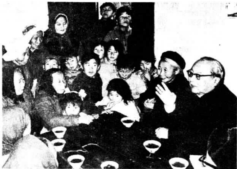
The author talking with local people during a survey of rural areas.

In the two decades since then, little was done to restore the rural commodity economy, as a result of the one-sided emphasis on grain production. However, in 1981,