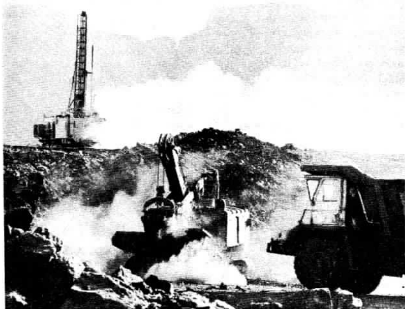
Working a large open-cast coal mine in Shizuishan.