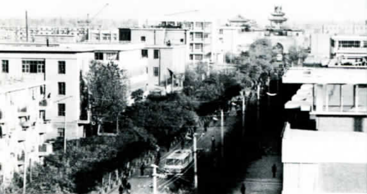
The new look of Yinchuan, the capital of the Ningxia Hui Autonomous Region.