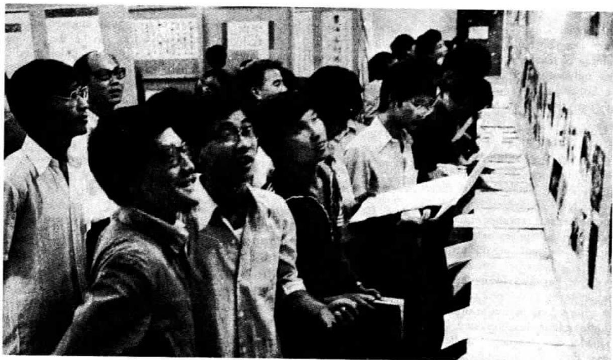
Teachers and students from the Guangzhou Huanan Teachers' University at an exhibition on their group research achievements.