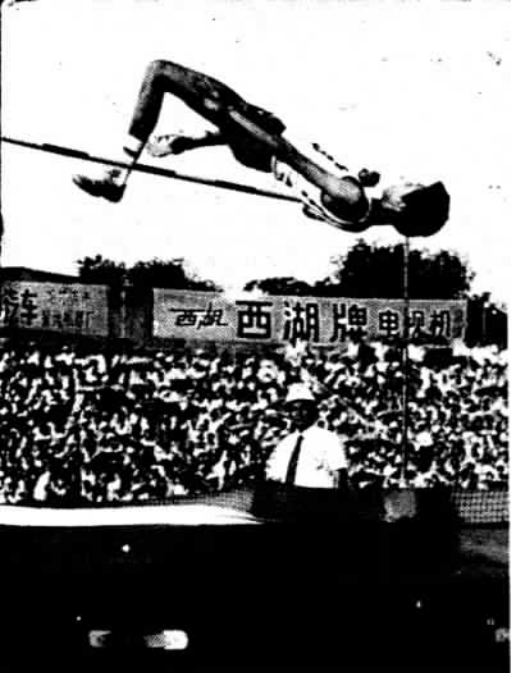
China's 10 Best Athletes for 1983: Zhu Jianhua, 21, from Shanghai.