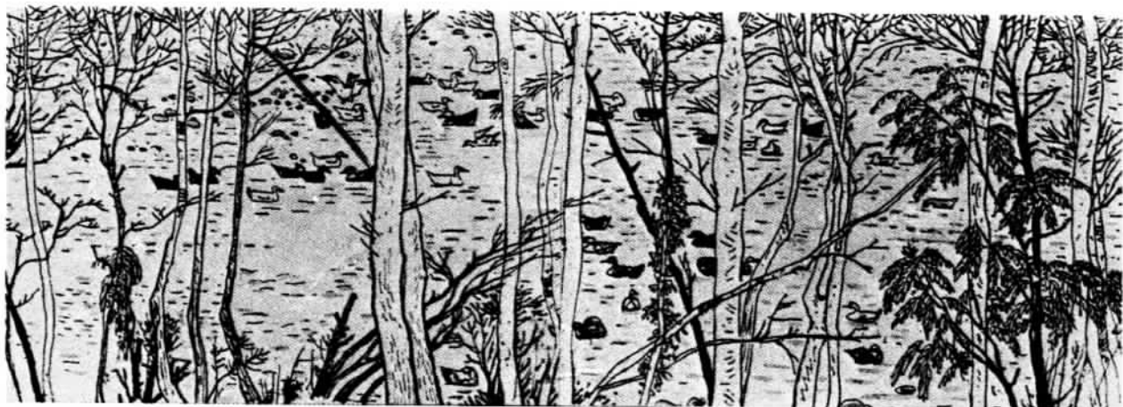
Ducks Through the Trees.