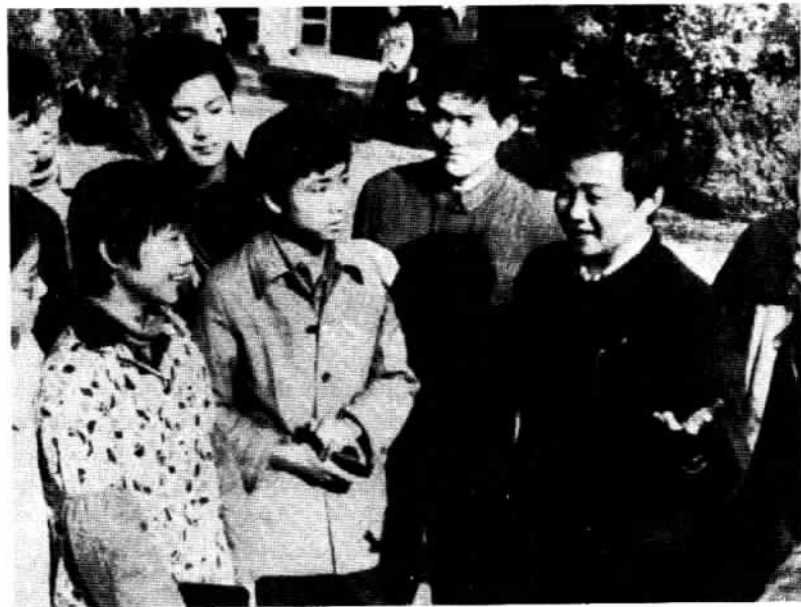
Students from the Shanghai Huadong Teachers' University practise how to give lectures at a middle school.

The problem is how to work out a programme which trains teachers while giving them, at the same time, a university-level education. Some people argue that because graduates of teachers' colleges will be teaching in secondary schools, they should have a good grasp of middle school courses. Then they will be competent at their jobs. That theory, however, is not sound. If a teachers' college is merely a place where teachers