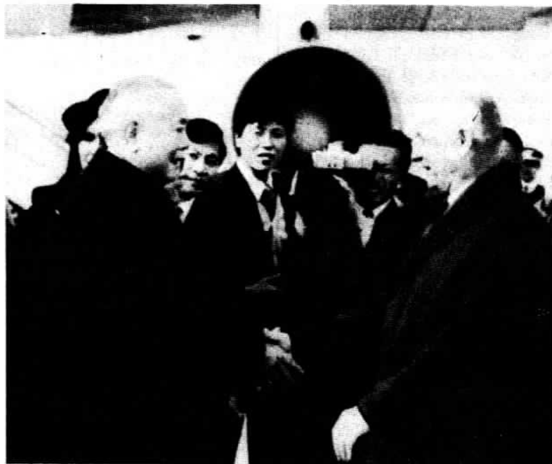
Li Xiannian warmly welcomed by Kenan Evren.

They noted with satisfaction the progress made in Sino-Turkish relations, especially since Evren's first visit to China in 1982.