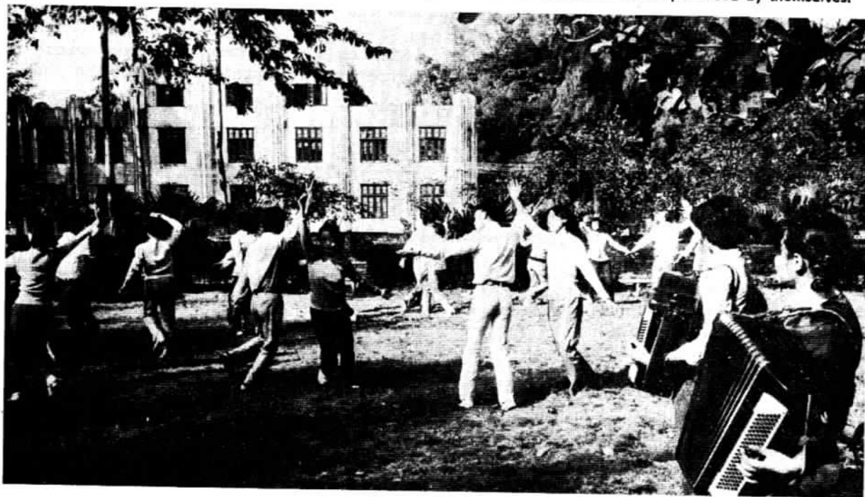
Students at the Guangzhou Huanan Teachers' University rehearse an ensemble dance produced by themselves.

Since vocational technical schools have been re-established with the secondary school educational structure, there is a demand for teachers in such schools. Teachers' colleges should therefore widen the scope of the conventional education offered so far. Reformers of higher teacher education should have the courage to experiment and to try out new ideas. They should never lose sight of the various needs of middle school students in the modern world characterized by constant expansion of knowledge in all areas of human endeavour. □