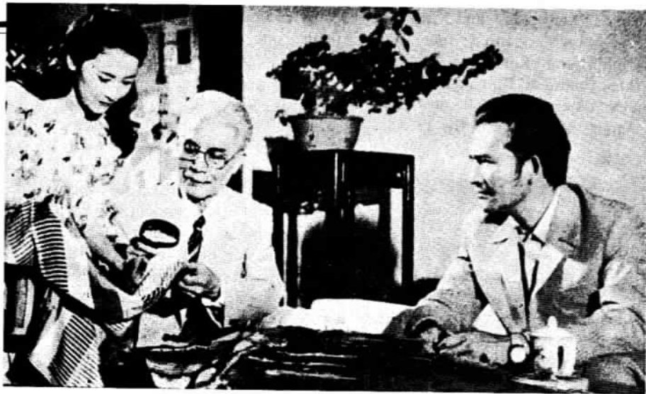
A scene from "Blood Boils."

with the force of old habits, abuses and thinkings, plus bureaucracy.