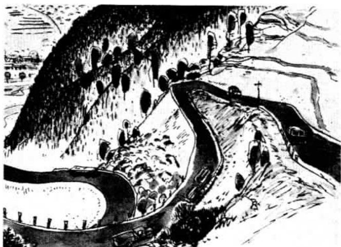
A Winding Highway.