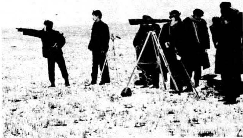
Scientists studying birds in their natural habitat at Poyang Lake, Jiangxi Province.