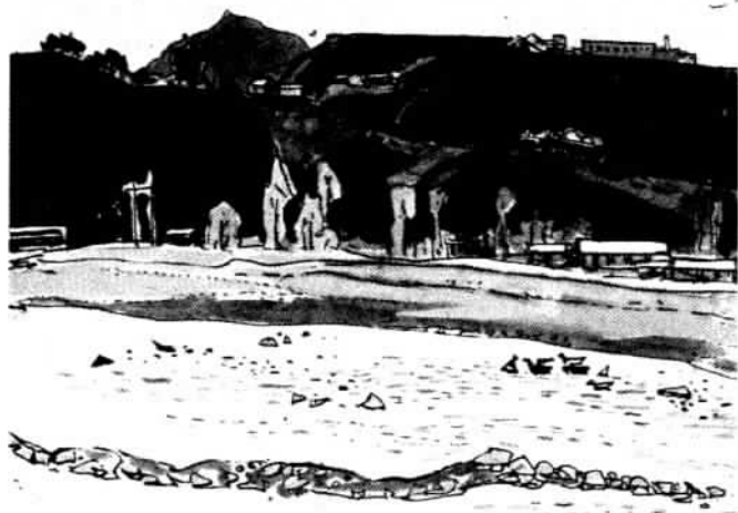
Along the River.