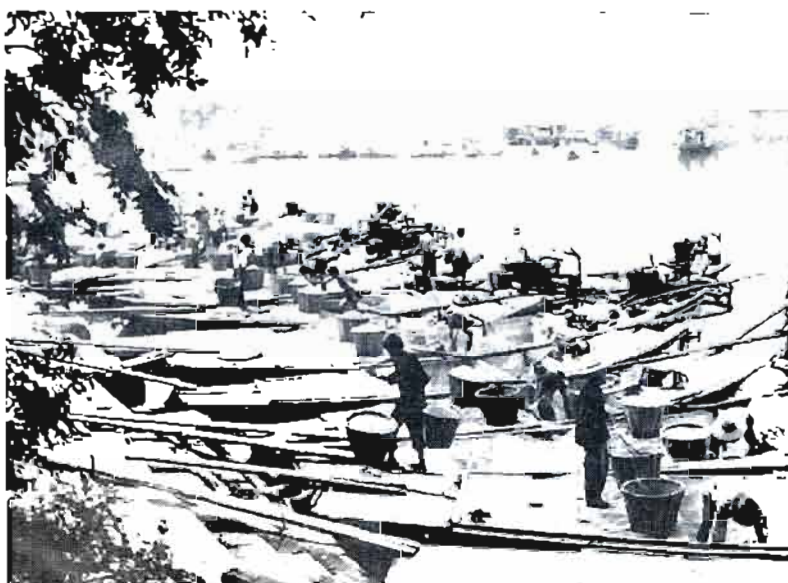
Peasants of Jiaying in east China's Zhejiang Province selling surplus grain after reaping a good harvest of early rice.

With the help of PLA units and the local people, 7,000 railway workers dispatched by the Ministry of Railways braved the