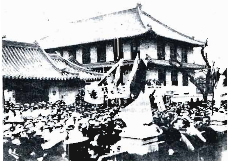
Beijing citizens taking part in the funeral procession for Dr. Sun Yat-sen in 1925.

After experiencing the new-democratic revolution, New