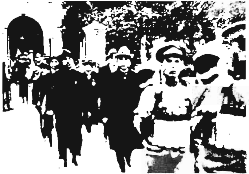
Dr. Sun Yat-sen (centre) and Li Dazhao (left), a founder of the Chinese Communist Party, after attending the First National Congress of the Kuomintang in January 1924.