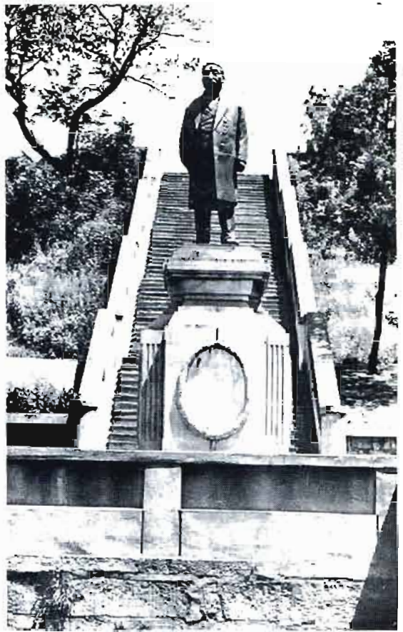
Statue of Huang Xing.

The battle in defence of Yangxia, which lasted for 40 days, added an epic chapter to the history of the Wuchang Uprising. Just a few days after the founding of the Hubei Revolutionary Military Government, the imperial court, trying in vain to strangle the nascent Wuchang Uprising, moved the main force of the Beiyang army to Hubei and launched a large-scale attack. By that time, the Revolutionary Army had already grown into a force of 30,000 soldiers. Though half of them had no training and many still in civilian clothes, they pitched into heated struggle. In the face of the enemy troops which were well-equipped, well-trained and many times more numerous, the Revolutionary Army men fought on resolutely.