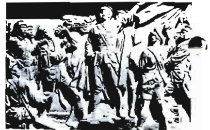
Wuchang Uprising on October 10, 1911. (Part of the carvings on the basement of the Monument to the Heroes of the People at Tian An Men Square.)

The US administration faces hard decisions this autumn at home and abroad (p. 11).