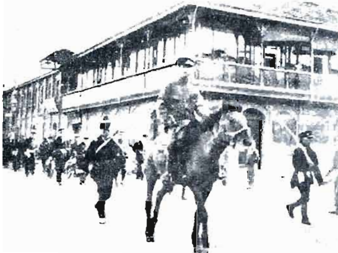
Insurrectionary army men patrolling the streets in Hankou.

Sun Yat-sen's Three People's Principles, though still carried