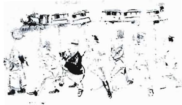
A cartoon carried in a newspaper in 1909, satirizing the Qing government's selling of China's sovereign rights and the imperialist powers' grabbing of the country's railways.

republican system. Neither the landlord class nor the peasantry could conceive of this; only the bourgeoisie could advocate such a system, and Tong Meng Hui was a political party of the bourgeoisie representing the demands of national capital, which had initially developed at the beginning of the 20th century. The league had also included workers, peasants and anti-Manchu landlords. Though the bourgeoisie, its main class foundation, was weak, Tong Meng Hui was nevertheless a powerful political force, being based on an alliance of all anti-Qing classes and able to mobilize the broad masses of people with its anti-Manchu slogans.