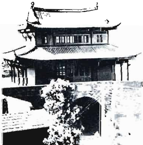
Newly renovated Qiyimen (Uprising Gate) in Wuchang.

the officers and men who had laid down their lives during the battle in defence of Yangxia has been refurbished. In front of the seven graves of martyrs stands a monument erected in February 1912 and inscribed with the words: "Died for the Sake of the Country." Since liberation, Party and government leaders have often visited the martyrs' mausoleum. Youngsters frequently come to this monument as part of their education of learning to respect the revolutionary traditions, carry on the revolutionary cause and develop China.