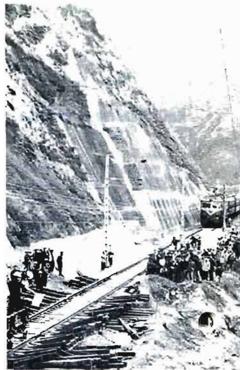
Repairing the railway line from Baoji to Tianshui.

The latest flood took a toll of 764 people; more than 5,000 were injured and 200,000 were