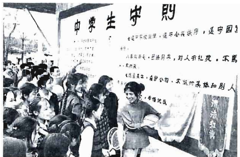
Students of the 3rd Middle School of Guanghua County, Hubei Province, hailing the implementation of the regulations for middle school students.

Vice-Chairman Deng Xiaoping and Premier Zhao Ziyang met on separate occasions with Egyptian Deputy Prime Minister and Foreign Minister Kamal Hassan Aly who arrived in the Chinese capital on September 8. Vice-Premier and Foreign Minister Huang Hua and Deputy Prime Minister Aly had wide-ranging and in-depth discussions on the world situation, the Middle East, Afghan and Kampuchean questions in particular,