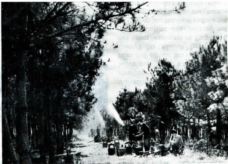
Spraying insecticides in a new forestry area in Jiashan County, Anhui Province.

In Sichuan Province's Yaan County, three people were arrested for the wanton felling