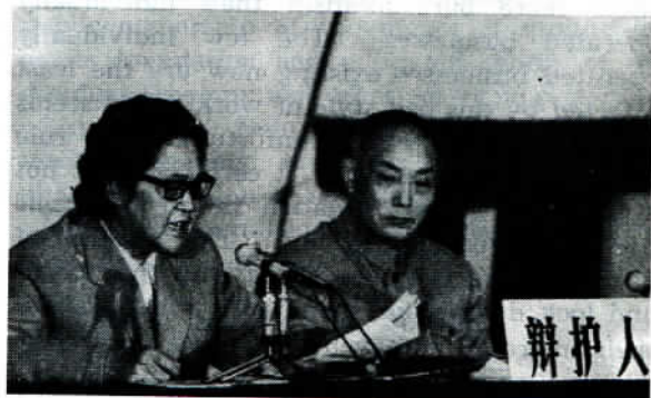
One of Yao Wenyan's lawyers makes a statement in his defence.

When the debate opened, the prosecutor was the first to speak. He noted that court investigations proved that Yao Wenyan had, together with Jiang Qing, Zhang Chunqiao and Wang Hongwen, formed a counter-revolutionary clique with the aim of overthrowing the dictatorship of the proletariat and the socialist