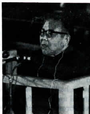
Huang Yongsheng in the dock.

The Second Tribunal held three sessions of heated debates on the charges in the indictment against Huang Yongsheng (former chief of the P.L.A. General Staff). They took place on December 18, 19 and 20, in the afternoon.