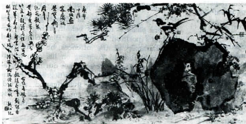
An impromptu group painting by 12 artists at the Xiyuan Hotel for the "Beijing Ribao."

Distributed by GUOJI SHUDIAN (China Publications Centre), P.O. Box 399, Beijing, China