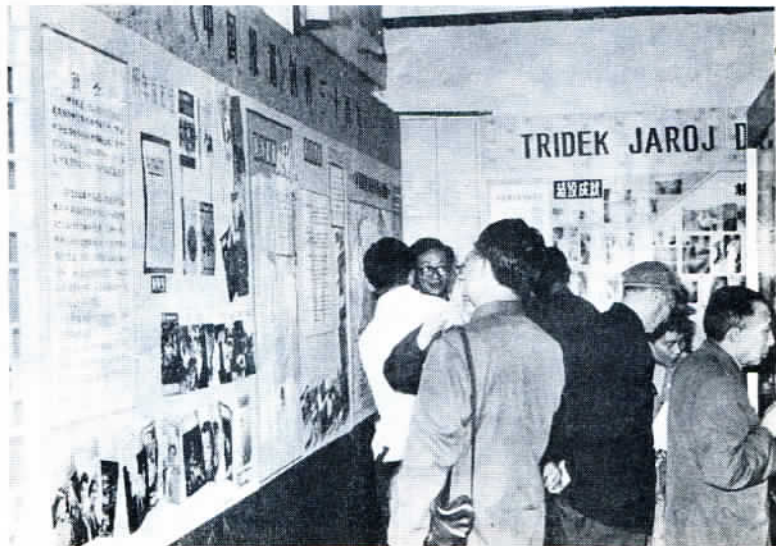
Exhibition of Esperanto books and periodicals in Beijing.

Besides El Popola Cinio , some 200 titles of books in Esperanto have been put out since the founding of New China in 1949. Radio Peking has been broadcasting in Esperanto many hours a week. Chinese Esperanto users have worked to promote understanding and friendship between the Chinese people and the peoples of various countries.