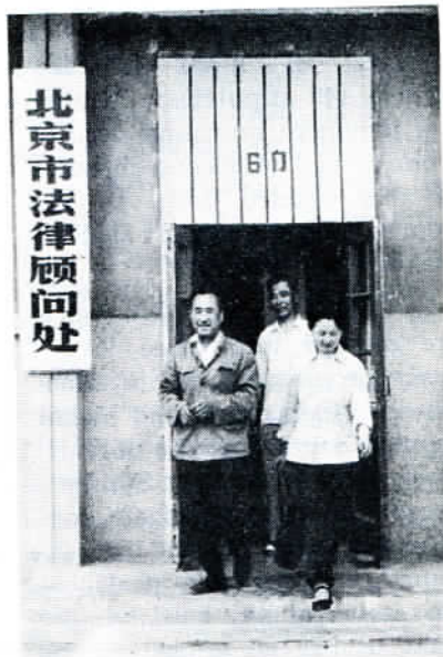
Beijing's legal advisers' office.

the law for the benefit of one's relatives or friends, he is punished. I think we practise law more independently than those hired by big firms or wealthy people. In old China there was a saying: 'The yamen (government office in feudal China) opens to the south; those with justice on their side but no money need not enter.' In those years, a lawyer's office was almost the same as a yamen ."