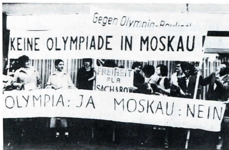
West Germans demonstrate against the Moscow Olympic Games.

The Soviet armed invasion of Afghanistan, which violates all the norms of international law, also runs counter to the Olympic spirit. This has aroused strong