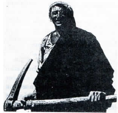
Master. Woodcut by Xu Kuang and A Ge

grim but radiating confidence. A robust middle-aged peasant in whose eyes one can read joy and sorrow is there by the Premier. An old granny looks into Premier Zhou's eyes which show the Party's concern for the local people and confidence in overcoming difficulties. Against shattered houses and