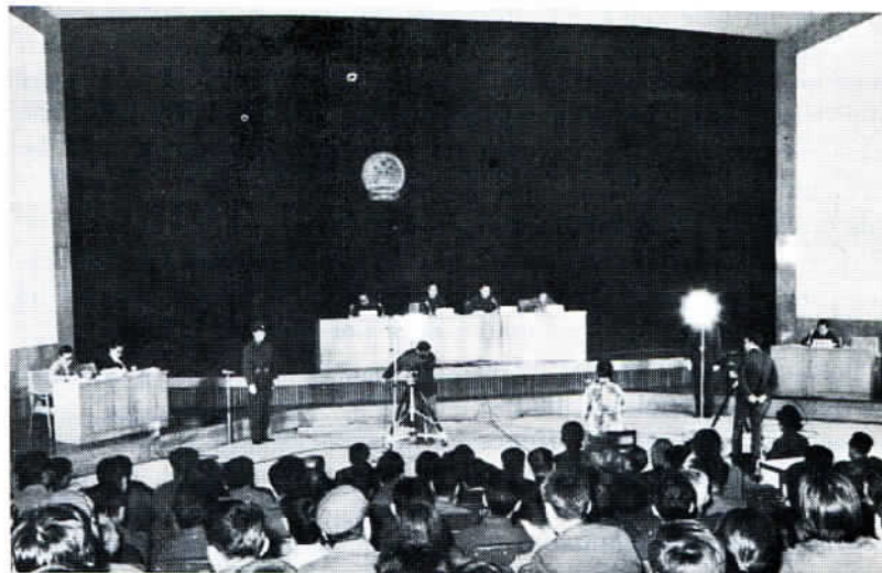
At an open trial.

5) Division of Work and Responsibilities, Co-ordination and Mutual Restriction. Article 5 stipulates: "In criminal proceedings, the people's court, the people's procuratorate and the public security organ shall have a division of work and responsibilities, and co-ordinate and restrict one another, so as to guarantee accurate and effective enforcement of law." Accordingly, a number of specific regulations have been drawn up