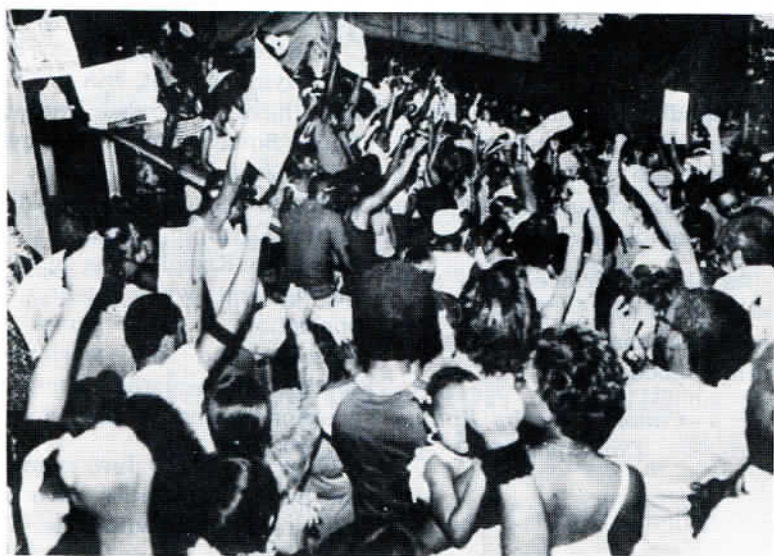
Afro-Americans protesting before the Miami court house.

ing whites are living under the poverty-line, but for Spanish-speaking whites (including Cubans) it is 18 per cent. For black Americans it is 38 per cent. After President Carter's decision to "welcome the refugees," Cubans poured into the country. Bearing the brunt of the harms are the black Americans, who have found jobs even harder to get.