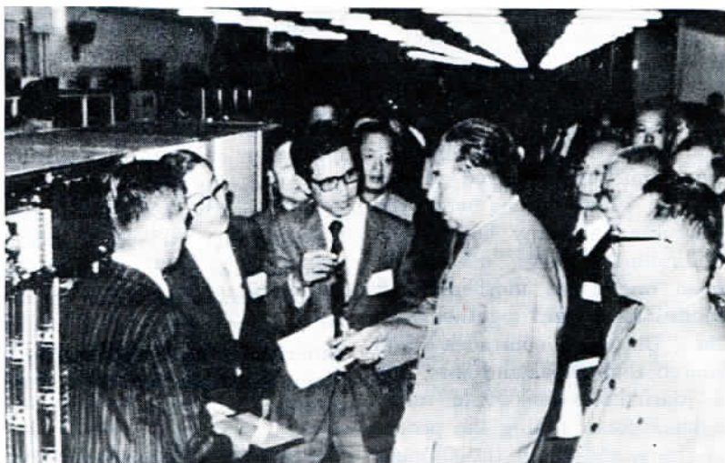
Premier Hua visits the Kawasaki Plant of Fujitsu Ltd.

Referring to economic co-operation, Premier Hua said during the talks that China looks at such co-operation from the viewpoint of long-range strategy. He added that it is entirely possible for the two