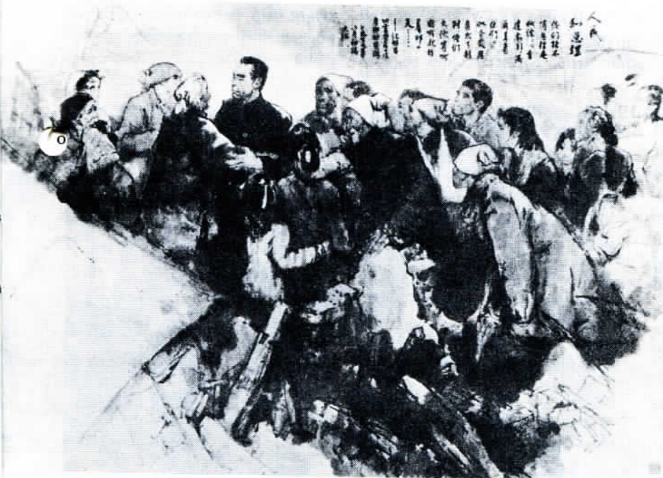
The People and Premier Zhou.

The series of illustrations Maple is based on a short story of the same title. Dan Feng (Red Maple) is a middle school girl during the Cultural Revolution. Duped by Lin Biao and the gang of four, she fights stubbornly for her faction and then jumps off a tall building to her death. Daring to represent the environment and the characters of the ten tumultuous years, the three young painters have treated this misguided girl sympathetically and sensitively. The naive expression on her face and her