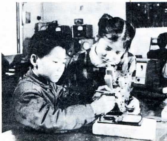
Radio group of the Hangzhou Children's Palace.

Children join these groups which meet once or twice a week for one or two years. Many young people who are now in middle schools, colleges or working in factories and government offices still remember how pleasant and rewarding were the days they had spent in the palace.