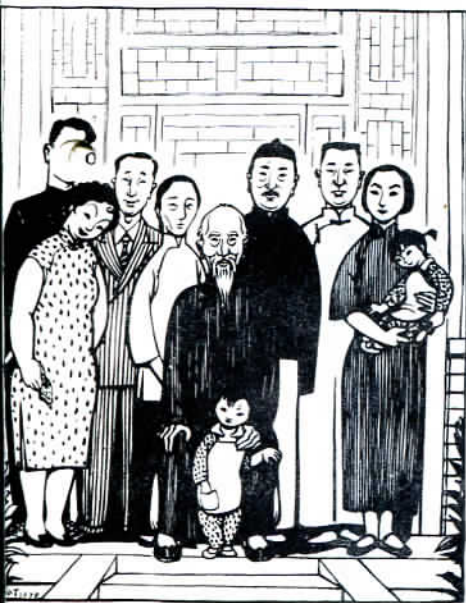
An illustration by Ding Cong for Lao She's Four Generations Under One Roof .

Li Zongren came from Guilin in Guangxi. He left for the United States before southwest China was liberated in December 1949 and lived in New Jersey for 16 years. He returned to China in 1965 to work for the reunification of the motherland. He died of illness on January 30, 1969 in Beijing.