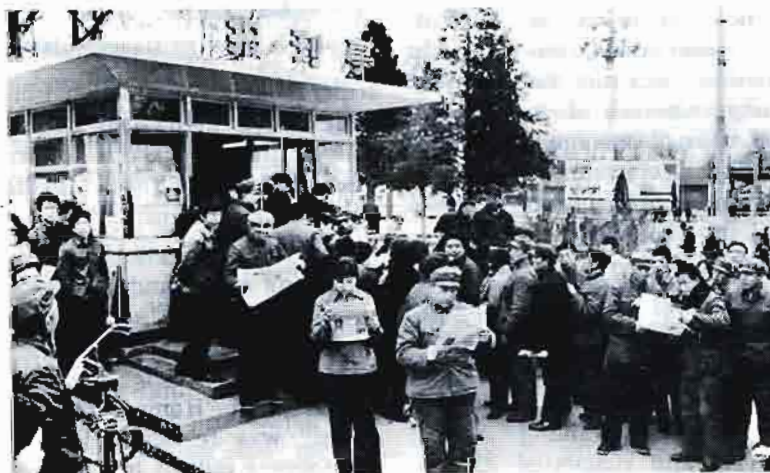
Long lines to buy "Beijing Wanbao" are quite common.

Work to extract harringtonine from the cephalotaxus plant began in China in 1971. A clinical study has shown that