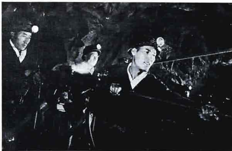
Workers in a coal mine in Ningxia at work underground.

along the roadsides of Zhongnanhai, where the Party Central Committee and the State Council offices are located. A mass tree-planting campaign is in full swing throughout the country.