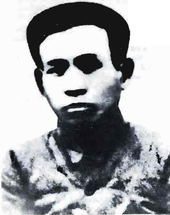
Comrade Liu Shaoqi in Shanghai (1925).

of his own poor health. It is clear in these reports that he was never "afraid of struggle" nor had he deserted the unions.