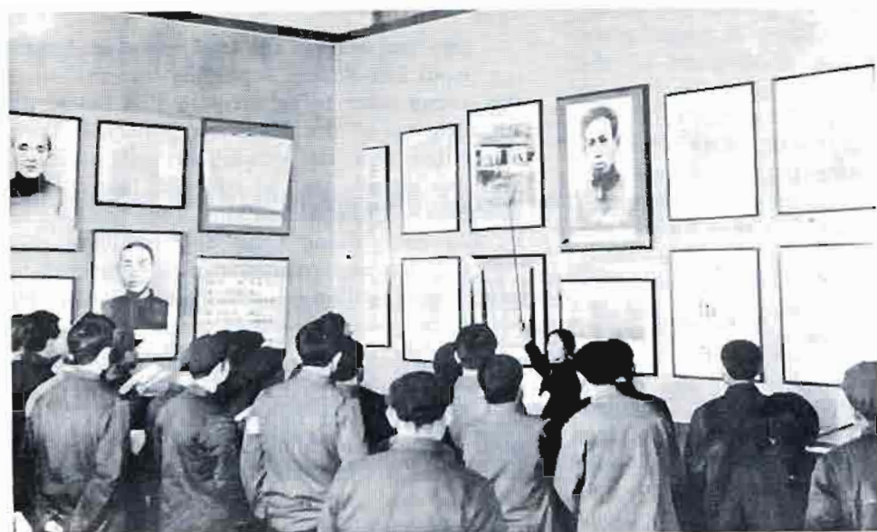
The museum for the movement of Anyuan railwaymen and coalminers has been reopened. Liu Shaoqi took part in leading the movement in 1922.