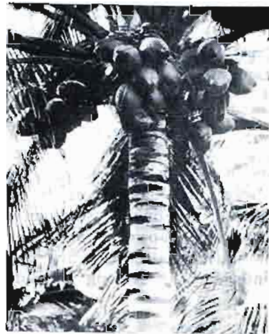
Coconut trees on Hainan Island.

The county is full of coconut palms. Near the harvest season, the trees hang heavy with