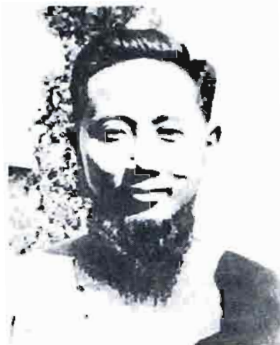
Li Gongpu, a professor who died a martyr's death in 1946 for his opposition to the Kuomintang government.

The Party organizations enthusiastically organized them