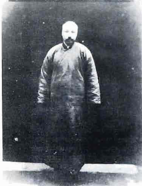
Li Dazhao before his execution.

skillful hand, I write articles" is still popular among the people.