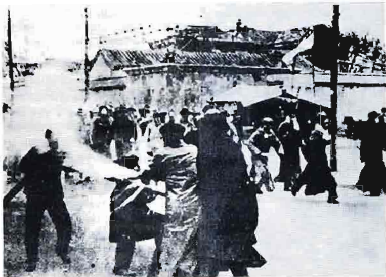
Students fighting the Kuomintang cops during the December 9th Movement (1935).