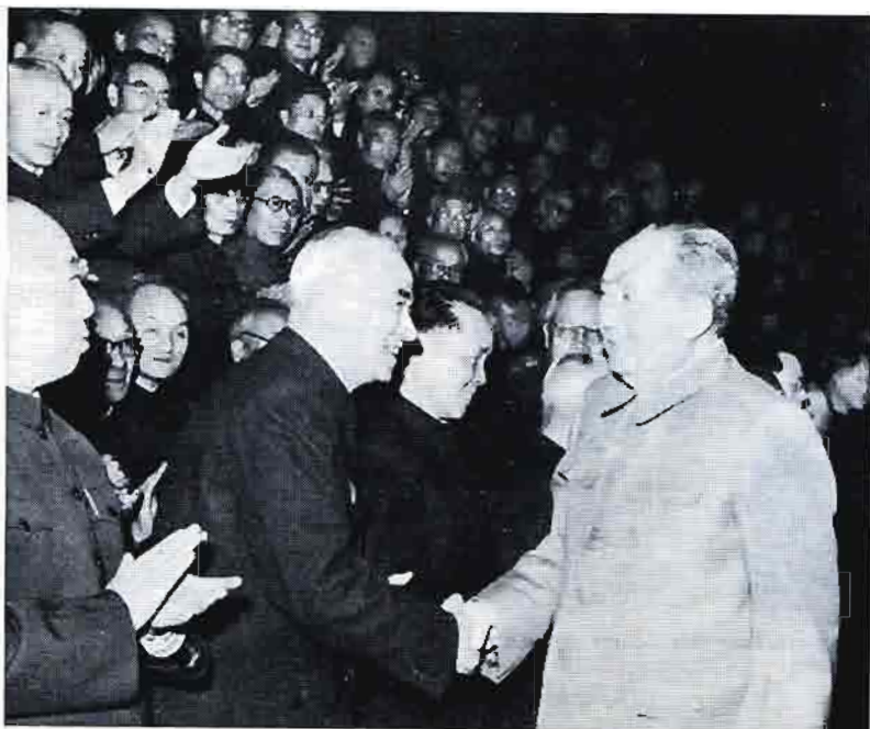
Chairman Mao shaking hands with Li Siguang, a noted geologist, in 1964.

to study the basics of Marxism-Leninism, encouraged them to get to know the workers and peasants and to learn from the good qualities of the labouring people, asked them to discard traditional values left over from the old society, including looking down on the labouring people, making their own way and lacking collectivism. The Party's policy achieved remarkable results. The greater part of the intellectuals gradually became accustomed to the new socialist values and morals and made valuable contributions to the speedy rehabilitation of the national economy and the realization of the targets of the First Five-Year Plan (1953-57).