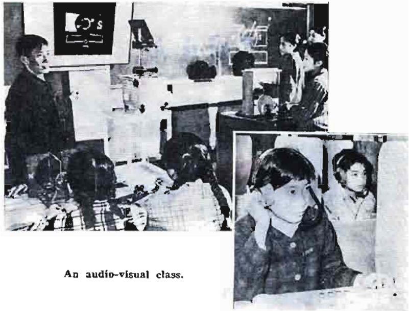
An audio-visual class.

The Ministry of Education has recommended the use of 85 sets of slide shows on 13 subjects in primary and secondary schools.