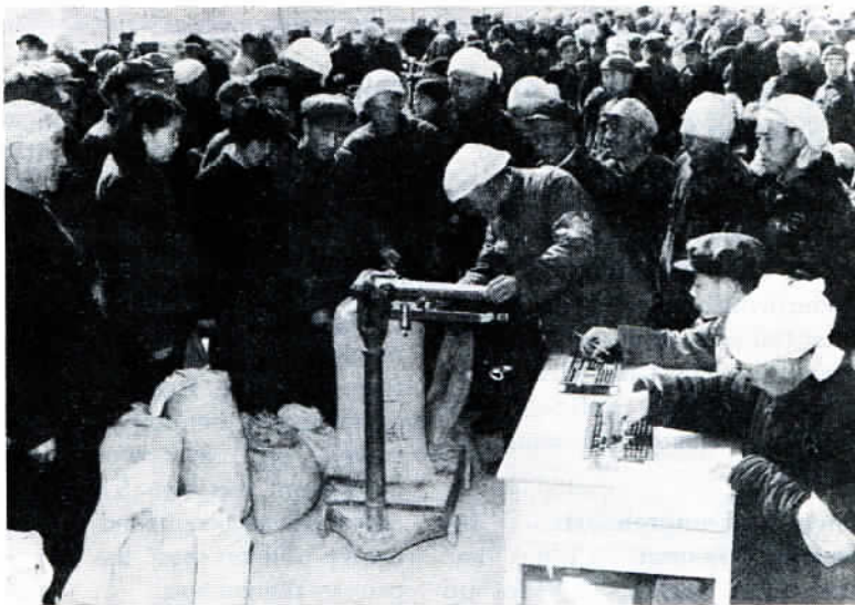
Peasants selling grain at a rural fair in Hebei Province.

Farm and side-line products purchased by the state in the first quarter of this year showed a 20.6 per cent increase over that of the corresponding period of 1978. This figure, released