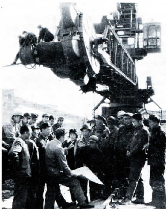
Workers and staff of a coal mine in Shanxi studying ways of tapping the potential of the coal pits.

normally, some turn out poor-quality products with little variety, and some produce high-cost goods with little profits or even at a loss. The overwhelming majority of enterprises in China today belong to this category. They can catch up with the first category provided efforts are made. The nation depends mainly on these two categories to bring about the four modernizations. The most pressing problem at present is the lack of supply of raw and other materials, fuel and power, thereby preventing these enterprises from operating at full capacity. (3) Those enterprises which turn out bad-quality, high-cost and unwanted goods and have incurred losses over a long period of time. Readjustments will be made with regard to these enterprises according to different conditions.