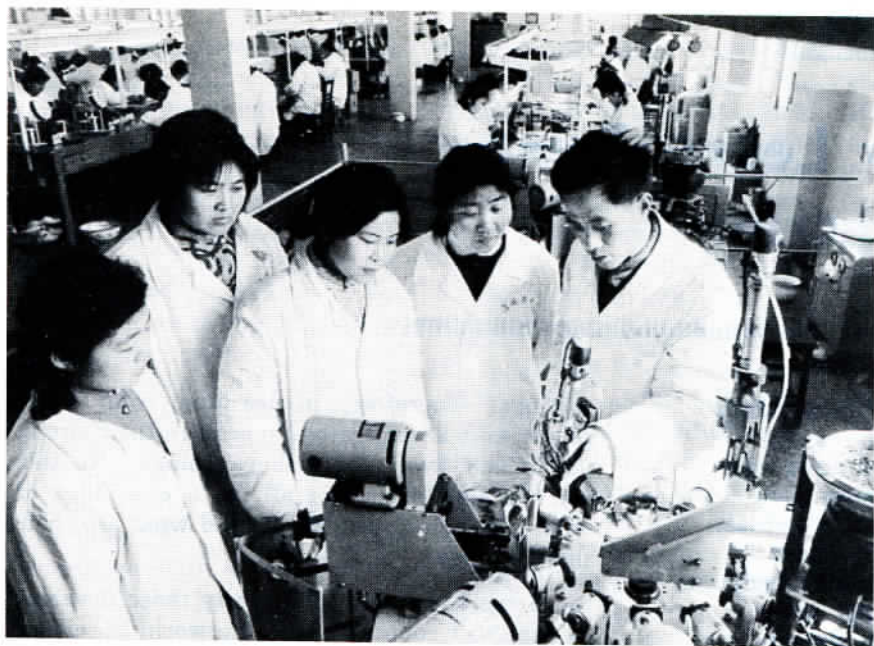
Workers and technicians of a radio parts factory in Jiangsu Province discussing how to make better use of imported equipment.

Comrade Mao Zedong enjoined us long ago: "Our policy is to learn from the strong points of all nations and all countries, learn all that is genuinely good in the political, economic, scientific and technological fields and in literature and art. But we must learn with an analytical and critical eye, not blindly, and we mustn't copy everything indiscriminately and transplant mechanically. Naturally, we mustn't pick up their shortcomings and weak points" ( On the Ten Major Relationships , 1956). To have blind faith in all foreign things or, to reject everything foreign without giving them a thought, is incorrect and is not Marxist.