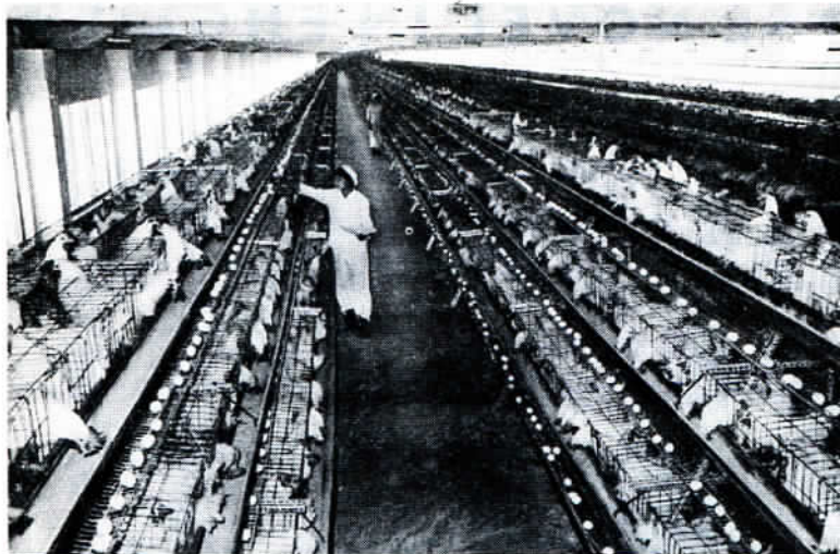
Guangzhou chicken battery built with contributions from Xianggang (Hongkong) compatriots.

relationship between people is one between comrades, where everyone is ready to help if anyone is in difficulty."