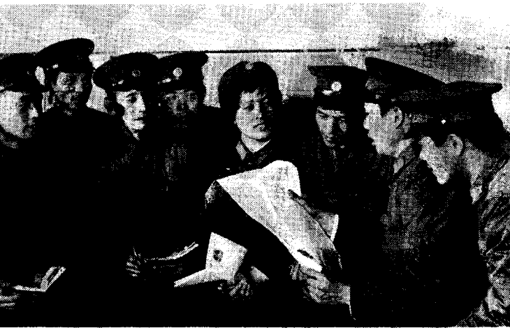
People's police studying the new Constitution.

The article recalls the progress made in strengthening socialist legality in the past year and more since the fall of the "gang of four." The framed-up charges brought against many innocent people by the gang have been cleared up one by one. Criminals and counter-revolutionaries who perpetrated all kinds