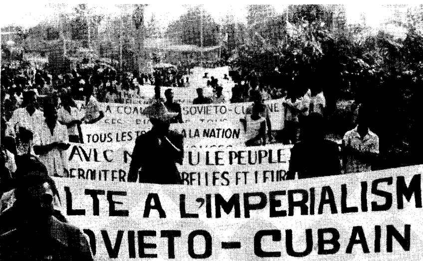
Demonstration in Kinshasa.

The press in many African countries stood on the side of the Zairian people, exposing and denouncing the aggressors. The Moroccan newspaper Al Alam said in a commentary: "What is happening in Zaire is undoubtedly an extension of the struggle in the Horn of Africa. Probably the tactics are different, but from the point of view of strategy, the aim is the same, that is, to strengthen Soviet influence in Africa." The Sudanese paper El Ayam pointed out: "Certain foreign powers regard the Zairian Government as an obstacle to their desire for controlling Zaire; this is why these foreign powers have been scheming to invade the country." The Mauritanian paper Ach-Chaab noted editorially that "Zaire seems to be the favourite target of action of people whose hegemonist designs are beginning to stand out ever more clearly. Without important complicity and support, the first aggression of Shaba would not have taken place, still less the second." The editorial added, the mercenaries would find many countries, Mauritania included, standing on the side of Zaire, because these countries "do not like to see the people's will replaced by the mercenary system."