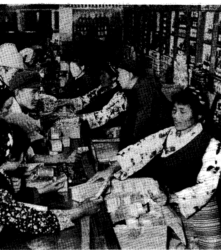
A provisions store in Lhasa.

Efforts were made to develop communications and trade with the hinterland of the country. New transport routes were opened and Tibet's foreign trade expanded. This stimulated the economy and stabilized the market in the region. After two to three years of arduous work, the difficulty in ensuring supplies and other economic problems was overcome. And politically, we won the initiative. In 1956, the Preparatory Committee for the Tibet Autonomous Region was founded. This represented a great victory for the Party's nationality policy in Tibet.