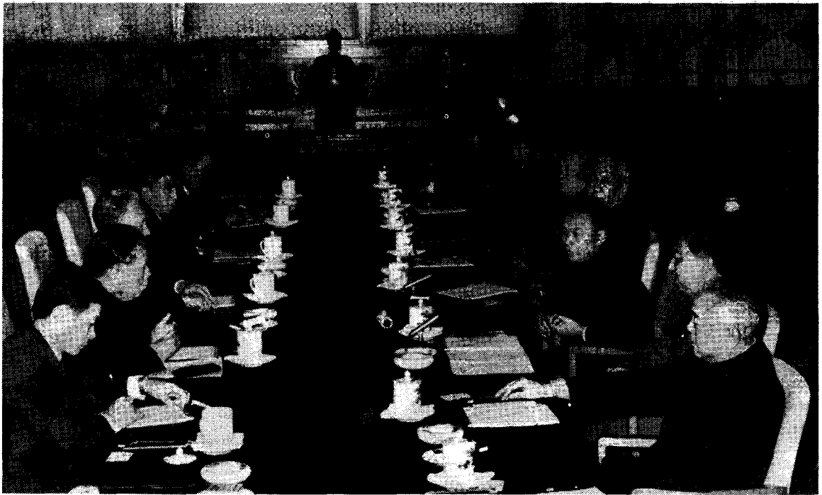
Chairman Hua Kuo-feng and General Secretary Le Duan hold talks.

Renmin Ribao published an editorial that day welcoming the delegation. It pointed out: "China and Viet Nam are friendly, fraternal socialist neighbours linked by rivers and mountains. The people of both countries who are comrades and comrades-in-arms have forged a profound friendship in the long years of revolutionary struggle. It is their common aspiration to safeguard and develop Sino-Vietnamese friendship nurtured carefully by both Chairman Mao Tsetung and President Ho Chi Minh."