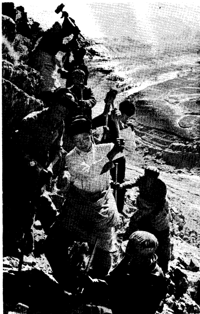
Commune members building an irrigation canal on the hill slopes.

Two experimental people's communes were set up in Tibet in July 1965. By the end of 1970, there were already nearly 1,000 communes. By 1975 when the Tibet Autonomous Region celebrated its tenth anniversary, communes had been generally set up in most parts of the region at a speed not anticipated before and, as Chairman Mao had hoped, production increased while the death rate of livestock dropped greatly. In 1974, the region achieved self-sufficiency in grain for the first time in its history. Grain output in 1975 outstripped that of 1965 by more than 50 per cent and was over 2.5 times that of 1958. Compared with 1958, livestock increased