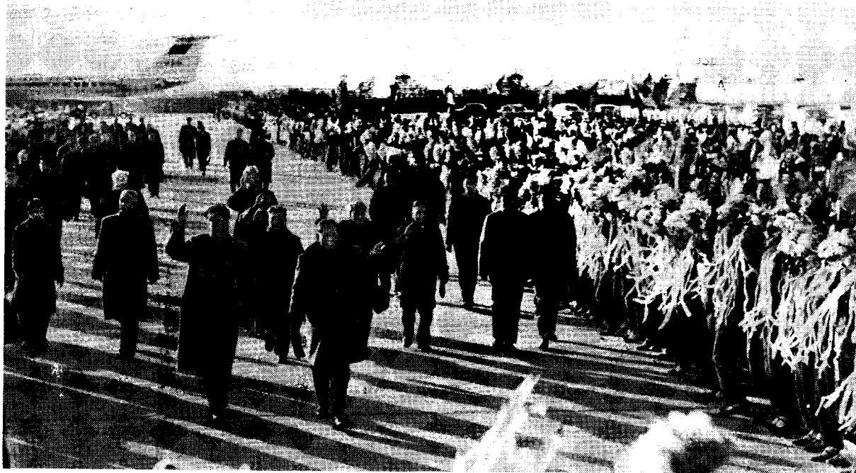
Vietnamese comrades warmly welcomed at Peking Airport.

Accompanied by Keng Piao, Member of the Political Bureau of the C.P.C. Central Committee and Head of the International Liaison Department of the C.P.C. Central Committee, the delegation paid its respects to the remains of Chairman Mao and presented a wreath on the afternoon of the same day.