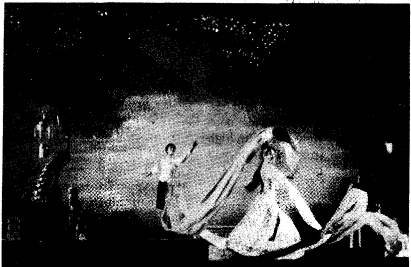
Welcoming the loyal soul with a graceful dance—a scene from the dance-drama.

YANG Kai-hui (1901-30) was Chairman Mao's wife and close comrade-in-arms. She was an activist in the student movement, and also did propaganda and organizational work among workers, peasants and women. In 1927, after the defeat of the First Revolutionary Civil War,