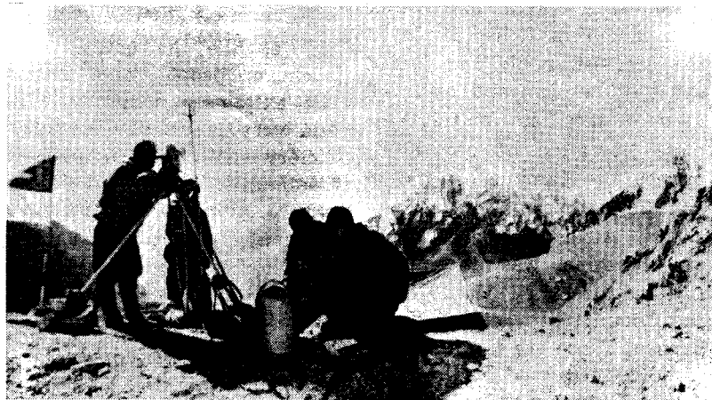
Surveying Mt. Tomur.

In order to speed up the development of this field of work, a national surveying and cartography conference on learning from Taching in industry was held in Peking late in September. Representatives to the conference pledged to build a modernized system of surveying and cartography at the highest speed, mechanize field work equipment, automate the work wherever possible, use microfilm technical data and file them by numerical-control devices, and achieve diversified results. They also expressed their determination to catch up with and surpass advanced world levels in the theory and automation of surveying and cartography.