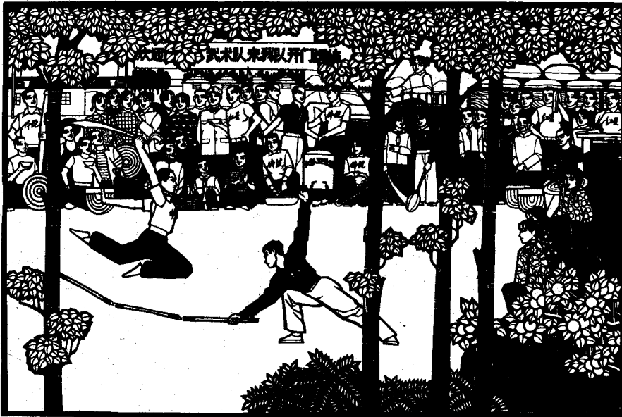
Performing wushu for the commune members. Papercut by the Nantung Arts and Crafts Research Institute

paredness against war. In 1956, Chairman Mao pointed out: "China used to be stigmatized as a 'decrepit empire,' 'a sickman of East Asia,' a country with a backward economy and a backward culture, with no hygiene, poor at ball games and swimming"; "but after six years' work of transformation, we have changed the face of China, no one can deny our achievements."