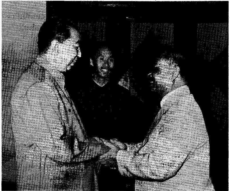
Chairman Hua meets delegation leader Kaysone.

In his toast at the banquet, Comrade Li Hsien-nien warmly praised the achievements of the Lao people in strengthening and consolidating the revolutionary political power, defending the fatherland, healing the wounds of war, steadily rehabilitating and transforming the national economy and developing culture, education, health work and other undertakings. These gratifying successes, he noted, were obtained by displaying the revolutionary spirit of the war years under the leadership of the Lao People's Revolutionary Party. He expressed the hope that the revolutionary friendship between the two countries, two Parties and two peoples would grow with each passing day.