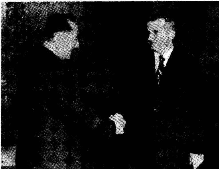
Comrade Ceausescu shaking hands with delegation leader Saifudin.