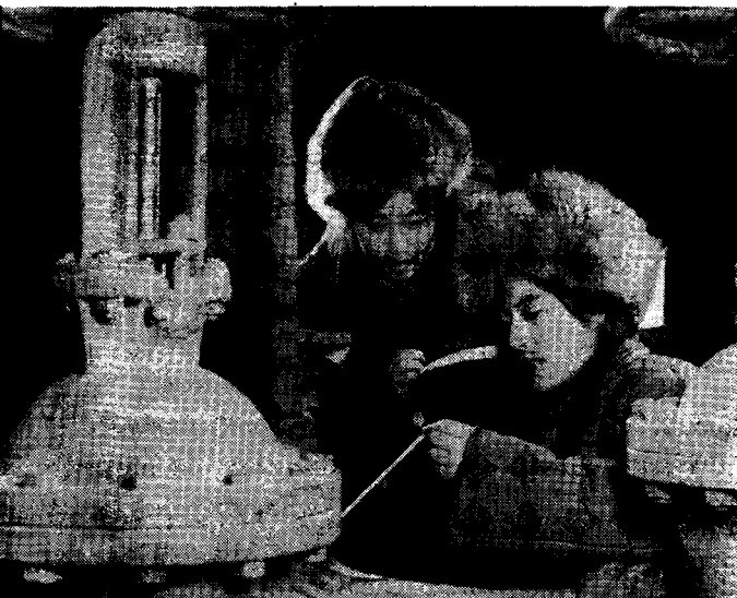
Workers of a woman's oil extraction team change shift.

As masters, the Taching people attach importance to frugality. The sewing and mending factory is a good example. Manned by 415 people and equipped with 160 pieces of machinery including washers and dryers, this factory occupying five buildings was originally a ramshackle house where several workers' wives washed and darned work clothes in the early days of Taching. Today, the main work continues to be making work clothes, fur caps, gloves and other wear from discarded material. The lining of a cotton-padded jacket, for instance, is made of tatters patched together after a thorough clean-