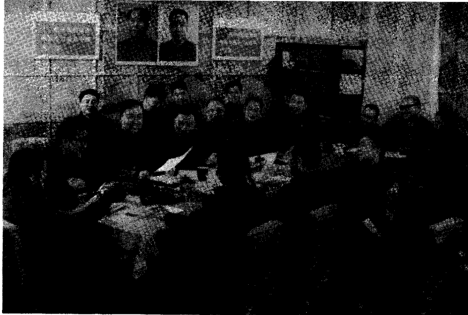
Members of the Taching Party committee at a theoretical study session.

In recent years, the leading cadres have been required to "be open and aboveboard in four aspects": First, state one's views publicly instead of concealing them; second, examine one's own mistakes and shortcomings publicly in criticisms and self-criticisms; third, report on one's work to the whole leading body and don't do anything behind others' backs; and fourth, be upright in daily behaviour and don't do anything detrimental to the public interest. These four requirements help put the leading members under the supervision of the collective and the masses. They are conducive to implementing the three basic principles put forward by Chairman Mao, namely, "Practise Marxism, and not revisionism; unite, and don't split; be open and aboveboard, and don't intrigue and conspire."