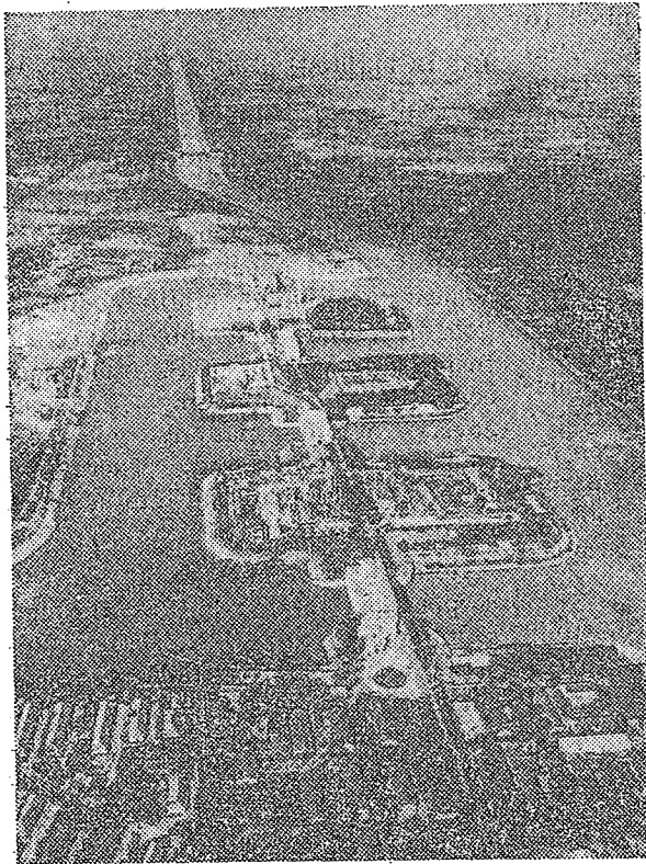
A bird's-eye view of the Chiangtu pumping station.

ENORMOUS achievements have been made in harnessing the Huai River by the people of Honan, Anhwei, Kiangsu and Shantung Provinces in the Huai River basin.