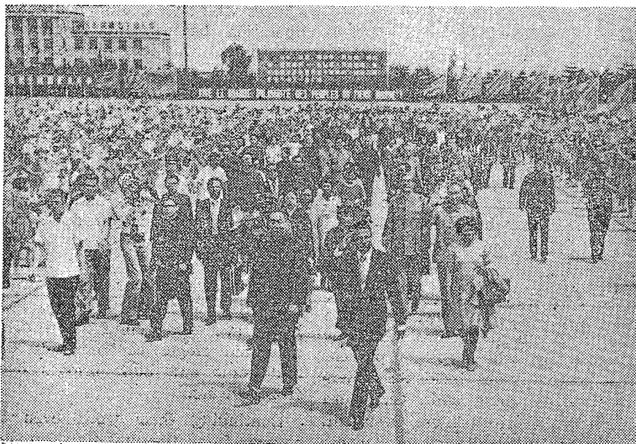
Distinguished guests from Madagascar arrive at Peking Airport to a rousing welcome.

extended warm and magnificent sentiments to me and through me to the Malagasy people. We were accorded an enthusiastic and truly fraternal welcome everywhere.