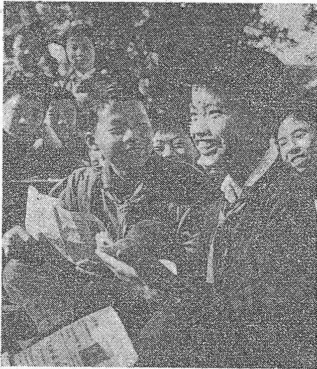
A Little Red Guards' theoretical study group of a primary school on the outskirts of Shanghai.

go with the students to make social surveys, and when dealing with the principles of tractors, they have the class run in the fields where they teach the students to tractor-plough the land, and when explaining the structure of diesel engines and motors, they take the students to the power-operated wells to learn how to operate and do repairs. Studying in this way and linking theory with practice, the students are helped to develop morally, intellectually and physically.