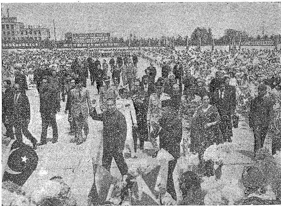
A rousing welcome for distinguished guests from Pakistan at Peking Airport.

Prime Minister Bhutto said: "The people of Pakistan have profound respect for the Chinese people. We have the highest admiration for the spectacular progress made by China in all fields and for the assurance with which it is poised to confront the challenges of the future. We deeply appreciate the many-sided assistance China has extended to