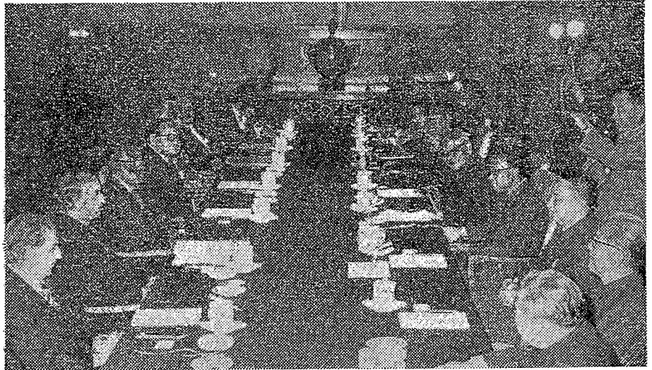
Premier Hua Kuo-feng and Prime Minister Bhutto hold talks.

Speaking on the steps taken by Pakistan towards completing the process of the normalization and in the re-establishment of diplomatic rela-