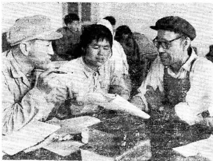
Workers at Shenyang Electric Wire and Cable Factory annotating selected works of Legalists together with teachers and students of Liaoning University.

This has made an enormous increase possible in the distribution of newspapers and magazines to villagers and herdsmen. By the end of 1974, the circulation of Renmin Ribao (People's Daily) and the Tibetan language edition of Xizang Ribao (Tibetan Daily) were 2.7 and 4 times bigger respectively than the 1965 figures. The 1974 January-October