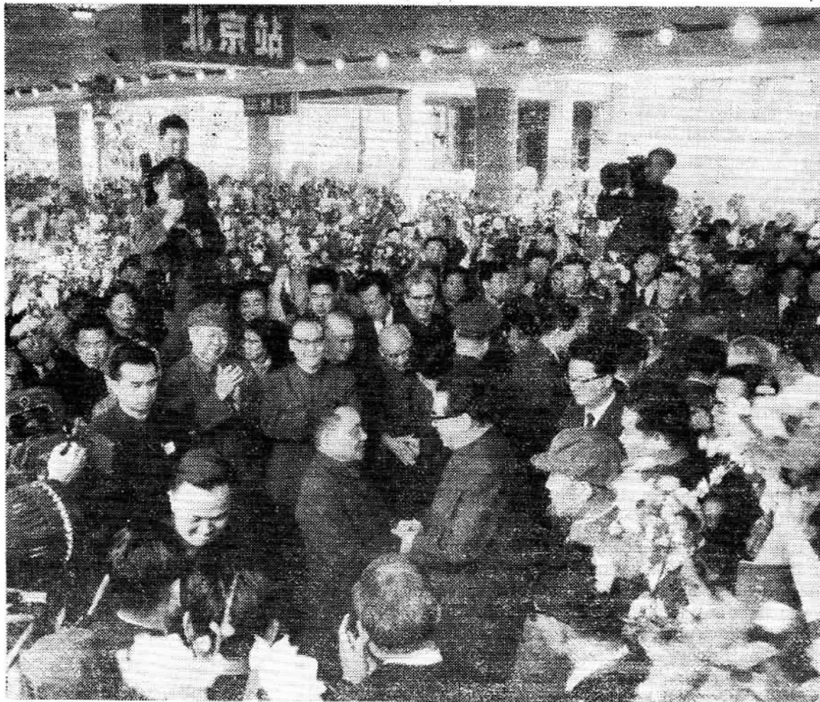
Chinese Party and state leaders and more than 5,000 people in the capital at Peking Railway Station give President Kim Il Sung and the delegation he leads a grand and warm send-off.

President Kim Il Sung gave a grand farewell banquet the day before the delegation left Peking. Comrades Wang Hung-wen, Yeh Chien-ying, Teng Hsiao-ping, Yao Wen-yuan, Chen Hsi-lien, Chi Teng-kuei, Hua Kuo-feng, Wang Tung-