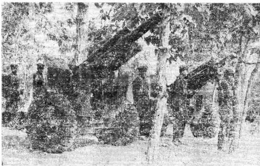
An artillery unit at the Phnom Penh front using captured U.S.-made guns.