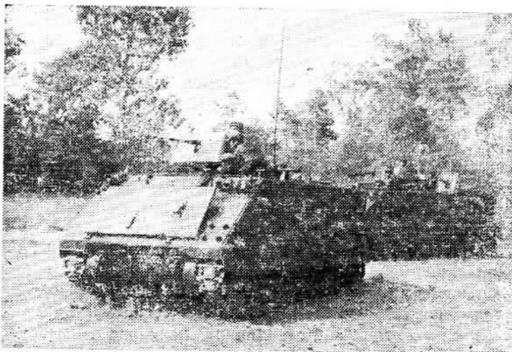
Armoured cars pressing on towards Phnom Penh.