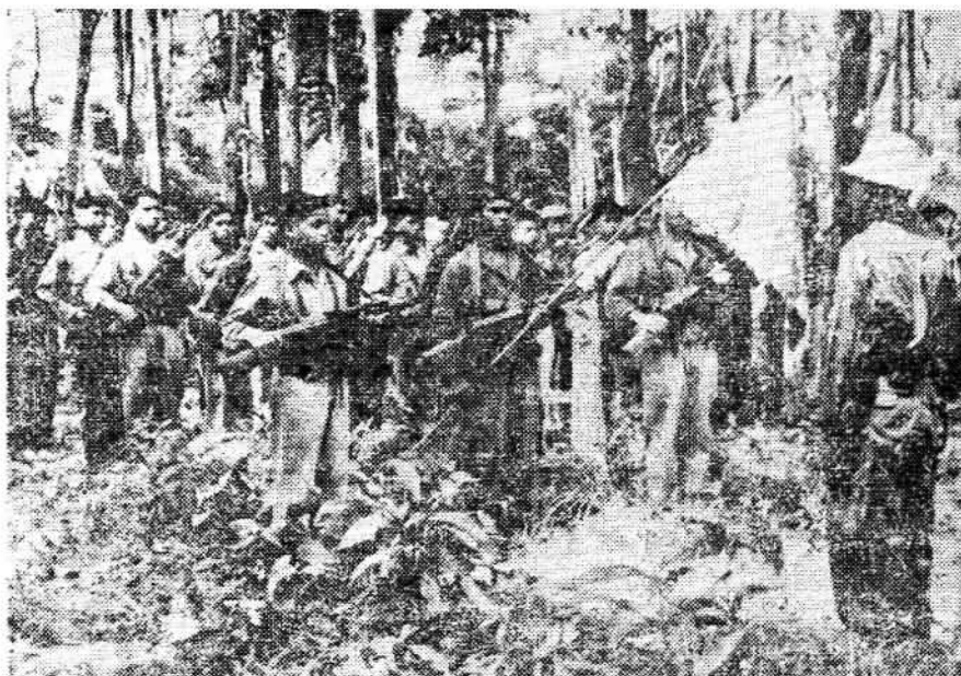
The People's Armed Forces of National Liberation of Cambodia growing stronger in fighting.

All of Cambodia was liberated on April 19. This great victory was won by the heroic Cambodian people and their armed forces through five full years of national-liberation war by rallying around the National United Front of Cambodia with Samdech Norodom Sihanouk as Chairman.