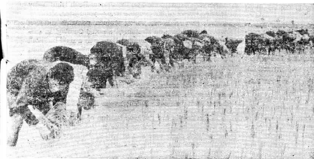
Liberated area peasants transplanting rice sprouts.