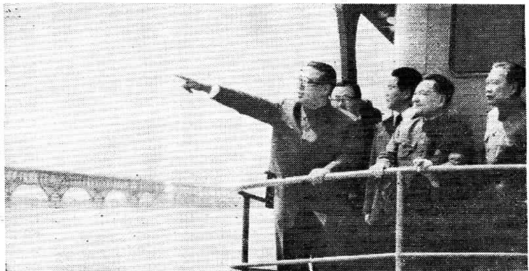
Accompanied by Comrade Teng Hsiao-ping, President Kim Il Sung and the delegation he leads visit the Nanking Yangtze River Bridge.

"The militant friendship and unity of the Korean and Chinese peoples will last for ever!"