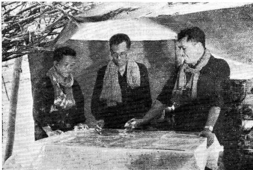
Commanders at a Phnom Penh front commanding post studying the war situation.

Since New Year's Day, the patriotic Cambodian armed forces and people, on the basis of victories already won, launched powerful and concerted offensives on three battlefronts — the lower reaches of the Mekong River, the areas around Phnom Penh and a number of provincial capitals temporarily controlled by the enemy. The Mekong front choked off Phnom Penh's links with Saigon. On the provincial capital front, the enemy was tied down, dispersed and besieged. These two battlefronts provided powerful co-ordination for operations on the Phnom Penh front.