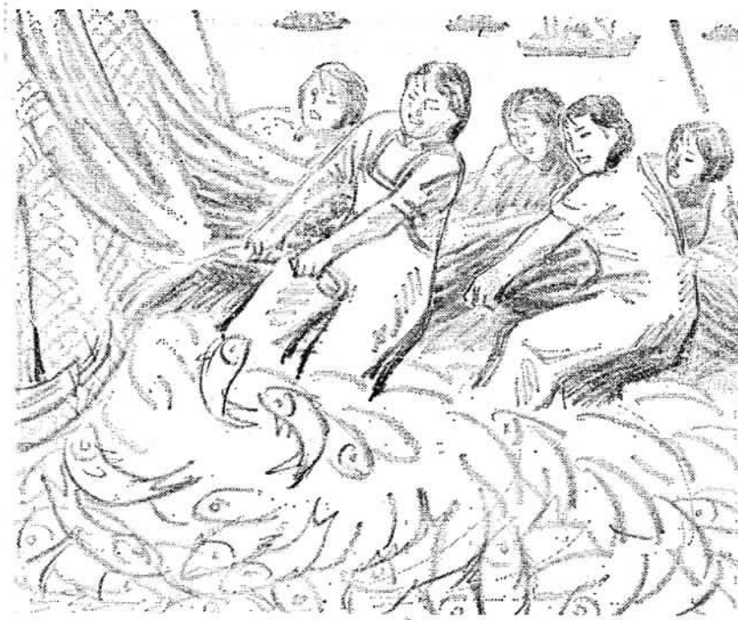
A good haul of fish by the women's fishing team of the Tayutao Brigade.

Cultural Revolution began in 1966, small factories have mushroomed throughout China's countryside. Financed by the public funds of the communes or brigades and using locally available raw materials, they produce mostly articles for the farm production or the peasants' daily necessities. Those working in these enterprises come from the production teams, so they are both workers and peasants.