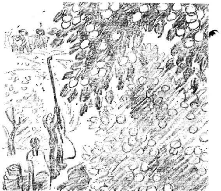
Spraying insecticide on the pear trees in the Hsiatingchia Brigade.

This is only one of many examples showing how the Hsiatingchia Brigade always gives priority to developing grain production in the use of land, deployment