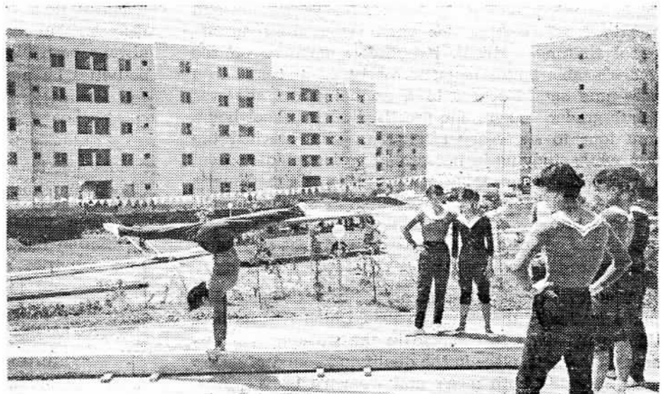
Chinese women gymnasts training in the Games Village.

In response to the call of Chairman Mao and the Party Central Committee, leading organs of physical culture and sports have been established in Peking and other parts of the country, many physical culture institutes have been built in various cities to train teachers, cadres, coaches and researchers for physical culture and over 1,000 spare-time physical culture schools for youngsters have been set up to train a backbone force to promote physical culture activities in middle and primary schools. In addition, the state has built many stadiums and gymnasiums. In the capital alone, the Peking Gymnasium with a capacity for 6,000 was built in 1954; the Workers' Stadium which seats 100,000 was built in 1959; the Workers' Gymnasium which seats 15,000 was constructed in 1961 and the