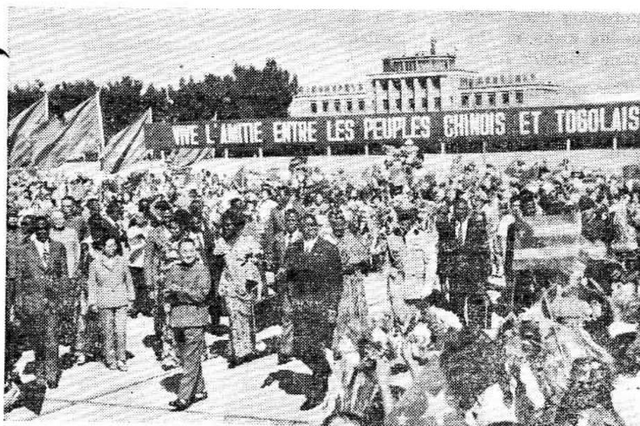
President and Mme. Eyadema as well as other Togolese guests arrive in Peking to a rousing welcome.