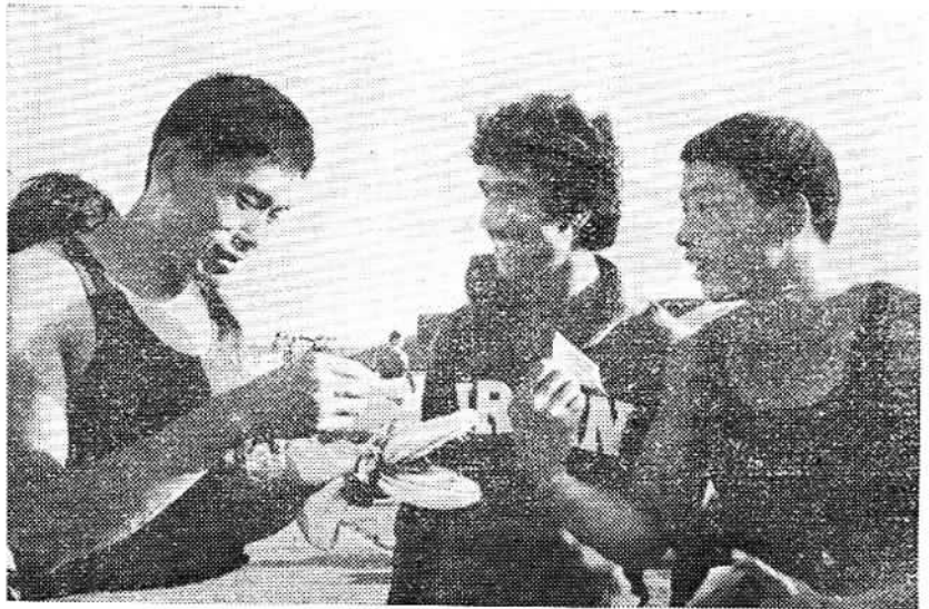
Chinese athletes chatting with an Iranian friend who presents them with photos he took of his Chinese friends at an international competition in Pakistan last April.

The level of play has risen swiftly with increasing popularization of the game. In 1953, China sent its first table tennis team to compete in the world championships. It took 4th place in the qualifying round of group competitions in both men's and women's team events. In the individual events, no player went beyond the third round. But marked changes took place within a