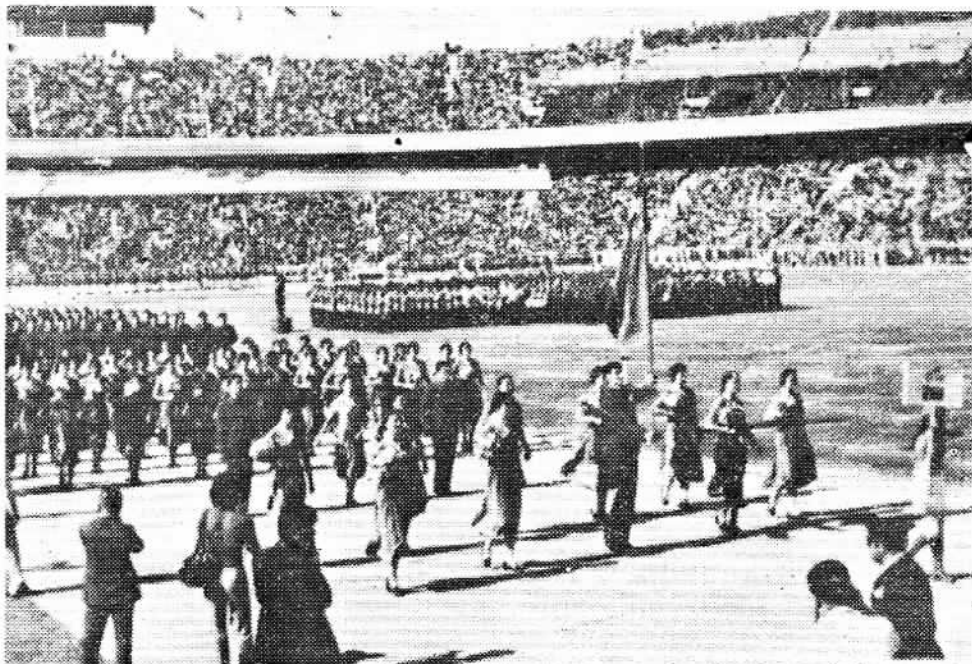
Chinese athletes march into the stadium.

At 4 p.m., the Shah solemnly declared the games open. The boom of salvoes resounded through the stadium as the A.G.F. flag slowly went up. Then the Mayor of Bangkok, venue of the 6th Asian Games, handed the games flag and traditional torch to Prince Gholam Reza Pahlavi, who in turn passed them on to the Mayor of Teheran. And then, the beating of drums and the blowing of trumpets heralded the entry into the stadium of well-known Iranian long distance runner Ali Bagban-