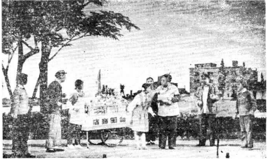
A scene from the pingchu opera Hsiangyang Store .

From different angles, songs and dances of Inner Mongolia extol workers, peasants and soldiers for their noble spirit and great vigour in socialist revolution and