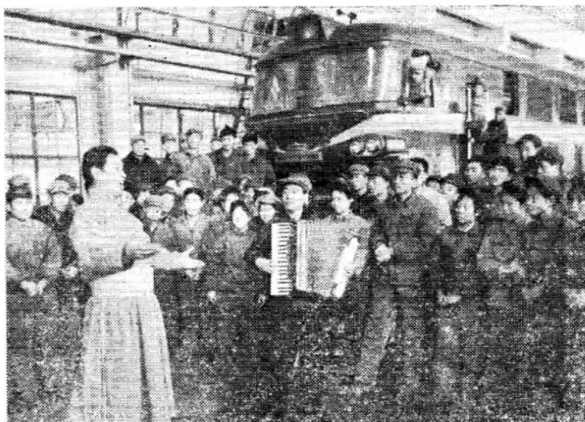
Members of the ulanmuchi perform for workers in a locomotive plant.