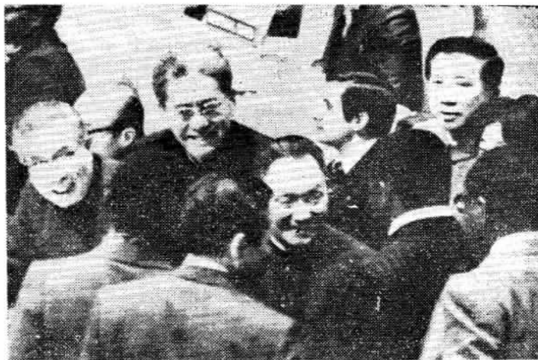
Representatives from many countries warmly greet Teng Hsiao-ping after his speech.

We maintain that the safeguarding of political independence is the first prerequisite for a Third World