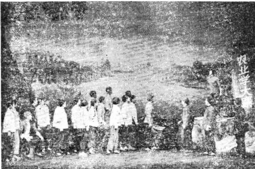
A scene from the modern play On the Bank of the Liehma River .

Commenting on the pingchu opera Hsiangyang Store , a clerk in the Peking Department Store said in an article entitled "Serve the Workers, Peasants and Soldiers All My Life": Working wholeheartedly for the people, the clerks of the Hsiangyang Store deliver goods to the workers' living quarters in the hills. "In doing so, they are actually bringing the