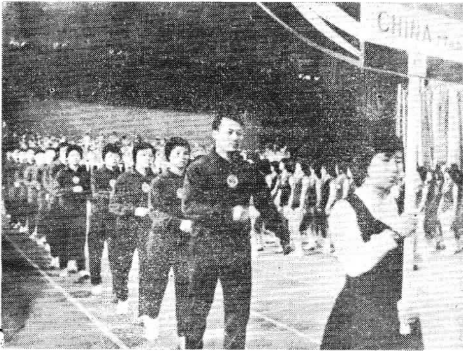
The Chinese team marching into the hall.

constitution, contributed to friendship among the Asian peoples and to the popularization and improvement of table tennis skill. He expressed the hope that the bonds of unity and friendship among the peoples of Asia forged at the 1st A.T.T.C. in Peking would be further developed through this year's championships. He pointed out that no force whatever can halt the advance of this tide. "The friendship that blooms in the matches will be carried to every corner of the world. This is the sincere wish of the 2.5 million citizens of Yokohama," he declared.