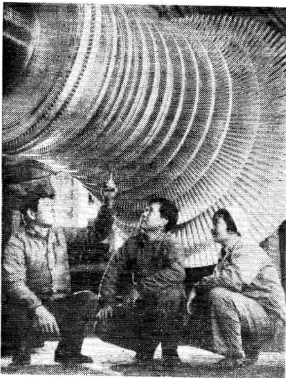
Peking Heavy Electric Machinery Plant workers examine the rotor of a turbo-generator.

China produced four times as many locomotives, passenger coaches and freight cars last year as in 1965. The