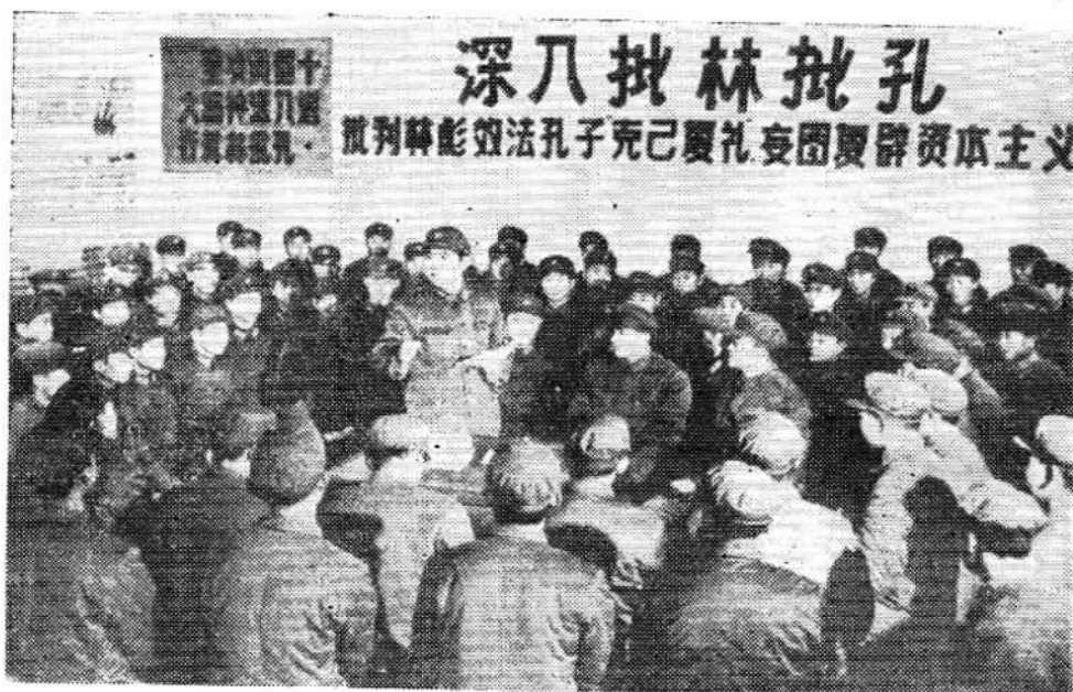
Criticizing Lin Piao and Confucius at a P.L.A. anti-chemical warfare company.