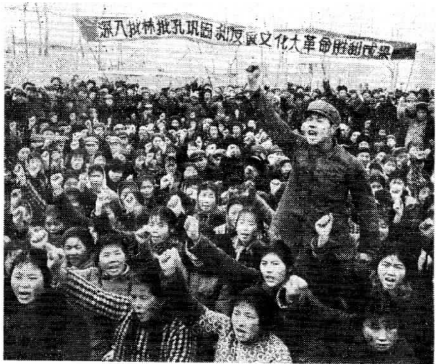
Members of a commune in Honan Province denounce Lin Piao and the doctrine of Confucius and Mencius at a meeting.