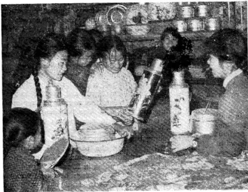
At the co-op in Tunghsin Commune where life quickly got back to normal after the earthquake.