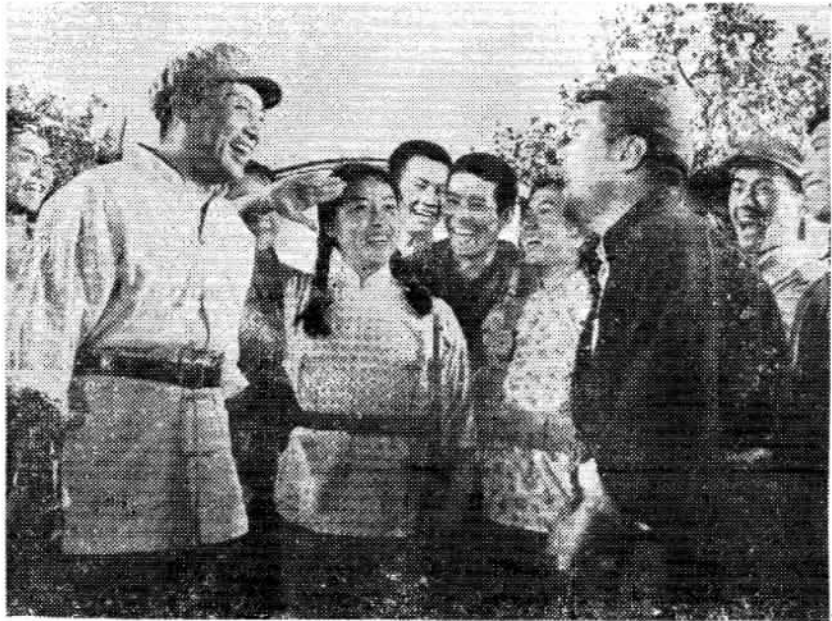
Youngsters eager to learn how to handle a horse-team and cart ( Pine Ridge ).

These four films produced separately by the Shanghai and Changchun Film Studios are new achievements of the Great Proletarian Cultural Revolution and are new victories for