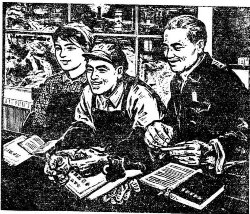
Veteran and young cadres studying together works by Marx, Engels, Lenin and Stalin and by Chairman Mao.

Chairman Mao has recently taught us: "It is necessary to run the study classes for worker-peasant-soldier cadres well, with classes lasting a term of three months and with four terms a year; they read books