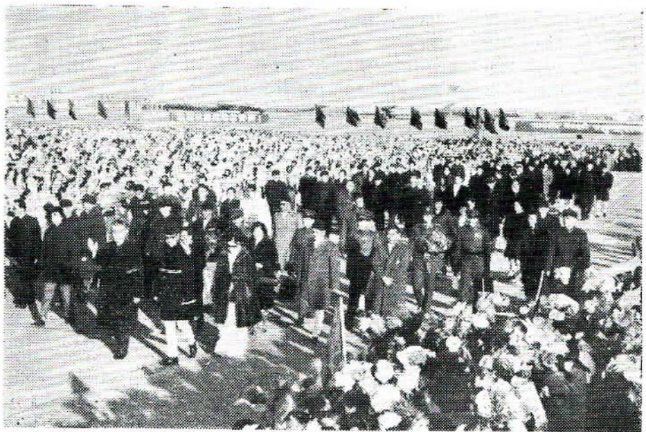
Welcomers greet King Birendra and Queen Aishwarya at Peking Airport.

They had a cordial conversation in a friendly atmosphere. Present on the occasion were leading members of the departments concerned and literary workers and artists.