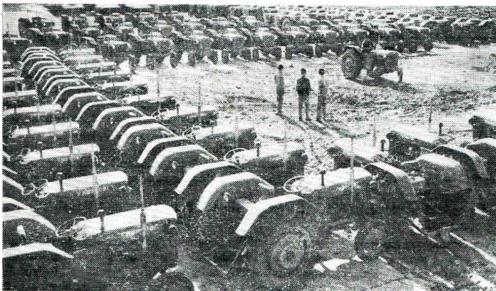
Kwangsi-made tractors ready for delivery.

In addition to all this, the state provides the region with complete sets of industrial equipment every year, and a good number of