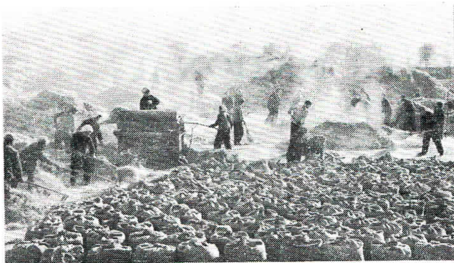
Autumn harvest in a commune in the Ningxia Hui Autonomous Region. Formerly arid, the area is now irrigated with water diverted from the Yellow River.

themes and artistic merit. On display are 351 photographs (nearly one-third in colour) which vividly reflect the excellent situation in China's socialist revolution and construction brought about by the heroic efforts of the Chinese working people. Veteran photographers have added a new dimension to their work by going deep into the midst of the masses, while amateur photographers, whose works occupy half of the exhibition, also showed new achievements. A number of outstanding pieces are singled out by visitors for their originality, composition and range of contrast.