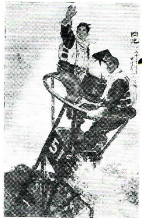
Flashing. Traditional Chinese painting by Chang Pei-chu

Photographic Art Exhibition. This year's national exhibition surpasses any held before the Cultural Revolution in respect to number of photographers submitting works, variety of