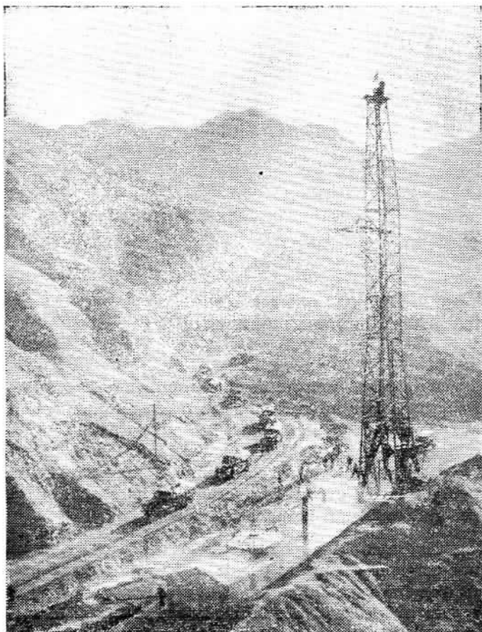
Transporting crude oil from the Tsaidam Basin.

farm implement processing industries as well. Our mills are turning out cotton and woollen fabrics. We also have our own petroleum, chemical, plastics, paper-making and food processing industries. Light industry was virtually non-existent — people here had to depend on other provinces for the buttons on their clothes. Now most light industrial products and articles in daily use are locally produced. Grain production has gone up pretty fast too. Processing animal products is becoming mechanized. Also, we've built a highway network."