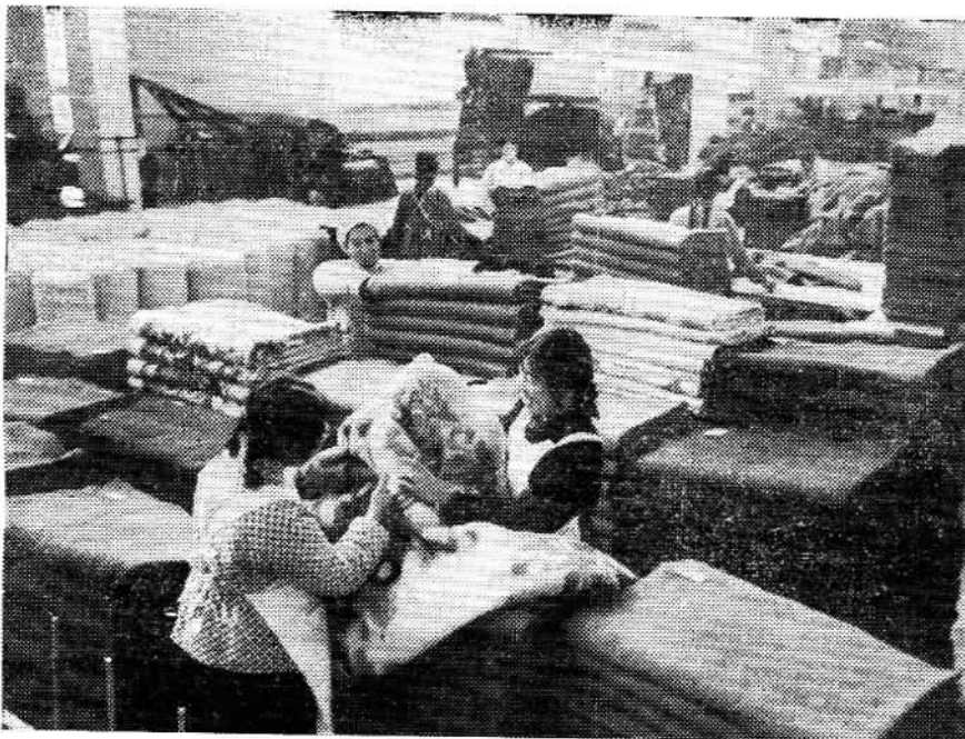
Getting woollen blankets and fabrics ready for packing at the Chinghai Woollen Mill.

Large-scale repairs were carried out after liberation and the sculptures and paintings renovated. The famous "butter art"—sculptures of Buddha, birds and animals, trees and flowers, pavilions and mansions all carved out of yak butter—has been carried on and developed. In the building where these sculptures were on display, I saw a miniature model of Tien An Men in Peking and life-like figurines of workers, peasants and soldiers.