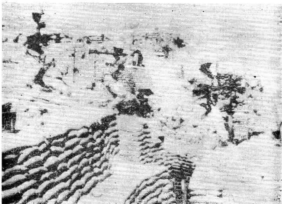
Breaching the so-called "impassable" Bar-Lev line.

In Africa, President Daddah of Mauritania on October 6 sent identical messages to President Sadat and President Assad which said: "Just as I have solemnly assured you, our indefectible solidarity and unconditional support to you will continue till triumph in our common just cause." On the same day, President Amin of Uganda cabled President Sadat and Chairman Kazafi informing them that all Ugandan military officers undergoing training in Egypt and Libya had been instructed to join the two countries' troops fighting Israel. In separate messages to the Presidents of Egypt and Syria on October 7, President of the Somali Supreme Revolutionary Council Mohamed Siad Barre expressed full support for them in their "battle of destiny against the enemy." He urged all Arab heads of state to take collective action to support Egypt and Syria militarily and materially to defeat Israel. In