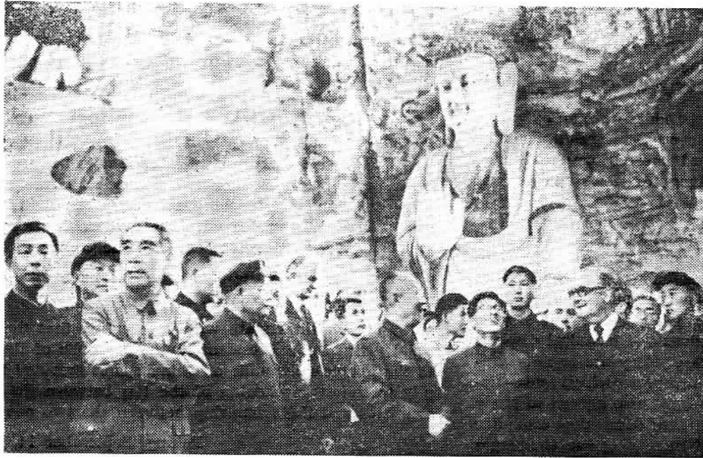
President Pompidou and other distinguished French guests, together with Premier Chou, visit the well-known Yunkang Grottoes.

"Upon my departure from China, I wish to restate that I am much touched by the warm welcome kindly accorded to me by you and the Government of the People's Republic of China. I have been able to appreciate the beauty of your country, of which I still retain a precious memory, and to see that the ancient ties of friendship that unites China and France are full of vitality.