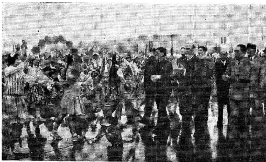
President Pompidou is given a warm send-off by Premier Chou, Vice-Chairman Wang Hung-wen and thousands of people at Shanghai's Hungchiao Airport.

In his speech, the French President spoke highly of the creative power, daring and initiative of the Shanghai people. He said: We must consolidate and multiply these ties. Both the Chinese and French people must work to make this enterprise a brilliant success.