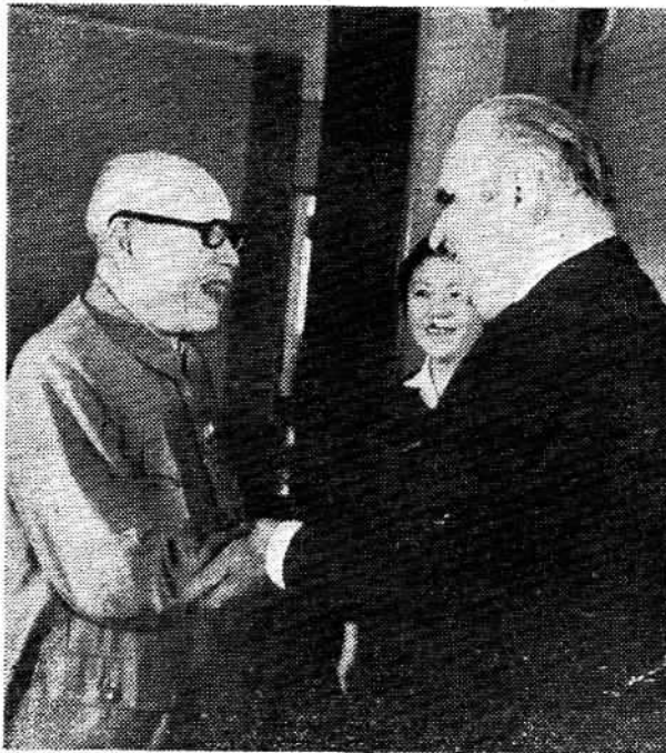
Acting Chairman Tung Pi-wu welcoming President Pompidou at the Guest House.

That evening, Premier Chou gave a grand banquet in the banquet hall of the Great Hall of the People to warmly welcome President Pompidou.