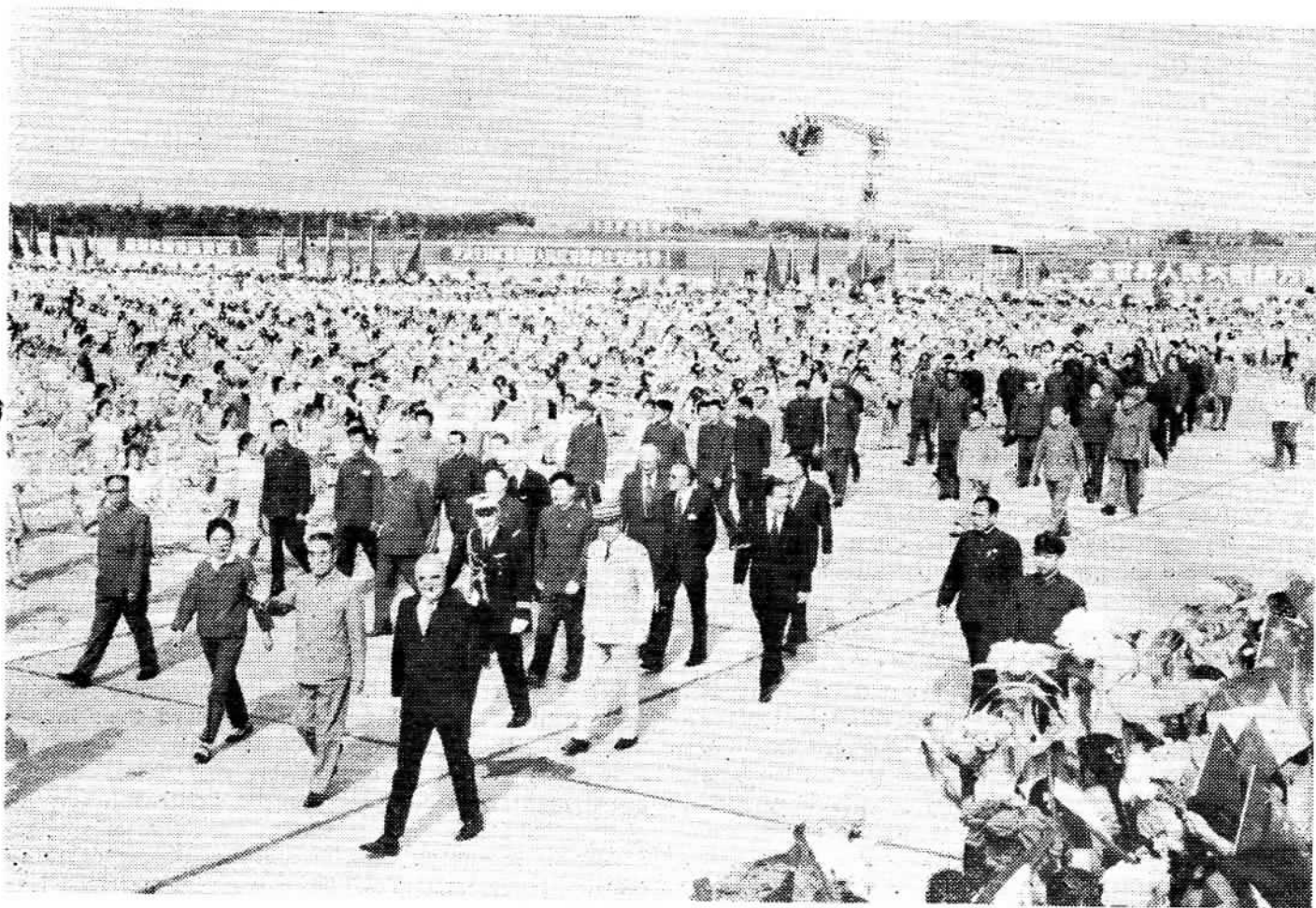
Accompanied by Premier Chou, President Pompidou and other high French officials walk round the airport to meet the welcomers.

"Though China and France are situated on two different continents with thousands of miles between them, ties of friendship have existed between the people of these two countries for many centuries," the editorial added. "Thanks to the personal concern and efforts of Chairman Mao Tsetung and General de Gaulle, diplomatic relations were established between China and France in 1964, thus writing a new page in the history of Sino-French relations and opening up broad prospects for the development of the friendship between the two peoples. Since the establishment of diplomatic relations between China and France the relations between the two countries have made great strides forward. The many reciprocal visits by government delegations of both countries and the growing contacts and economic and cultural interflow between the two peoples have enhanced mutual understanding between the two countries and the friendly sentiments between the two peoples."