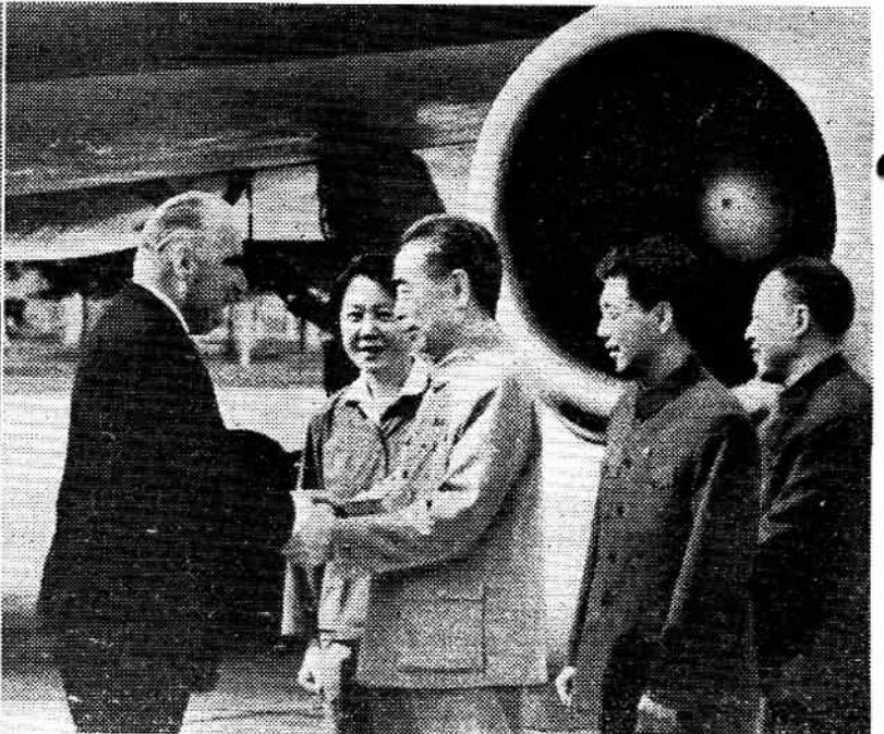
President Pompidou warmly welcomed at Peking Airport by Chinese leaders Chou En-lai, Wang Hung-wen, Yao Wen-yuan and others.