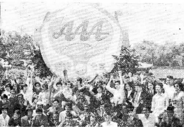
At the A.A.A. get-together.

The heads of delegations from the participating countries and regions held a meeting during the tournament. They regarded the tournament as having achieved full success. It was their opinion that in the future the table tennis organizations and players in Asia, Africa and Latin America should work for greater solidarity among the people of the three continents and make still more positive contributions. The meeting decided to hold the next Asian-African-Latin American