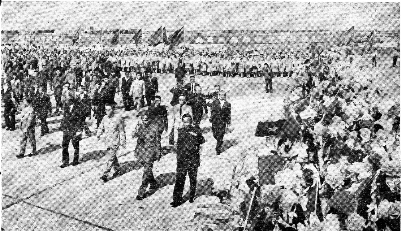
Comrades Le Duan and Pham Van Dong and other distinguished Vietnamese guests, accompanied by Chou En-lai and other comrades, wave greetings to the welcoming crowd at the airport.

a guard of honour made up of men from all three services of the Chinese People's Liberation Army, accompanied by leading comrades of the Chinese Party and Government.