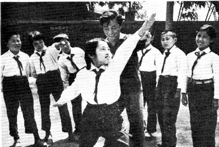
Upper left: Children of various nationalities in class at a primary school in the Sinkiang Uighur Autonomous Region.