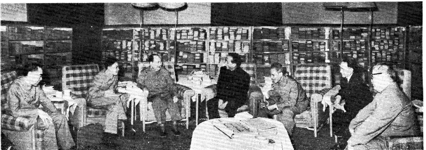
Chairman Mao has an extremely cordial and friendly conversation with Comrades Le Duan, Pham Van Dong and Le Thanh Nghi.