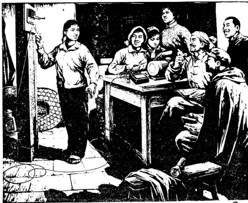
Peasants learning agricultural techniques in a night school.

During the Great Proletarian Cultural Revolution, these schools which had taught only reading and writing were expanded so that peasants could study works by