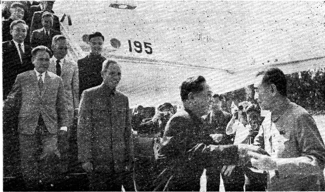
Comrade Chou En-lai warmly welcomes the Viet Nam Party and Government Delegation led by Comrades Le Duan and Pham Van Dong. Present on the occasion are other Chinese Party and government leaders.