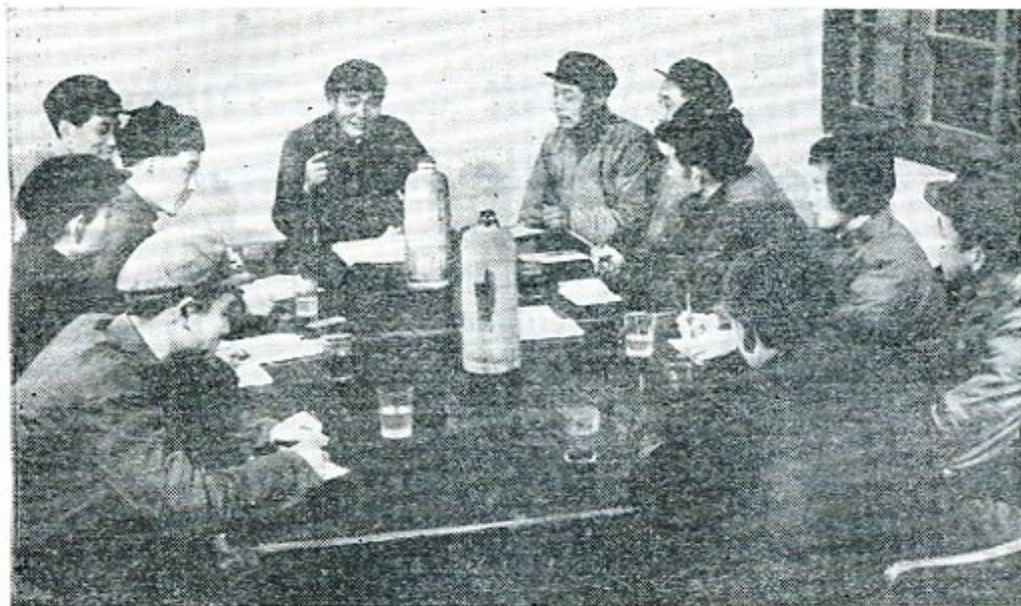
Meeting of responsible commune cadres.

merce, education and military affairs. Led by the commune Party committee, they practise collective leadership with responsibility for various fields of work divided up among them.