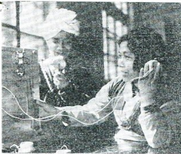
Teng students in physics class at Central Institute for Nationalities.

Altogether 258 medical workers from the provincial People's Hospital have settled in the countryside since 1969. Of these, 137 are leading members and experienced doctors of the hospital and its various departments. They now work in eight outlying commune clinics. Five hundred family members have, of their own accord, come to join them.