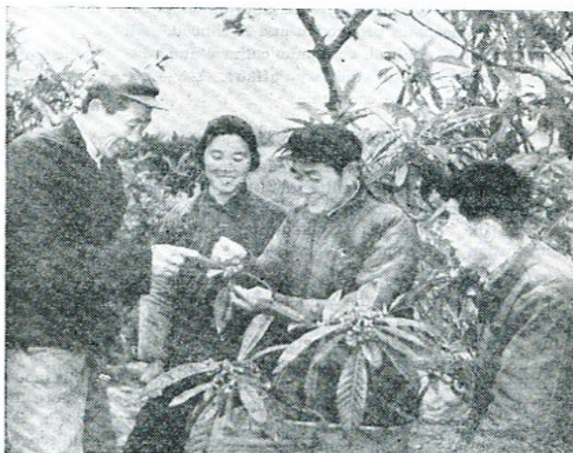
Deputy secretary of the commune Party committee (3rd from left) and commune members checking up on the growth of the loquat plants.

The 36 members on the revolutionary committee, the leading organ of the Tungting People's Commune, include representatives in industry, agriculture, com-