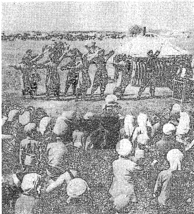
Performing for herdsmen.

The Chenglan Banner's troupe has over the past dozen years travelled