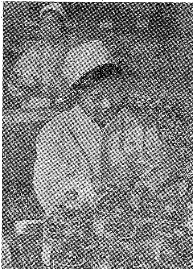
Workers in Tientsin's Weimin Pharmaceutical Factory packing 706 plasma substitute, a new type of anti-shock fluid.

The port now is linked with over 100 countries and regions. Its cargo handling capacity increases yearly with the development of the national economy. The monthly average of cargoes handled by the port in 1971 was one and a half times that of a whole year in the early post-liberation days; the amount of import and export goods handled last year rose more than 200-fold compared with 1951.