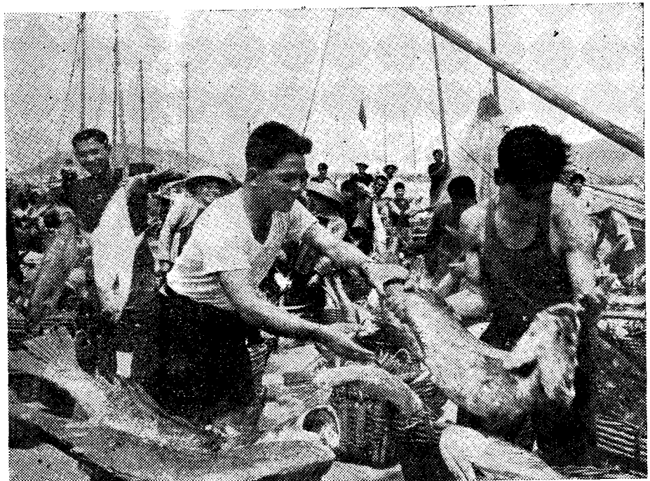
A good haul

F ISHERMEN and cadres in China's fishing areas have had all-round achievement in catching and cultivating aquatic products this year by exploiting and making full use of the country's rich fishery resources. According to statistics from 11 major fishing provinces, two municipalities and one autonomous region including Liaoning, Shantung, Shanghai, Fukien, Kwangsi, Hunan and Heilungkiang, the first half year's fish haul was over 10 per cent bigger than in the same 1970 period. The July and August catch was also more than in the previous corresponding slack season. At the same time, the fresh-water fish breeding area was ex-