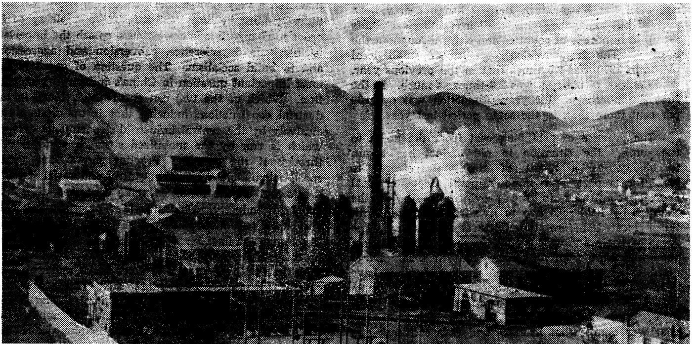
An iron-smelting plant at the small iron and steel complex in the Yentai Administrative Region, Shantung Province.

Still more important, this will set off mass movements and bring the enthusiasm of the masses for socialism into full play. This tremendous enthusiasm is the fundamental guarantee for building socialism.