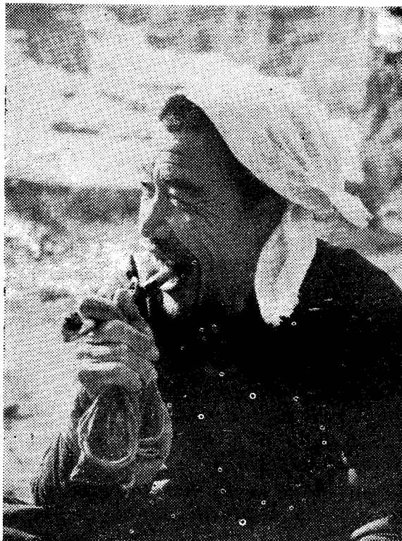
Comrade Chen Yung-kuei

Comrade Chen Yung-kuei is the secretary of the Party branch of the Tachai Production Brigade in Shansi Province — a red banner unit on China's farm front. He is also the first secretary of the Hsiyang County Party Committee, a secretary of the Shansi Provincial Party Committee and a Member of the Ninth Central Committee of the Chinese Communist Party.