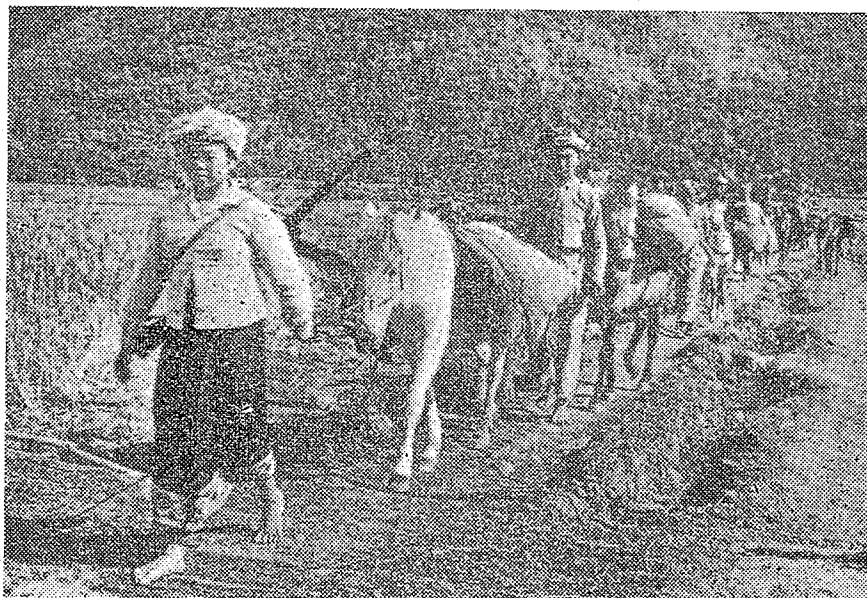
People of the Sam Neua Liberated Zone sending grain to support the front.

Among the parents sending their sons to the army is an old man of the Lao Theung nationality who in the old society hadn't a speck of land he could call his own and was savagely exploited by feudalism. Emancipated after liberation, he was given land and like other working people became masters in the new society. When he heard that the U.S. aggressors and their running dogs were attacking the liberated zone in the vain hope of again riding on the backs of the people, he told his second son to join the army and admonished him to guard the liberated zone with his life, so as to protect the fruits of victory. When news reached him that his son had gloriously given up his life in battle, the old man summoned his remaining three sons and told them: "Carry on the cause your brother left unfinished. Defeat the Yankee bandits, liberate the fatherland and avenge the death of our compatriots and your brother!" He then sent his three sons to join the army.