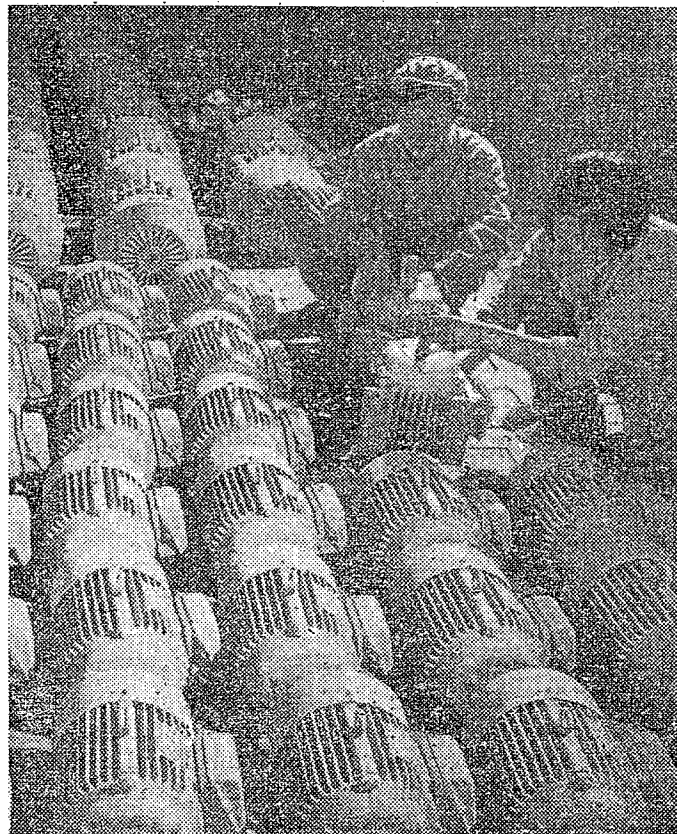
The Shulu County Electrical Machinery Manufacturing and Repair Plant in Hopei Province has made many 3-kw. motors to support agriculture. Workers are spraying paint on the motors.

Small iron and steel plants have gone up in about 300 counties and cities. A large-scale mass movement to locate coal deposits and set up coal-mines swept eight provinces and an autonomous region south of the Yangtze River. Their coal output last year increased by some 70 per cent, compared with 1969. This is ending their centuries-old irrational practice of depending on northern provinces for coal. Most counties and municipalities in Hunan Province have found coal reserves,