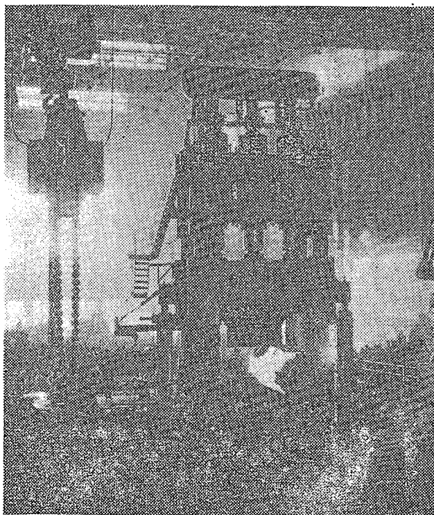
The Tientsin-made 6,000-ton hydraulic press is forging a big casting.

Compared with the same type of product made in China or abroad, this new press is relatively small and light and easy to operate, maintain and repair and can handle pieces of different sizes. The workers introduced new techniques for some parts and solved certain problems which had remained unresolved for this kind of product.