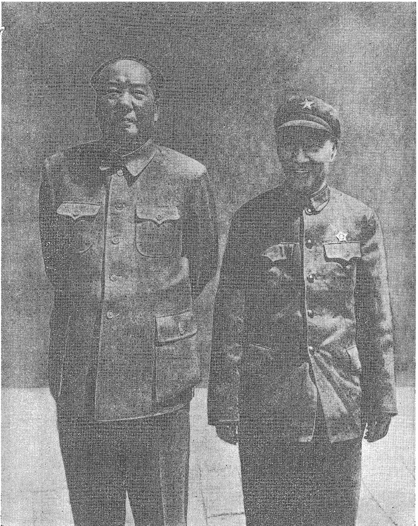
Our great leader Chairman Mao and his close comrade-in-arms Vice-Chairman Lin Biao