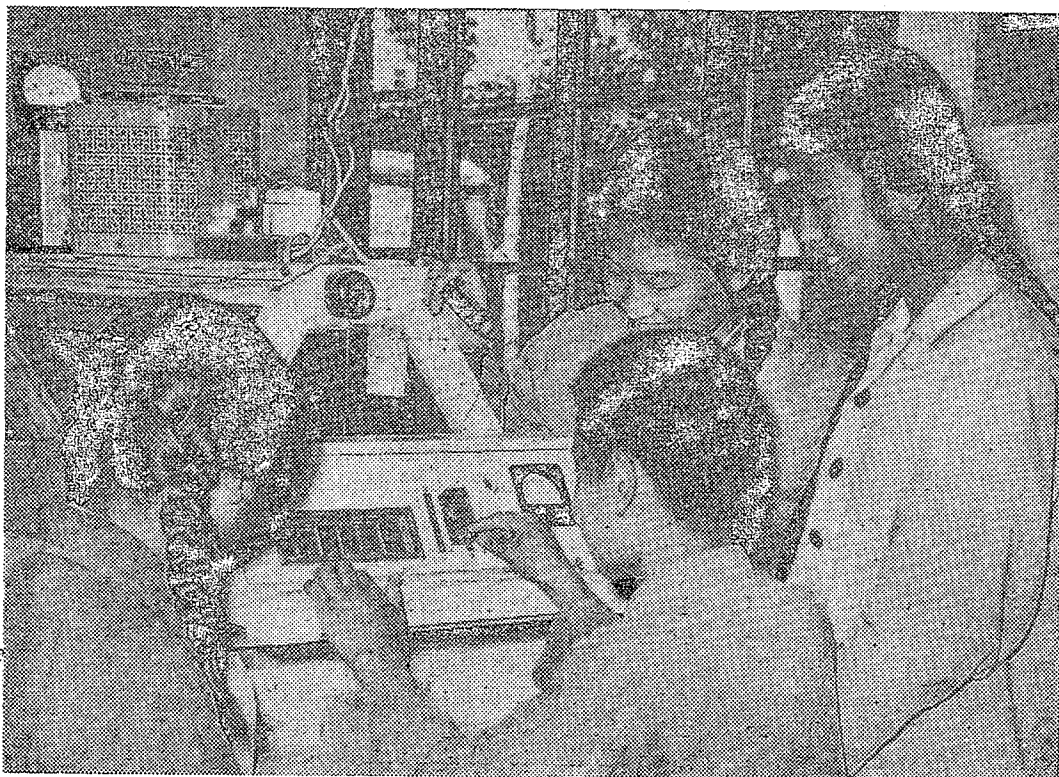
"Little workers" at the Peking No. 1 Middle School, which relies on its own efforts to run an electronics plant, examine a marginal ray display element with digital readings that they made. It can be used in electronic computer and radar meters.