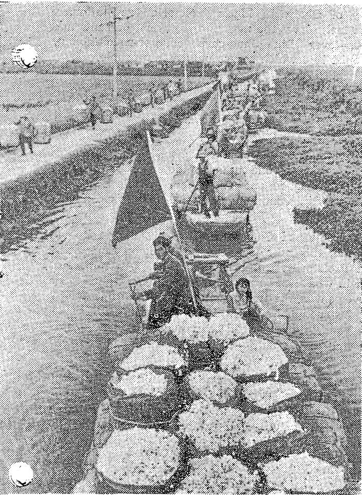
Overjoyed at their bumper harvest, members of the Nicheng People's Commune of Nanhui County on Shanghai's outskirts deliver and sell newly reaped cotton to the state.