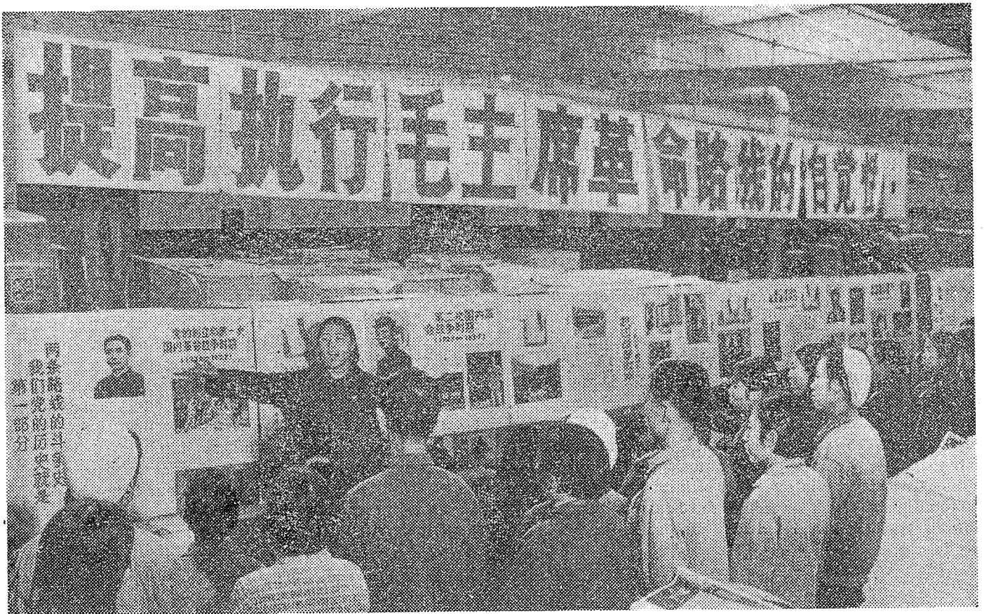
Responding enthusiastically to the call by the Second Plenary Session of the Party's Ninth Central Committee, workers, peasants and soldiers and revolutionary cadres all over the country have carried forward the mass movement for studying Chairman Mao's philosophical works. Workers of the Peking Hsinhua Printing House review the exhibition they themselves set up on the history of the struggle between the two lines within the Party.