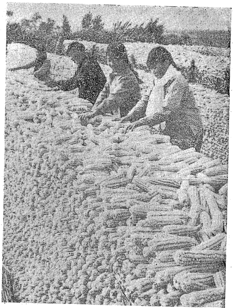
1970 was another bumper harvest year for the Nanchai Brigade in Pingku County on the outskirts of Peking. Members of the brigade used Chairman Mao's philosophical thinking as their guide to farming.