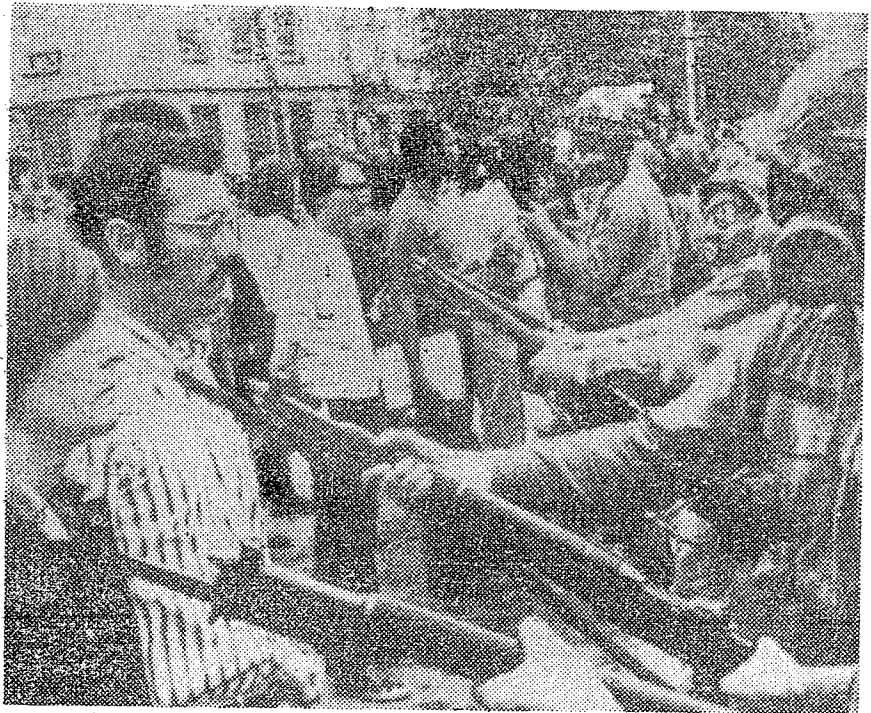
Ohio State University students courageously wage a face-to-face struggle with the reactionary troops and police to protest against the fascist “R.O.T.C.” programme.

Cops Ambushed. Police—a tool of the U.S. ruling clique in suppressing the people—have been attacked more and more frequently by the American people. According to U.S. official statistics, in 1969 there were 35,202 cases in which policemen on duty were attacked. This number more than doubled the 1963 figure. Last year saw a further increase, with attacks on policemen occurring in more than 50 cities. In New York City alone, there were more than 2,000 cases in the first eight months, involving 988 policemen killed or wounded, an increase of 80 per cent over the whole year of 1969. U.S. News & World Report noted in an article: “Police officers are being ambushed, shot by snipers, blown up by bombs, lured to lethal booby traps and slain or wounded in ‘shoot-outs.’” An inspector in Los Angeles said: “A few years ago a sniper attack against a police officer was almost unheard of. Now it is almost routine.” A U.S. official lamented: “1970 will go down as a year of violent attacks on police.”