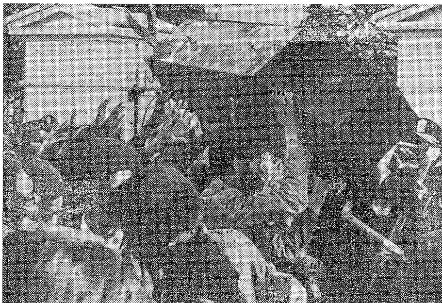
Afro-Americans demonstrate outside the White House to protest against U.S. imperialism's war of aggression in Viet Nam.

The successive explosions reflected the strong dissatisfaction of the American people with the reactionary foreign and domestic policies of the Nixon government. A young man in Berkeley said: "The great violence of the establishment in Viet Nam, Laos and elsewhere overshadows and almost blots out our violence, even bombs. And if our lesser violence stops the greater violence of the establishment, then how can it be wrong?"