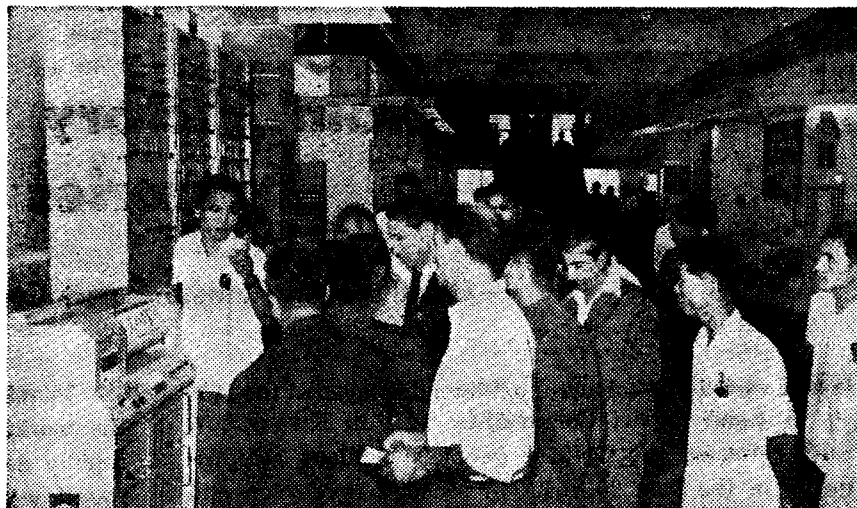
Foreign friends at China's Autumn Export Commodities Fair see the Dongfanghong-1 press facsimile.

The new-type Dongfanghong-100 horizontal boring machine turned out by the Shenyang No. 2 Machine Tool Plant, the new types of automatic internal grinding machine MZ-208 and automatic ball-bearing inner race grinding machine MZ-1310 made by the Wusih Machine Tool Plant were on display in the Machine-Building Pavilion and were all produced by workers in the high tide of the struggle-criticism-transformation movement by relying on invincible Mao Tsetung Thought. When the Chinchuan Machine Tool Plant in Paochi, Shensi Province, produced China's first QC-001