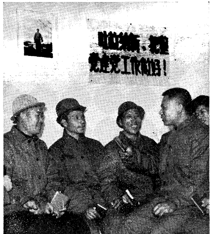
During the movement to consolidate the Party organization at the Muchengchien Colliery on Peking's outskirts, a Party member talks over Chairman Mao's instructions on the question of consolidating and building the Party with the revolutionary miners.

Educated in the Party consolidation movement, the majority of the Party members markedly raised their level of consciousness in class struggle and in the struggle between the two lines. However, the Party branch committee held that, as the revolution is constantly advancing, political-ideological work must not cease. In accordance with the great leader Chairman Mao's teaching "Ideological education is the key link to be grasped in uniting the whole Party for great political struggles," it organized the Party members to repeatedly study Chairman Mao's proletarian line on Party building, examine themselves in the light of the brilliant thinking embodied in the "three constantly read articles," relentlessly criticize Liu Shao-chi's "six sinister theories" in connection with concrete problems in their daily work and problems current in their minds, and further foster the proletarian world outlook of fearing neither hardship nor death and of continuing the revolution. Team No. 1 is an advanced unit. Some people thought that "there is no class struggle in an advanced team." The Party group in the team promptly organized a discussion on this question through which they all came to a clearer understanding of the fact that classes and class struggle exist throughout the historical period of socialism.