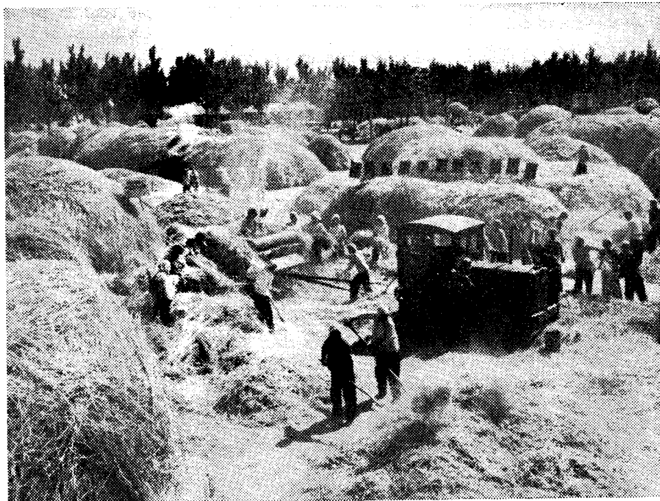
The Nantientzu Production Brigade of Shanhsien County, Shantung Province, reaps a rich wheat harvest this year. Cadres and commune members at work on threshing ground.

In the course of their struggle to win a rich harvest this year, the poor and lower-middle peasants and other commune members, under the leadership of the local revolutionary committees at all levels and out of their profound proletarian feelings of boundless love for our great leader Chairman Mao and boundless loyalty to him, carried the campaign to study and apply Mao Tsetung Thought in a living way to new heights and persisted in placing Mao Tsetung Thought in command of all their work. Keeping the problems they encountered in revolution and production in mind, they ran different types of Mao Tsetung Thought study classes in diligently studying and applying Mao Tsetung Thought in a living way. Using brilliant Mao Tsetung Thought as their weapon, they turned the fields into battlefields for revolutionary mass criticism and relentlessly criticized the counter-revolutionary revisionist line pushed by the renegade, hidden traitor and scab Liu Shao-chi so as to clear away its poisonous influence. The deepening of the mass campaign in the living study and application of Mao Tsetung Thought