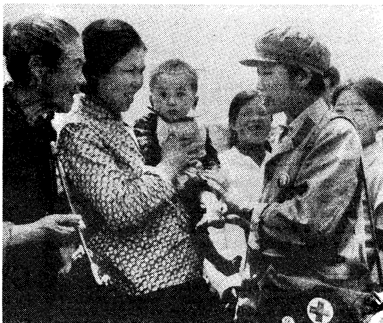
A member of a P.L.A. medical team happily talking with the family of a baby who was cured of the after-effects of infantile paralysis by this team. They are praising the victory of Chairman Mao's revolutionary medical line.

Following the teaching of the great leader Chairman Mao: "We should be modest and prudent, guard against arrogance and rashness, and serve the Chinese people heart and soul," the medical workers of the hospital today are making constant efforts to sum up their experience and are advancing courageously with even bigger strides along Chairman Mao's line in medical and health work.