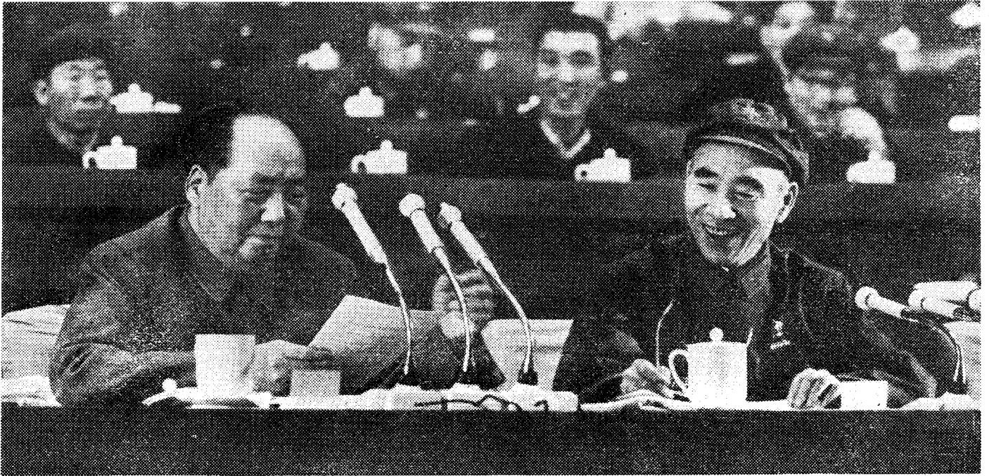
Our great leader Chairman Mao and his close comrade-in-arms Vice-Chairman Lin Piao on the rostrum at the plenary session on April 14.