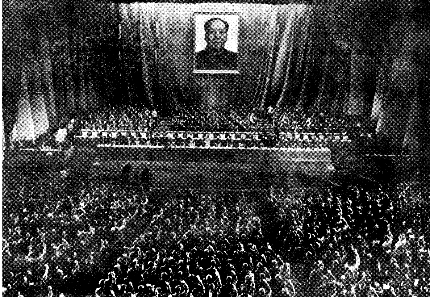
Our great leader Chairman Mao and his close comrade-in-arms Vice-Chairman Lin Biao, together with all the delegates, warmly celebrating the victorious close of the Party's Ninth National Congress on April 24.