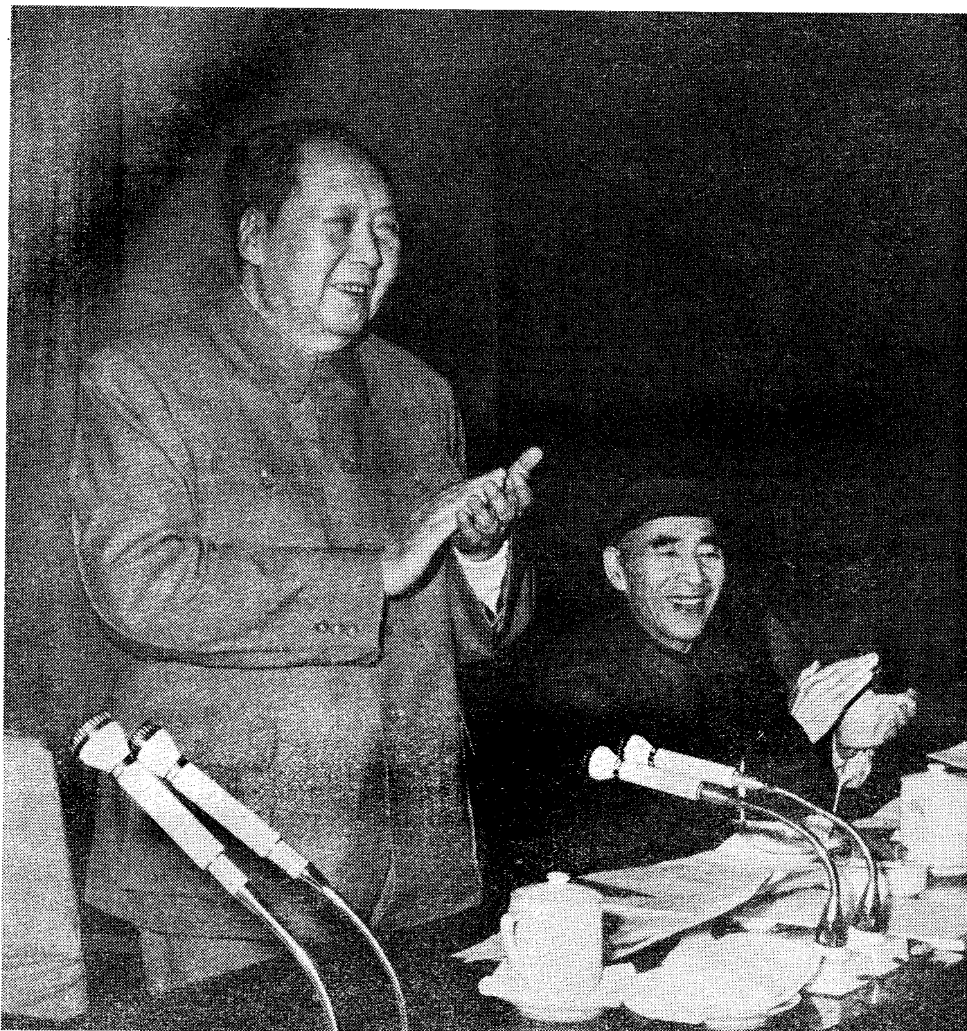
The great leader Chairman Mao and his close comrade-in-arms Comrade Lin Piao at the First Plenary Session of the Ninth Central Committee of the Communist Party of China.