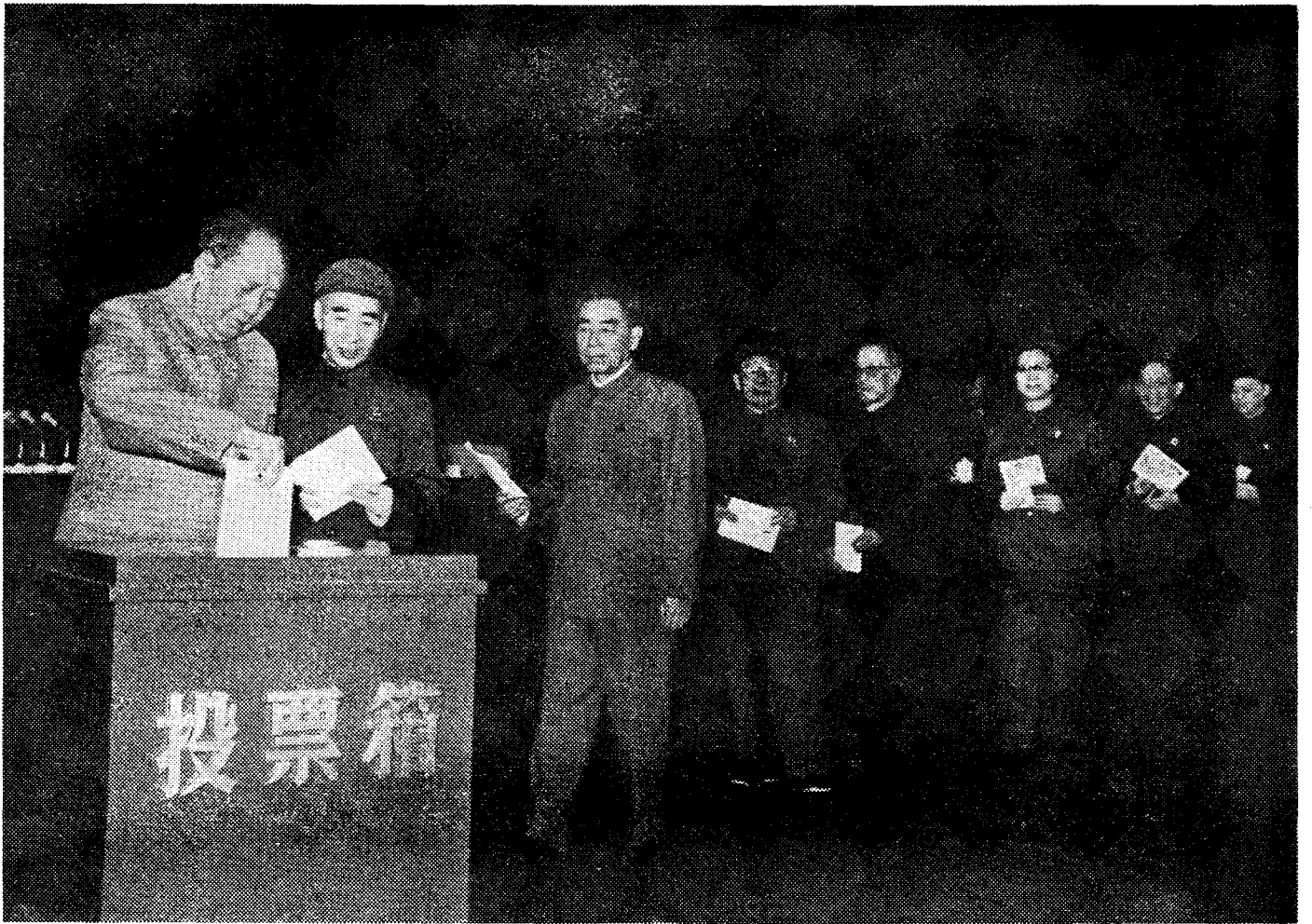
Our great leader Chairman Mao and his close comrade-in-arms Vice-Chairman Lin Piao, and Comrades Chou En-lai, Chen Po-ta, Kang Sheng, Chiang Ching, Chang Chun-chiao and Yao Wen-yuan voting to elect the Party's Ninth Central Committee at the plenary session on April 24.