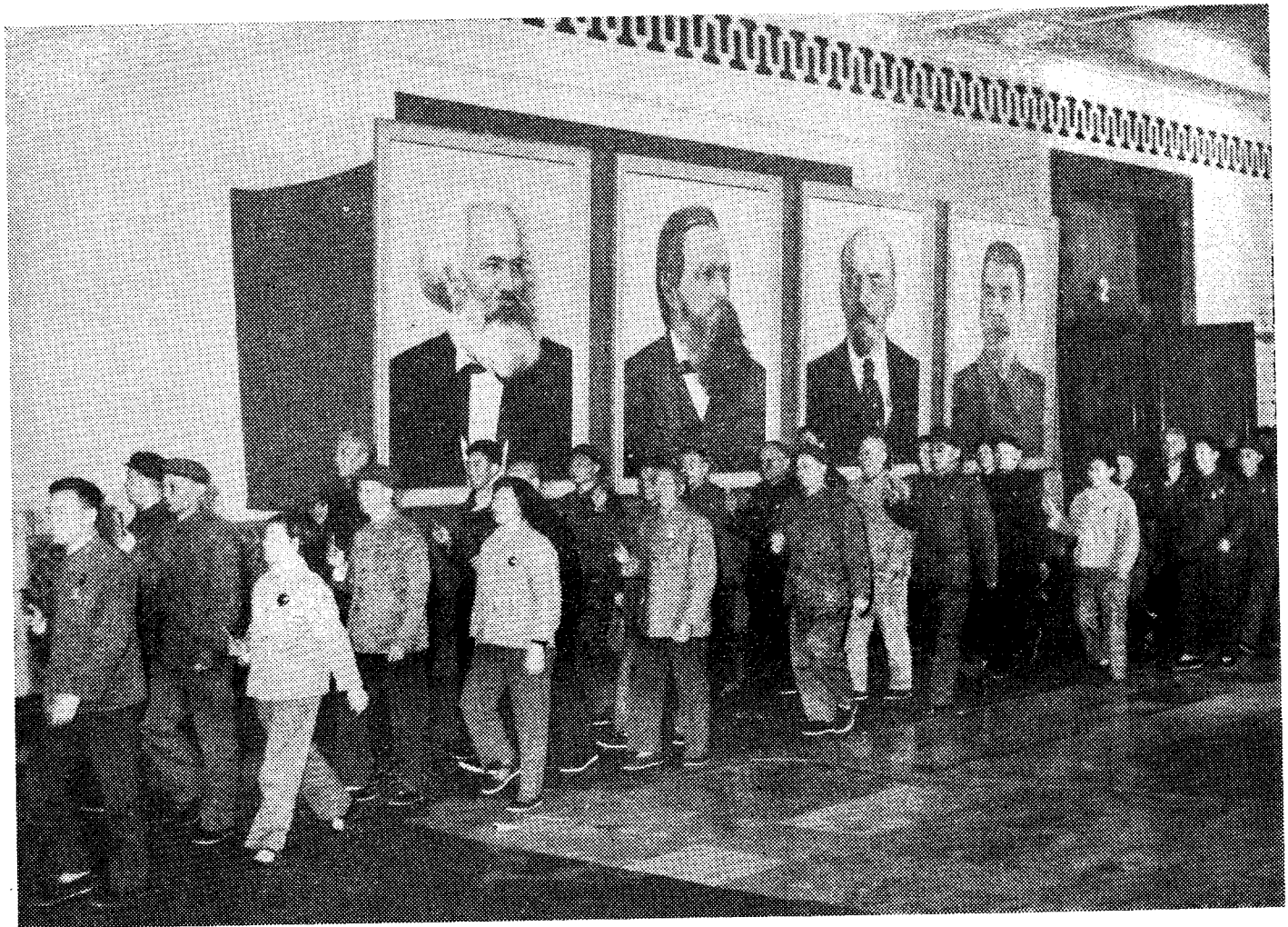
At the plenary session on April 14, delegates from different fighting posts entering the meeting hall full of revolutionary enthusiasm.