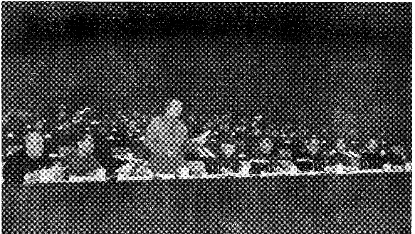
Our great leader Chairman Mao presiding over the plenary session on April 14.