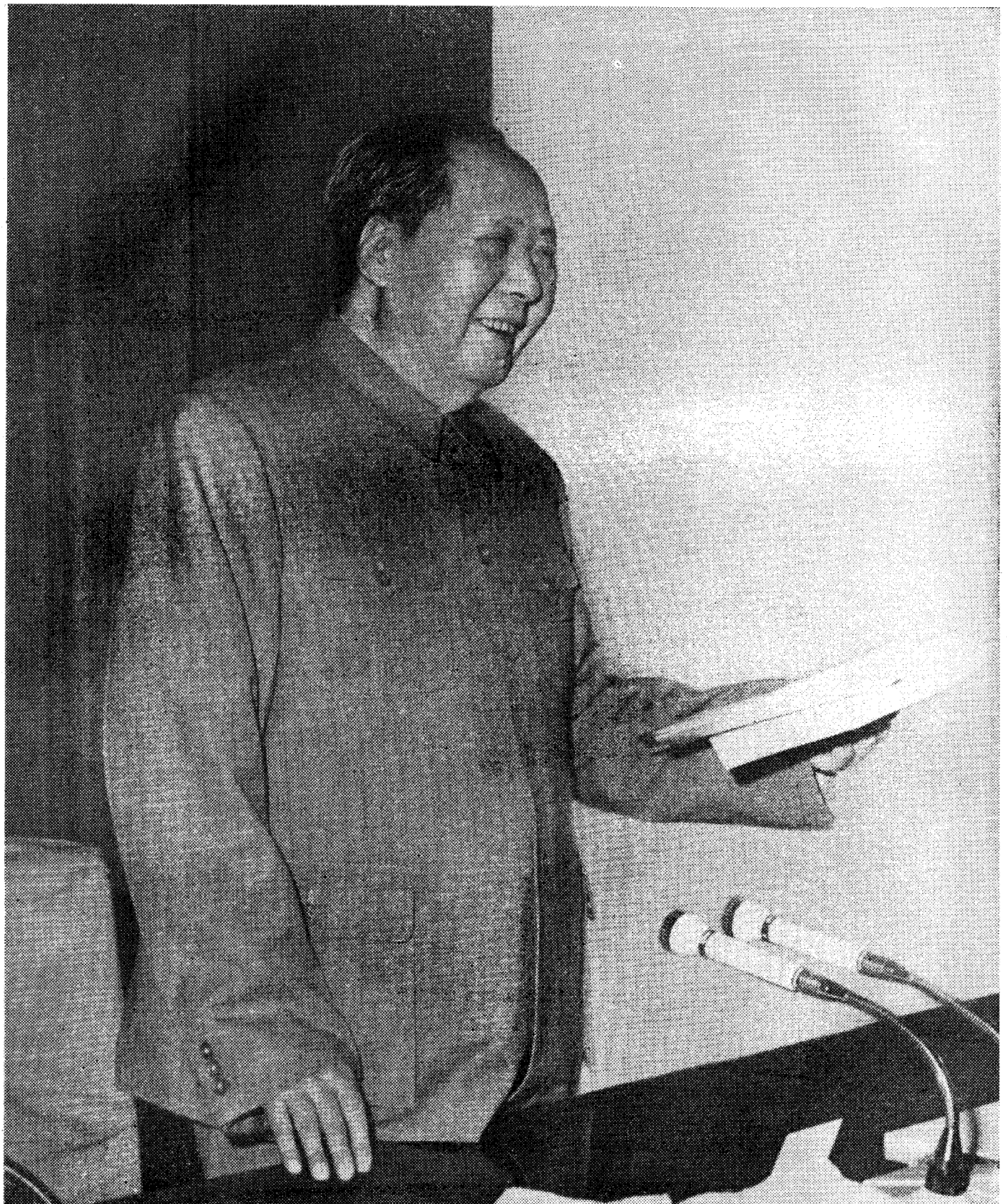
The Ninth Central Committee of the Communist Party of China held its first plenary session on April 28. Our great leader Chairman Mao presided over this session and made an extremely important speech.