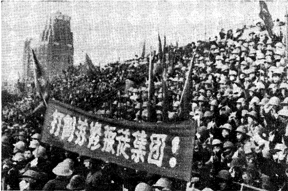
Shanghai's working class and revolutionary masses held rallies to voice their strong protest against Soviet revisionist armed provocations and express their resolute determination to overthrow the common enemy of the Chinese and Soviet peoples, the Soviet revisionist renegade clique.

certainly rise to overthrow the Soviet revisionist renegade clique's fascist rule. The broad masses of army-men and civilians pointed out: The Soviet revisionist renegade clique is the common enemy of the peoples of China and the Soviet Union. The peoples of the two countries have established a profound friendship in their protracted revolutionary struggles. Under the brilliant banner of Marxism, Leninism, Mao Tse-tung's thought, the Chinese and Soviet peoples will certainly unite still more closely and overthrow the new tsars once and for all.