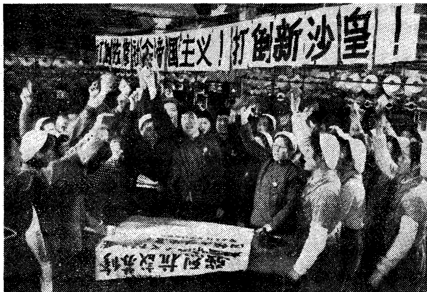
Revolutionary workers in all the workshops of the Peking General Knitwear Mill angrily denounce the Soviet revisionist renegade clique for its monstrous crime of committing armed encroachment on China's sacred territory. They resolutely support all actions of the heroic frontier guards of the People's Liberation Army in bravely defending our motherland's territory.

thought, we printing workers will turn out more, high-quality and well-printed Chairman Mao's revolutionary treasured works so that still more revolutionary people in the world can grasp Mao Tse-tung's thought—this spiritual atom bomb of incomparable power—for thoroughly smashing imperialism, revisionism and all reaction, and sweeping away all pests!