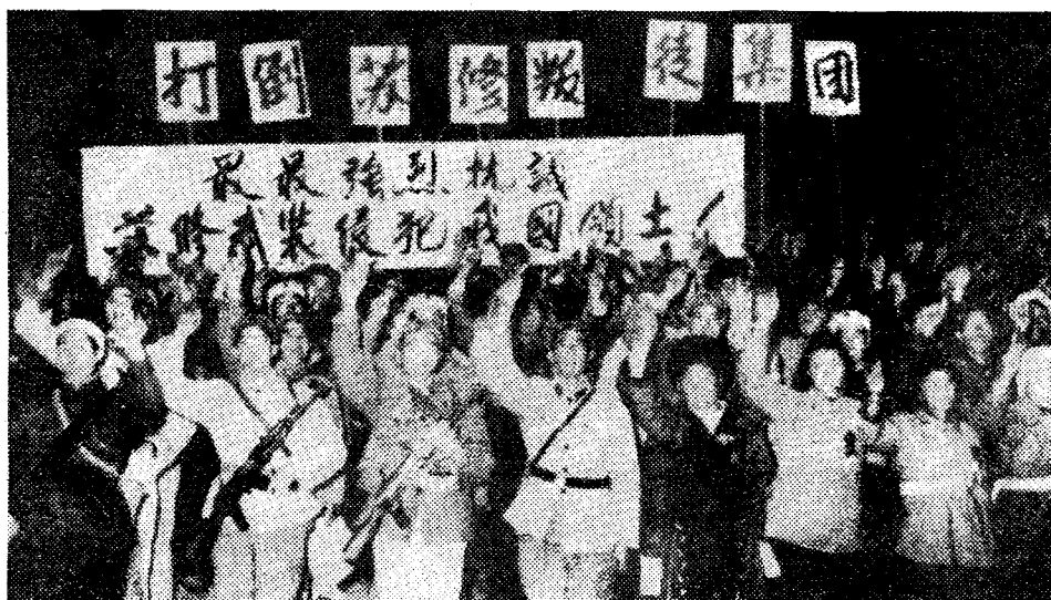
More than 100,000 armymen and civilians in Kweiyang and representatives of poor and lower-middle peasants from various parts of Kweichow Province held an angry protest rally on the night of March 3. They sternly denounced the towering crime of the Soviet revisionist social-imperialists, who, stepping into the shoes of the tsars, had flagrantly encroached upon China's sacred territory.

In the Sinkiang Uighur Autonomous Region, well over 2,500,000 revolutionary people of 13 nationalities had held protest meetings and demonstrations by March 8. On March 11, another million took to the streets in