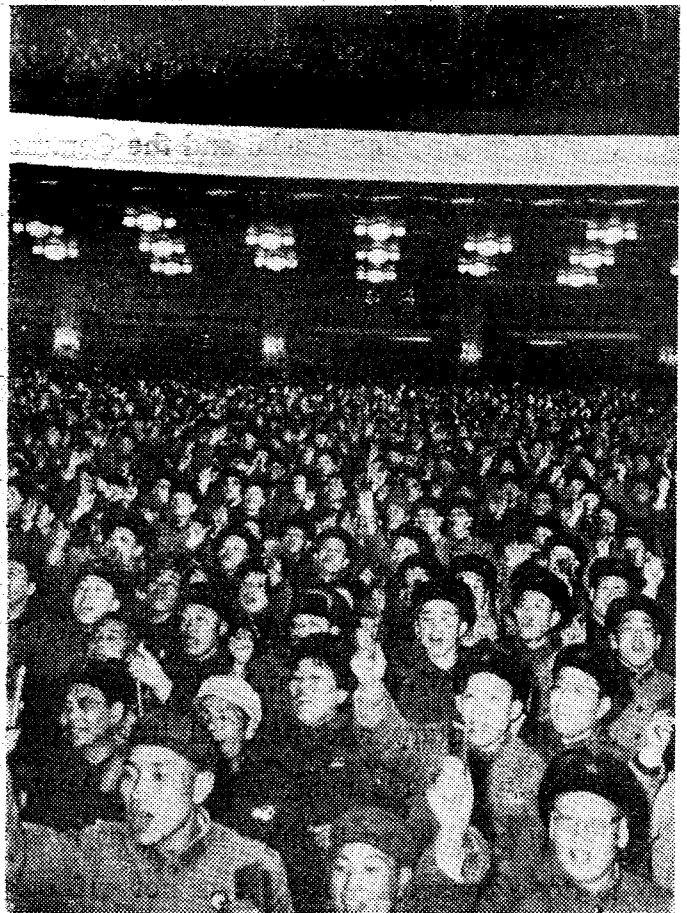
The red sun rises in the east. Deafening cheers ring out from the ranks. With boundless love and esteem for the great leader Chairman Mao, with boundless faith in him and boundless loyalty to him, the revolutionary fighters, waving their red revolutionary treasured books of Quotations From Chairman Mao Tse-tung , cheer again and again: "Long live Chairman Mao! A long, long life to Chairman Mao!"

Then, Chairman Mao and Vice-Chairman Lin Piao went to the centre of the rostrum and warmly shook hands with the responsible comrades of the various general departments, services, branches and academies of the Chinese People's Liberation Army