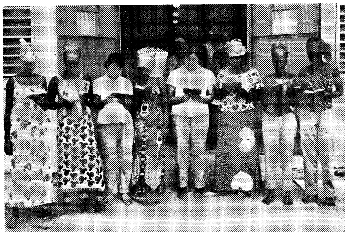
Workers of the Segou Textile Combine in Mali study Quotations From Chairman Mao Tse-tung together with Chinese experts every day before working hours.

A Chinese diesel engine worker coached several young Somali apprentices on how to operate the engine, including clearing the spare parts. He explained and showed them how to do this a great many times. Spreading out a blueprint in a corner of the construction site, one Chinese technician explained it over and