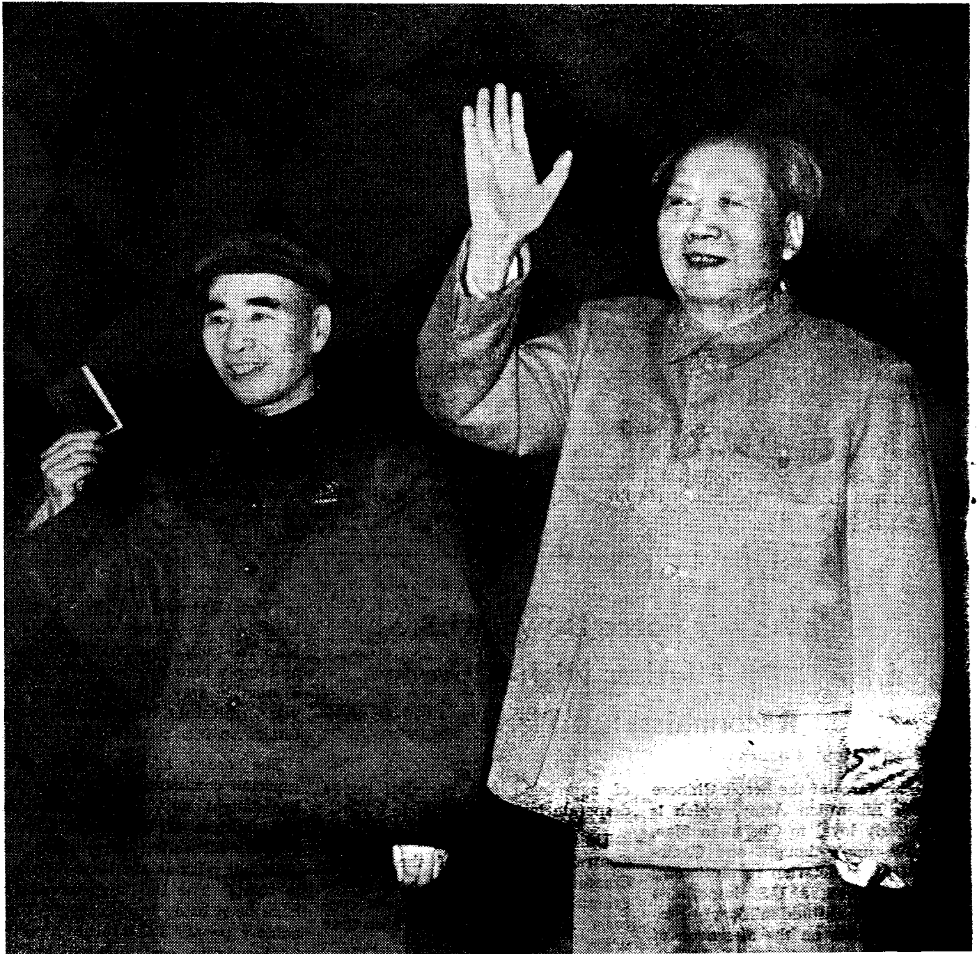
The reception of the revolutionary fighters by Chairman Mao and his close comrade-in-arms Vice-Chairman Lin Piao expresses the deepest solicitude for the hundreds of millions of the army-men and civilians of the nation and gives them the greatest inspiration; it affirms the firmest faith in them and is the greatest encouragement to them.

and those of the P.L.A. units in Peking, who were present at the reception. They led the latter to the front of the rostrum and, for a prolonged period, greeted the revolutionary fighters assembled in the hall by clapping their hands.