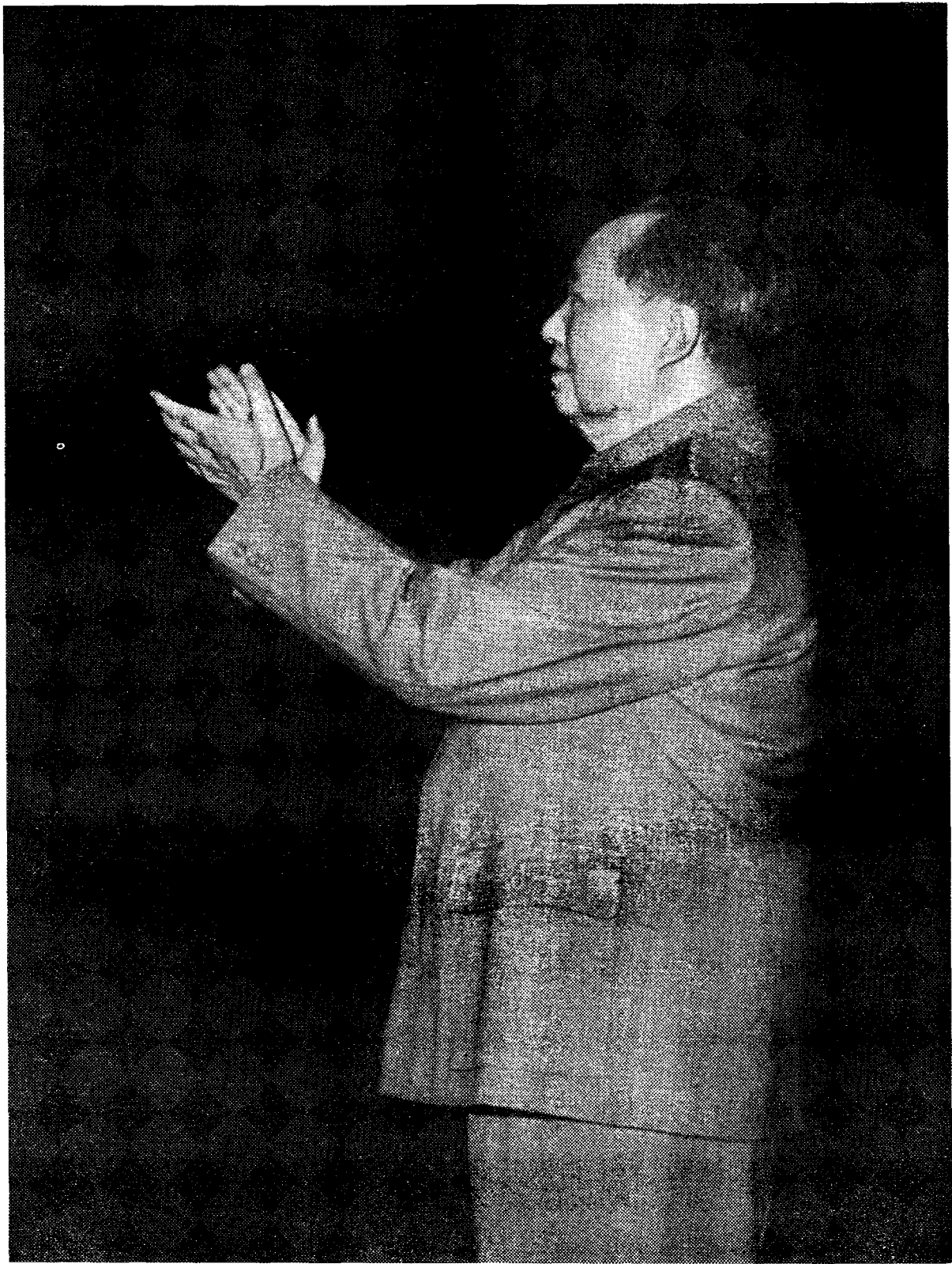
Chairman Mao, our great teacher, great leader, great supreme commander and great helmsman, and his close comrade-in-arms Vice-Chairman Lin Piao, on March 7 received over 10,000 revolutionary fighters from six branches and two academies of the Chinese People's Liberation Army. Giving a hearty greeting to the revolutionary fighters, Chairman Mao claps his hands.