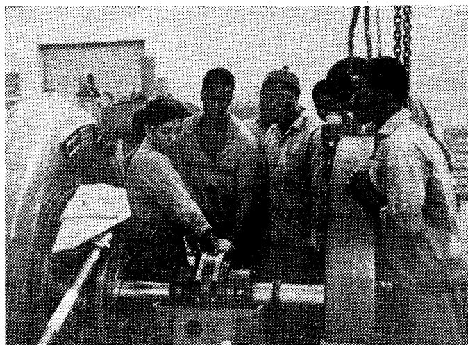
Treating Guinean workers as his class brothers, a Chinese expert enthusiastically and unreservedly shows them how to operate a machine.

Peasants from Zanzibar, Tanzania, at a Chinese hydraulic surveying team's camp, join Chinese experts in studying the teaching of Chairman Mao Tse-tung: "Give full play to our style of fighting—courage in battle, no fear of sacrifice, no fear of fatigue, and continuous fighting."