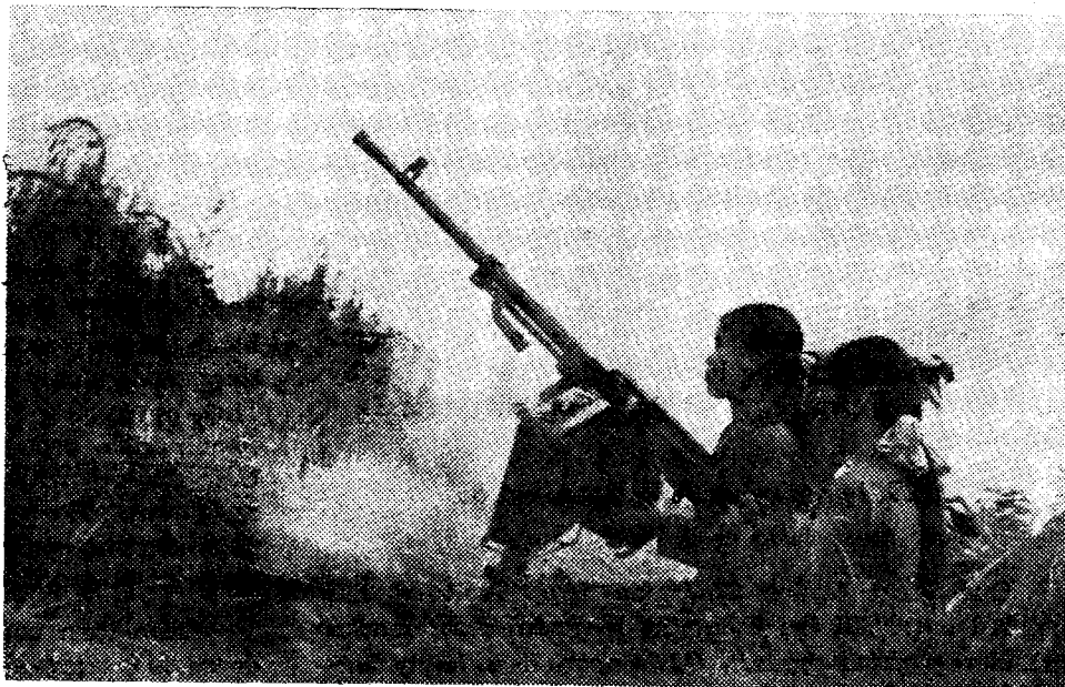
Vietnamese militia, at battle station, ready to punish U.S. air pirates.

During the first two years of the war against U.S. aggression and for national salvation, this anti-aircraft battalion saw service all the time, carrying on mobile operations on one battlefield after another where the fighting was the fiercest. They have gone through all kinds of difficulties and hardships, covering a distance of 120,000 kilometres and fighting more than 400 heroic