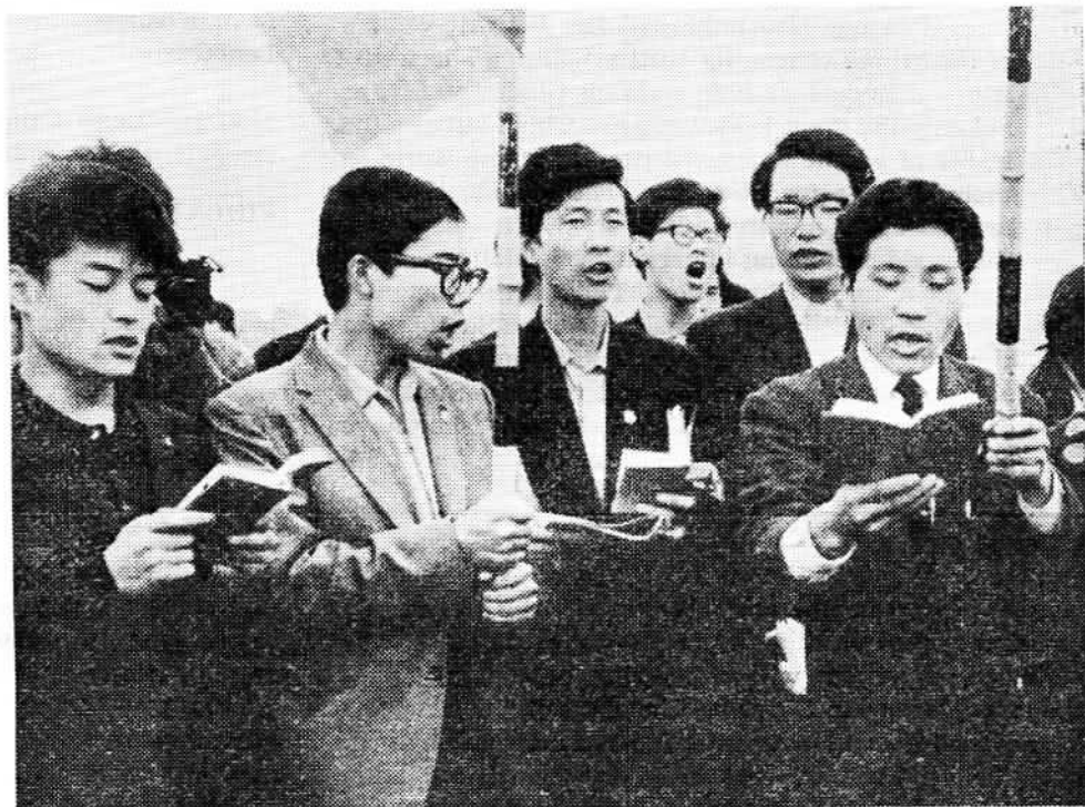
Revolutionary Japanese youth have infinite love for Chairman Mao. Wherever they go, they never forget to study Chairman Mao's works. These young revolutionaries in Tokyo are reading the treasured red book Quotations From Chairman Mao Tse-tung .