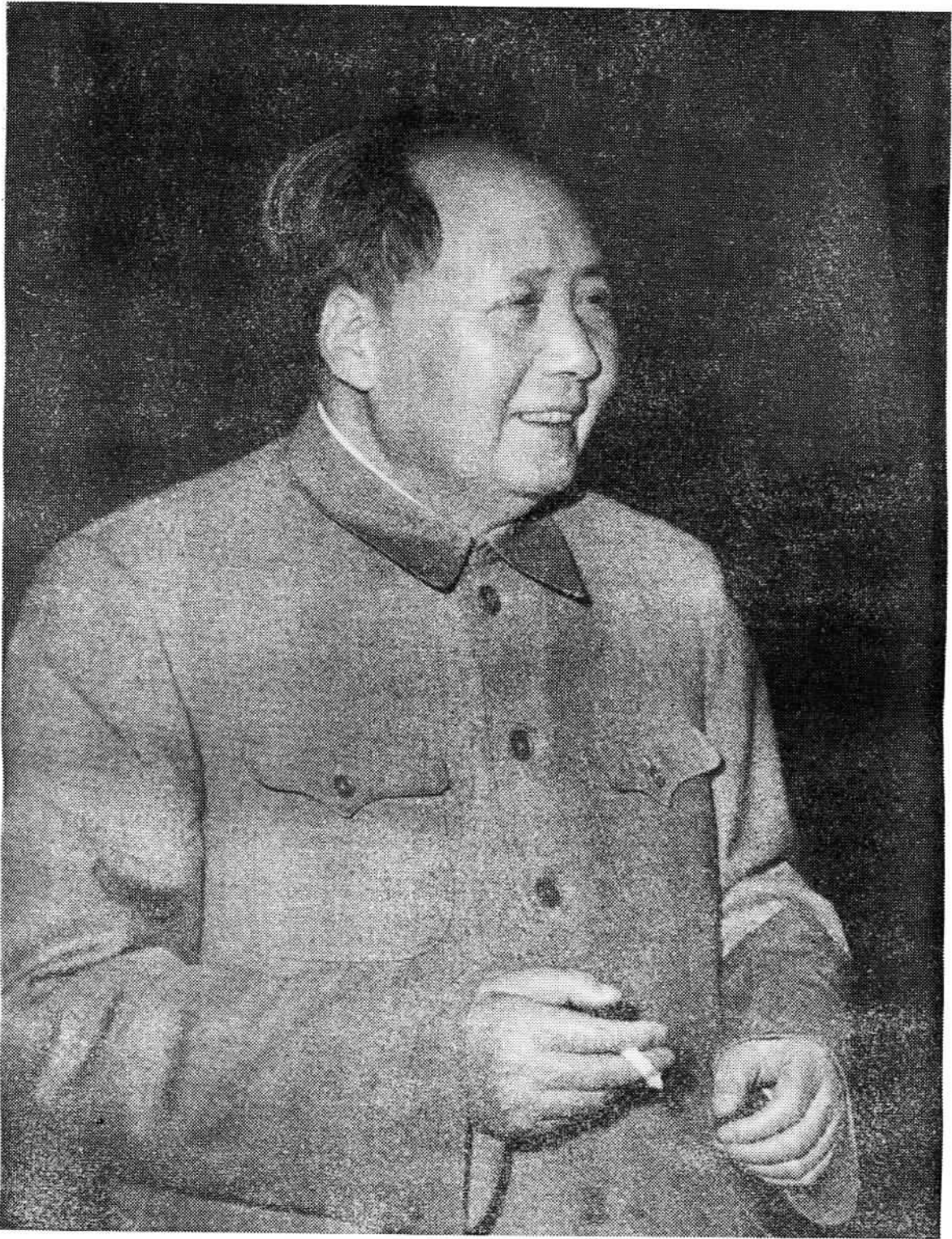
Chairman Mao Tse-tung

Our great teacher, great leader, great supreme commander and great helmsman