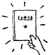
"Quotations From Chairman Mao Tse-tung"

"You must concern yourselves with state affairs and carry the great proletarian cultural revolution through to the end!" Chairman Mao has told us. And under his leadership we have set going the great proletarian cultural revolution, which is going ahead vigorously, to make sure that our proletarian land will never change its political colour in all the generations to come.