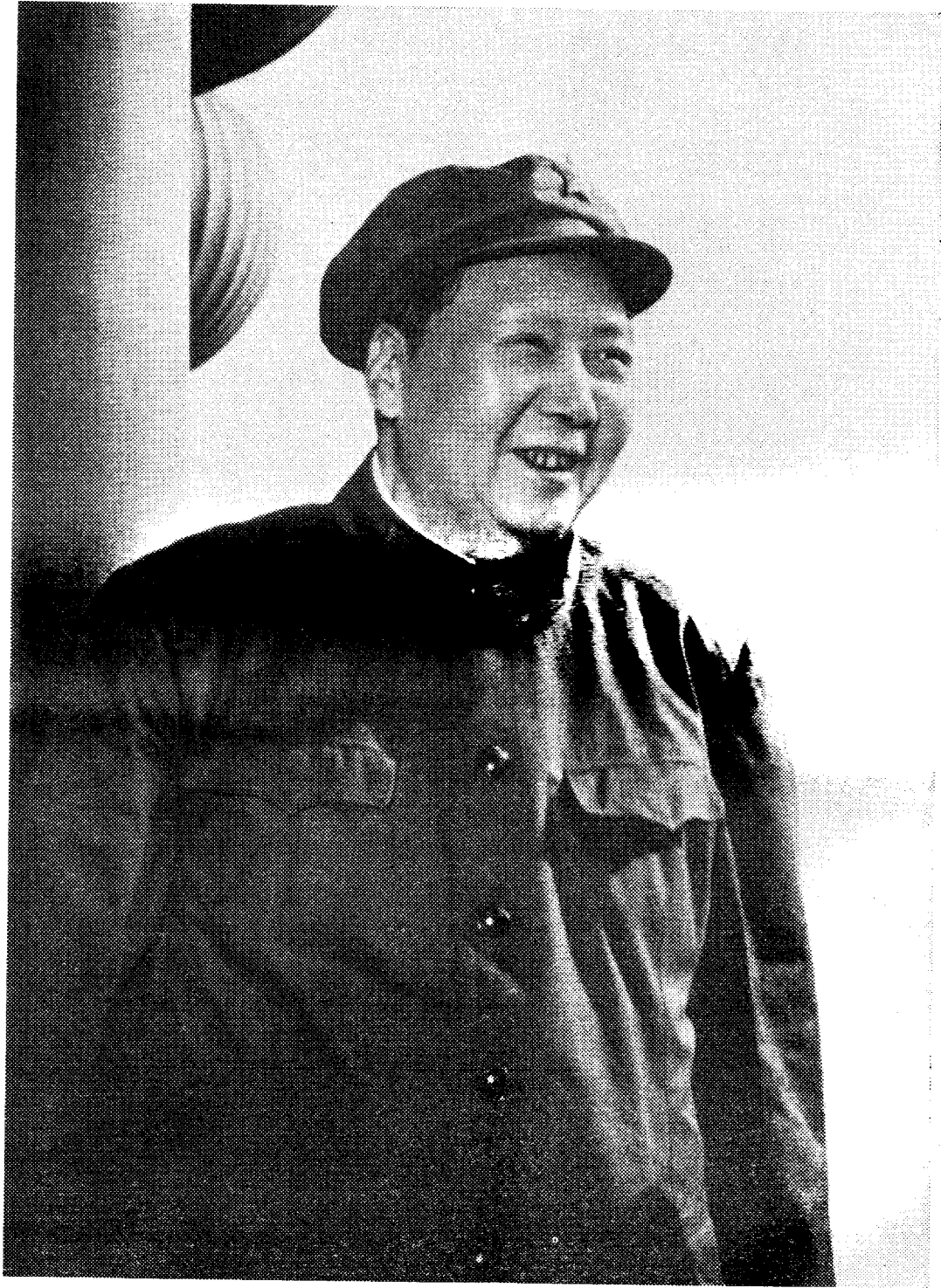
Chairman Mao Tse-tung

Our great teacher, great leader, great supreme commander and great helmsman