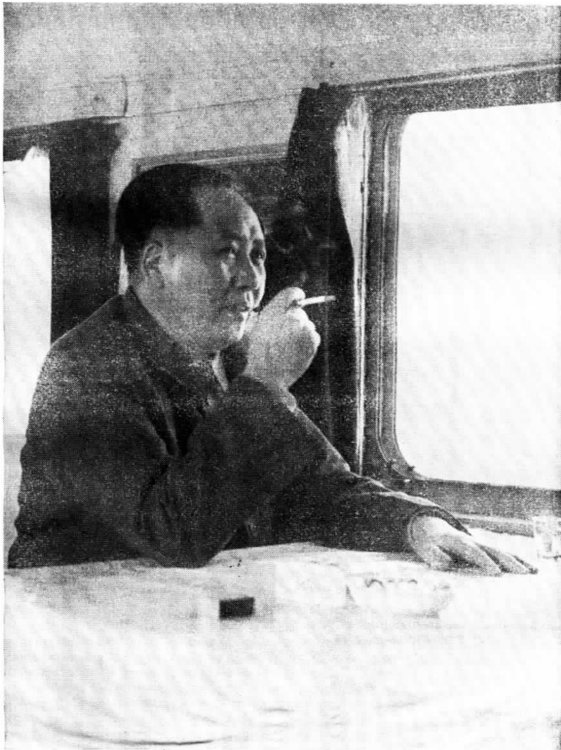
Chairman Mao Tse-tung

Our great teacher, great leader, great supreme commander and great helmsman