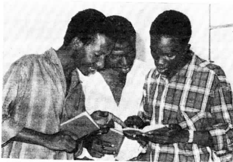
Guinean workers studying Quotations From Chairman Mao Tse-tung