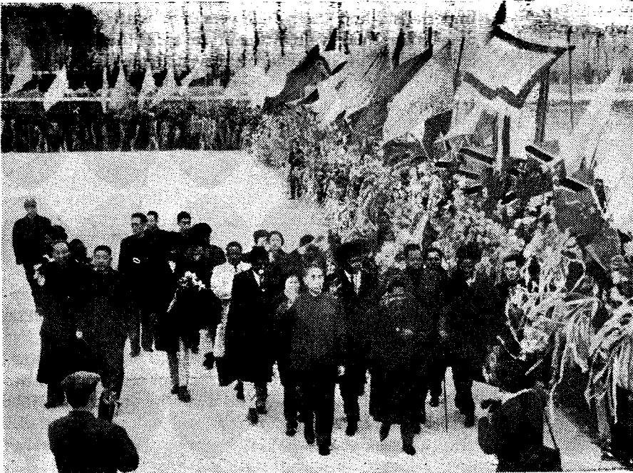
Vice-President Kawawa, accompanied by Premier Chou En-lai, waves to welcomers at Peking airport

This is Vice-President Kawawa's second friendship visit to China. Following his first visit in June last year, and the state visit of President Nyerere in February this year, during which the friendship treaty was signed, the relations of friendship and co-operation between the two