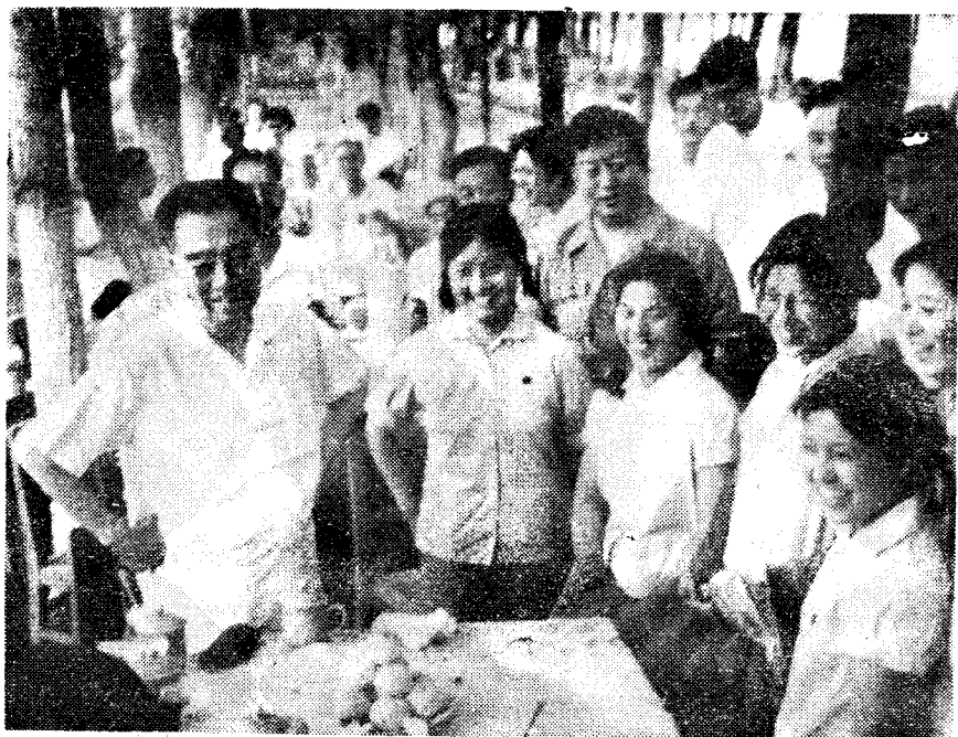
Premier Chou meets Shanghai youths in Sinkiang

People's rule in Tibet has shown its power in boosting grain and livestock production, industry and trade with a consequent swift rise in the living standards of the people.